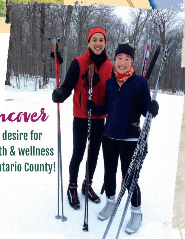
Nordic Skiing at Bristol Mountain, Canandaigua

Uncover your desire for health & wellness in Ontario County!