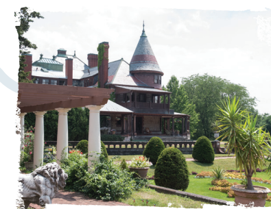
Sonnenberg Gardens & Mansion State Historic Park, Canandaigua

taste.ny.gov/store/finger-lakes-welcome-center