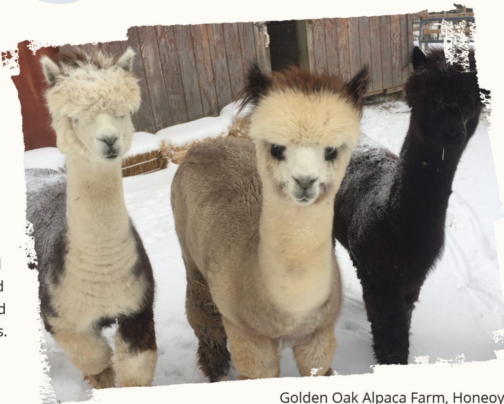
Golden Oak Alpaca Farm, Honeoye

C heck out a fresh experience as you visit and explore the local farms and markets that have provided healthy fun for generations.