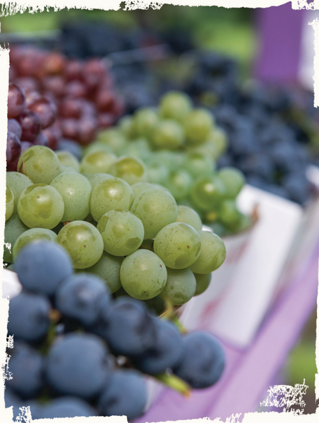
Jerome's U-Pick, Naples