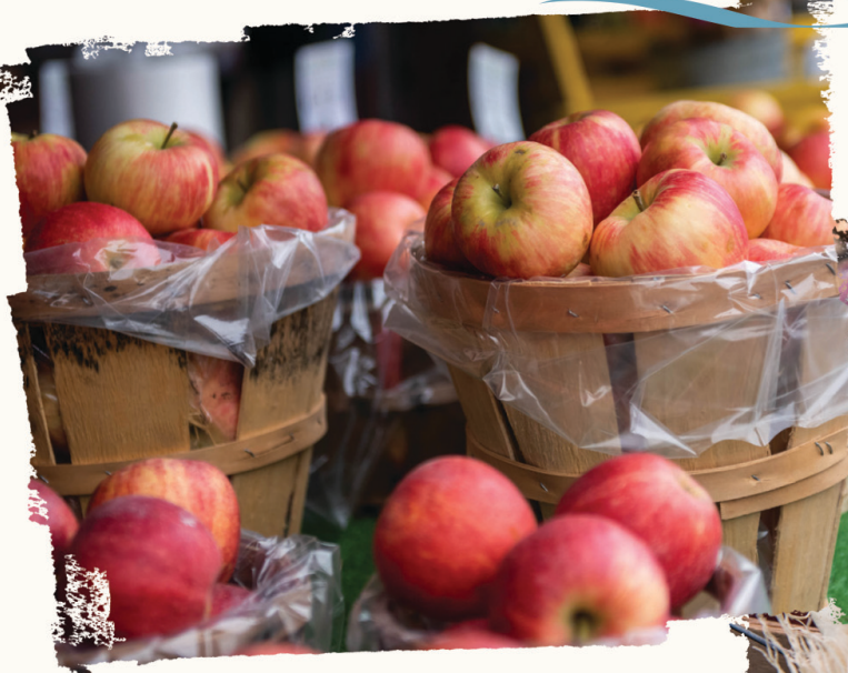
Joseph's Wayside Market, Naples