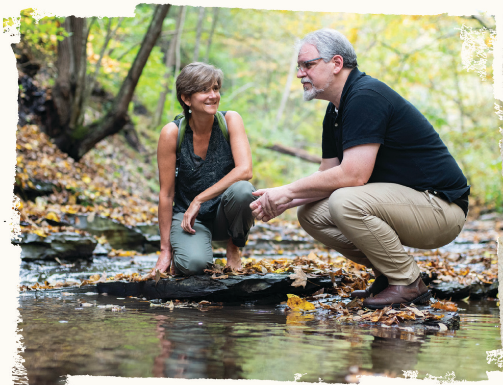
Finger Lakes Forest Immersion, Naples

Stretch it out at a yoga class or take some “me time” at one of our local salons and spas. Center yourself during your next Finger Lakes retreat and hit the reset button at one of these local spots.