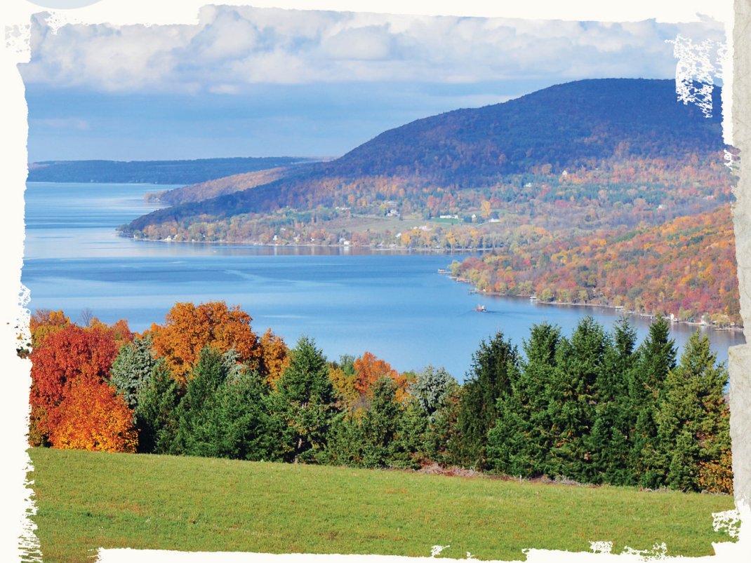
County Road 12 Scenic Overlook, Naples

L ooking for your next photo op? Get picture-perfect memories by visiting one of our top scenic spots in Ontario County.