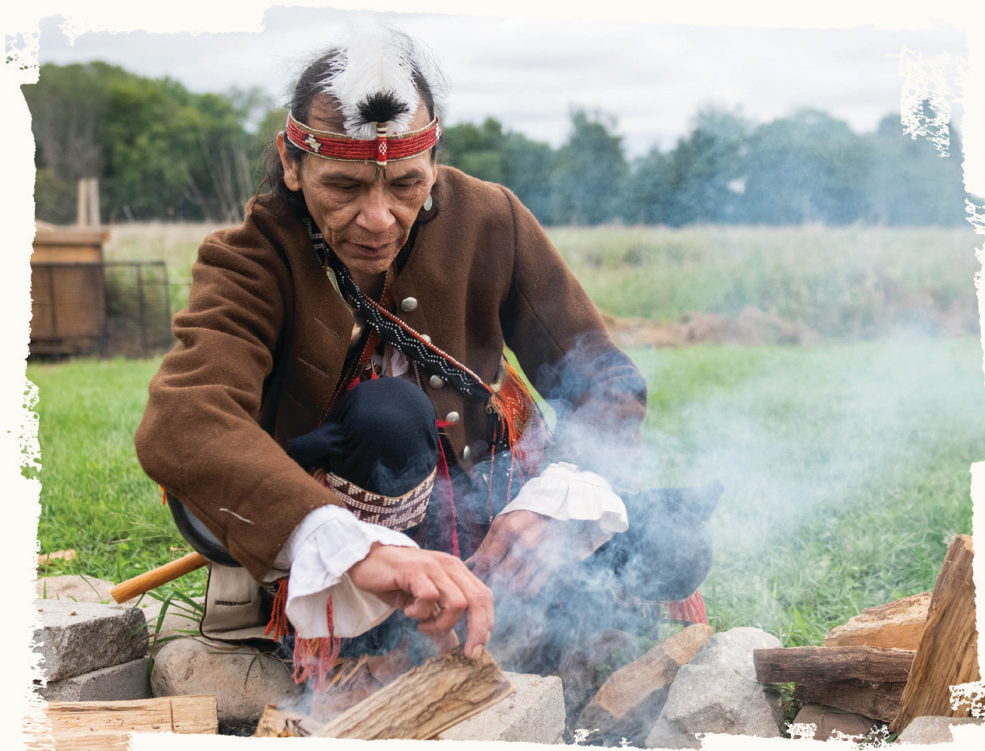
Ganondagan State Historic Site/Seneca Art & Culture Center, Victor

T ravel is as much about expanding your mind as it is about getting away from it all. From the Iroquois' use of white corn in the 1600s, to the medical sulfur springs used as health spas in the 1800s, experience a mindful experience to enrich your soul.