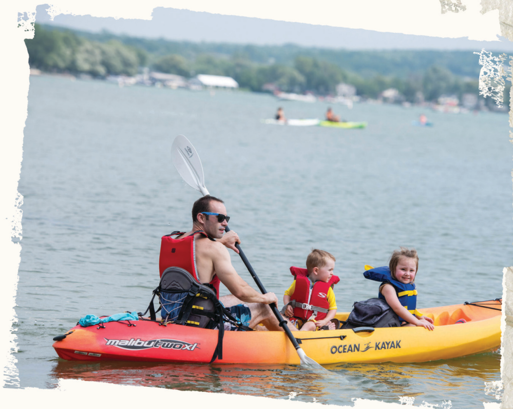
Canandaigua Sailboarding, Canandaigua

Choose from a variety of heart-pumping activities during your time in the Finger Lakes, from biking and walking to swimming and skiing. With trails galore, keep your heart rate up while taking in the sites, no matter the season.