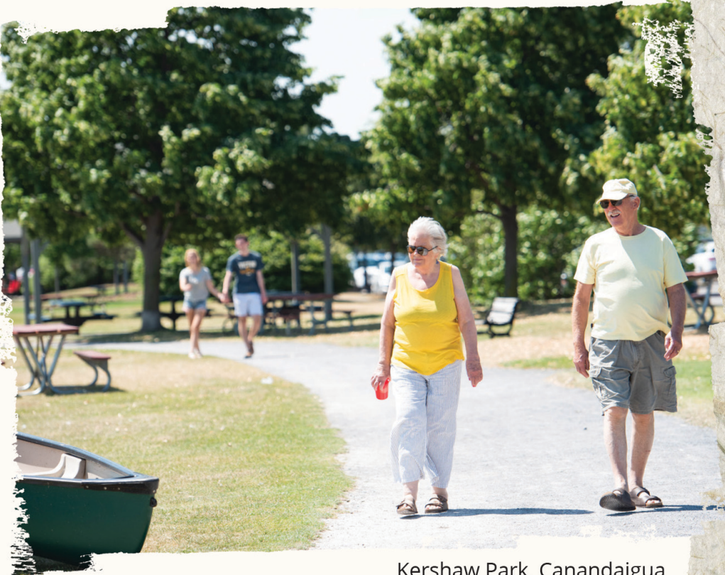
Kershaw Park, Canandaigua

O ur parks and playgrounds are favorite go-to spots for kids and parents alike. Pick a spot, then prepare for you and your crew to be entertained for hours on end.