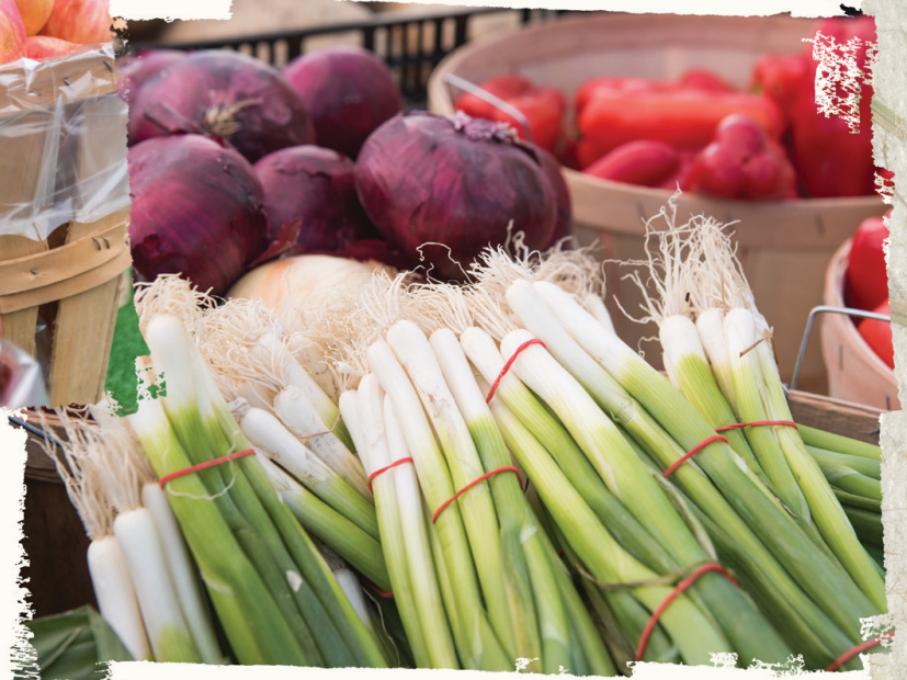
Farmers Markets, Canandaigua, Victor, Geneva