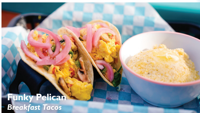
Funky Pelican Breakfast Tacos

For more information on restaurants and bars in Palm Coast and the Flagler Beaches, visit our website at www.visitflagler.com