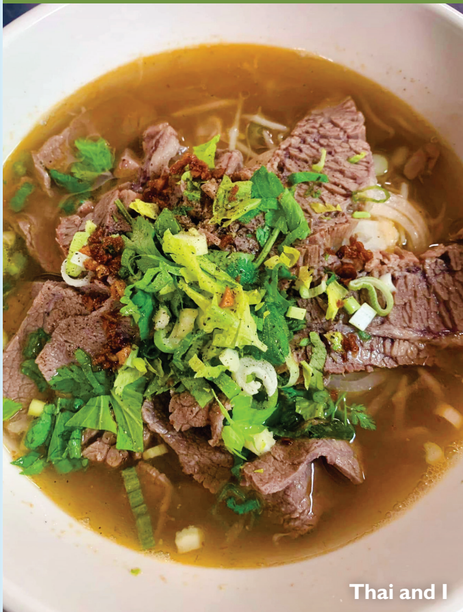
Thai and I