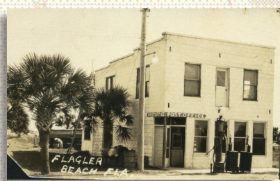
7. Wickline Store

3. Golden Sands Apartments (209 S. Second Street) – In 1947, Pal and Irma Parker, encouraged by her brother Walter Green who then owned the Flagler Beach Hotel, moved from Atlanta to Flagler Beach. Their Golden Sands Apartments were intended for vacationers and advertising touted the central location of Flagler Beach to “North Central and East Florida” attractions, as well as the 652-foot fishing pier and the beach.