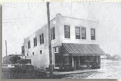
2. Upson House