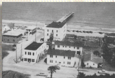
5. Ranger Apartments