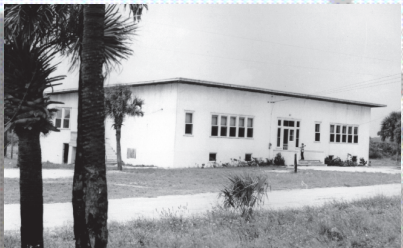
10. Flagler Beach School