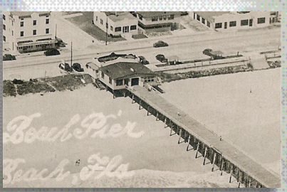
11. Flagler Beach Pier