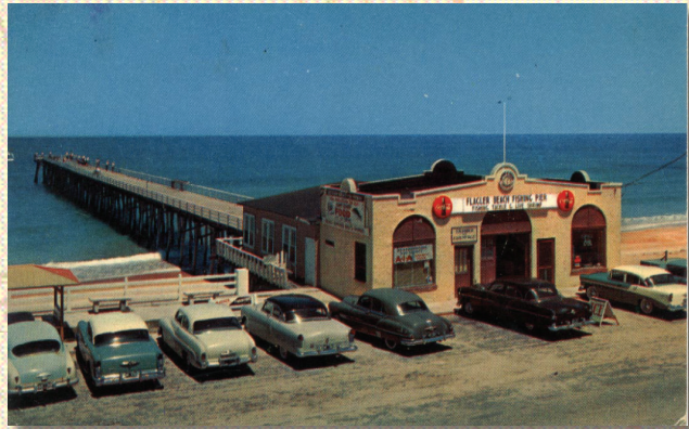
Flagler Beach Pier ~ circa 1960

Welcome to the Flagler Beach Historical Museum & Flagler County Visitor's Center Open 7 Days: 10am-4pm