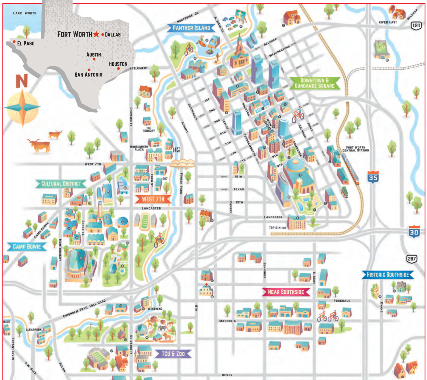
FORT WORTH CITY OVERVIEW