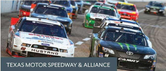
TEXAS MOTOR SPEEDWAY & ALLIANCE

This growing area just north of downtown offers high-speed thrills at Texas Motor Speedway. Known as “The Great American Speedway,” Texas Motor Speedway is one of the best and largest sports stadiums in the U.S. and home to the world’s largest HD video screen, nicknamed “Big Hoss.” Enjoy shopping fun at one of the largest sports and outdoors stores in North Texas, see millions of dollars made before your eyes at the Bureau of Engraving and Printing or enjoy an ideal golf getaway at the DFW Marriott Hotel and Golf Club at Champions Circle.