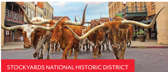
STOCKYARDS NATIONAL HISTORIC DISTRICT

The Fort Worth Cultural District features five internationally recognized museums: Kimbell Art Museum, Modern Art Museum of Fort Worth, Amon Carter Museum of American Art, Cowgirl Museum & Hall of Fame and Fort Worth Museum of Science and History, in a beautiful, park-like setting. This remarkable collection of museums in a single location has made Fort Worth a major destination for lovers of art and architecture.