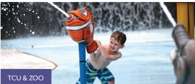
TCU & ZOO

Located on the north side of downtown Fort Worth, Panther Island is thriving with entertainment and outdoor recreation. Here you will find Panther Island Pavilion - the only waterfront stage in Texas, Panther Island Brewing, Coyote Drive-In Movie Theatre, watersports like Cowtown Wakepark and Backwoods Paddlesports. Exciting events throughout the year include Rockin’ the River an annual summer concert series on the Trinity River.