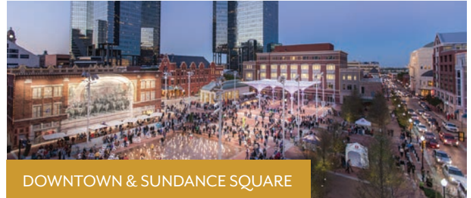
DOWNTOWN & SUNDANCE SQUARE

This growing area just north of downtown offers high-speed thrills at Texas Motor Speedway. Known as “The Great American Speedway,” Texas Motor Speedway is one of the best and largest sports stadiums in the U.S. and home to the world’s largest HD video screen, nicknamed “Big Hoss.” Enjoy shopping fun at one of the largest sports and outdoors stores in North Texas, see millions of dollars made before your eyes at the Bureau of Engraving and Printing or enjoy an ideal golf getaway at the DFW Marriott Hotel and Golf Club at Champions Circle.