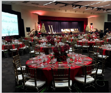
Round Up Inn