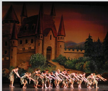
Will Rogers Auditorium