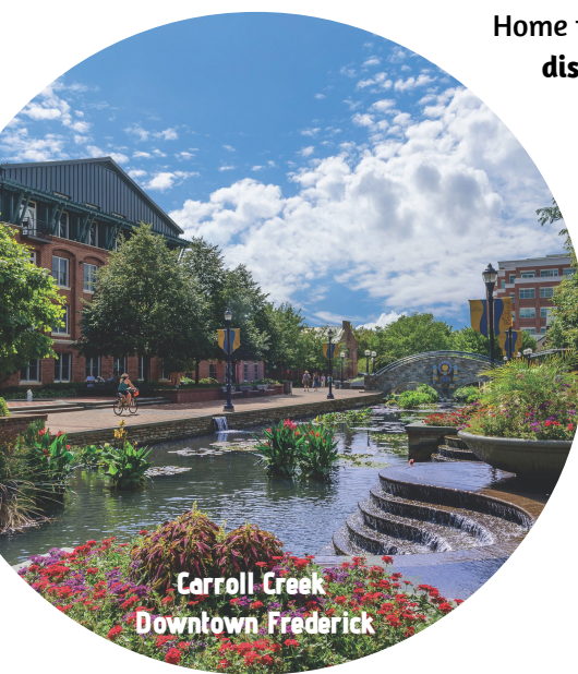
Carroll Creek Downtown Frederick

Over 200 specialty shops and dozens of restaurants with cuisines for every palate. Spend time browsing everything from handmade jewelry , to trendy clothing , gourmet teas and artisanal chocolates . Sip a cocktail infused with local gin, grab dinner along Carroll Creek and indulge in a decadent desert all within a few blocks.