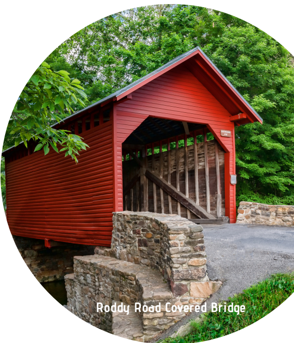
Roddy Road Covered Bridge

Country roads lead to three historic covered bridges on our Covered Bridges Driving Tour . Learn about the life and legacy of the first American-born Saint at the National Shrine of St. Elizabeth Ann Seton . Experience one of the oldest American replicas of the Lourdes shrine in France at the National Shrine Grotto of Lourdes .