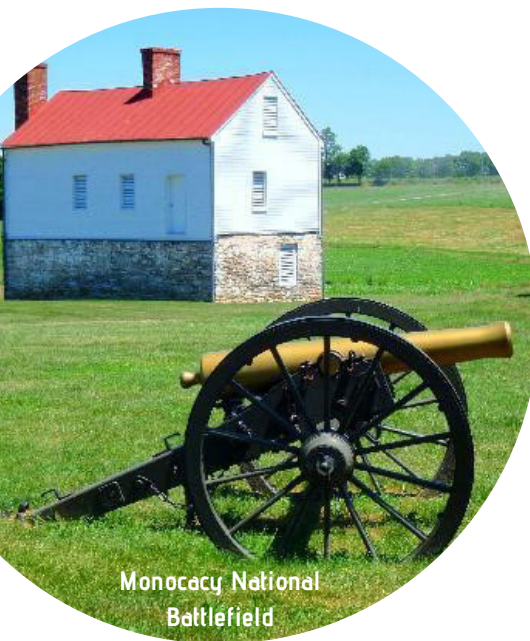
Monocacy National Battlefield

History enthusiasts seek out Civil War history at Monocacy National Battlefield , the one-day "Battle that Saved Washington." At the National Museum of Civil War Medicine , learn about the brilliant innovations of Civil War Medicine. Continue with the story of the Civil War at the nearby battlefields of Gettysburg , Antietam and Harpers Ferry .