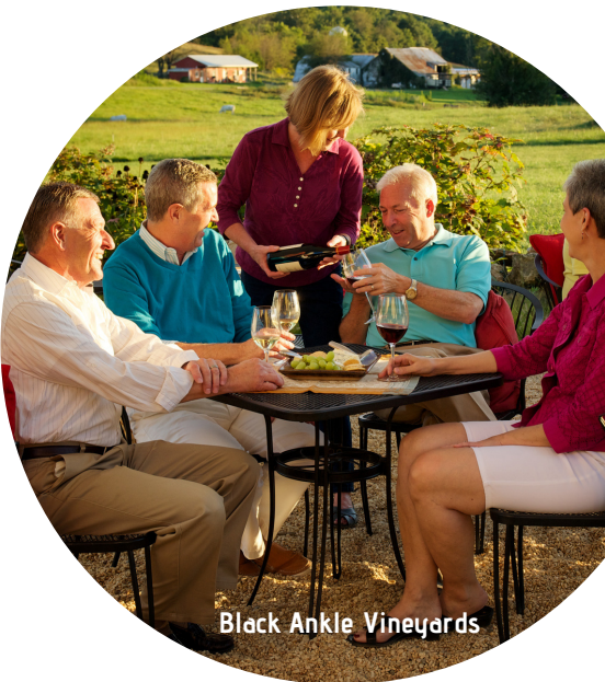
Black Ankle Vineyards

Taste the local flavors at dozens of tasting rooms in Downtown Frederick and in the scenic countryside. Home to Mayrland's first cidery, meadery, organic distillery and farm brewery , Frederick is on the cutting-edge of craft beverages.