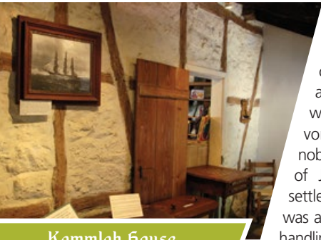
Kammlah house at Pioneer Museum

Fredericksburg is steeped in history. The town was founded May 8, 1846, by 120 German immigrants under the auspices of the Society for the Protection of German Immigrants in Texas. The first colonization was of New Braunfels in 1845. In 1848, Fort Martin Scott was established southeast of Fredericksburg.