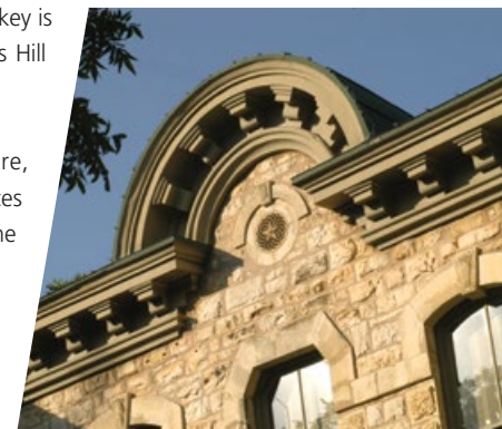
Pioneer Memorial Library