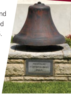
Zion Lutheran Church

In addition to agriculture, tourism and medical services are major components of the local economy.