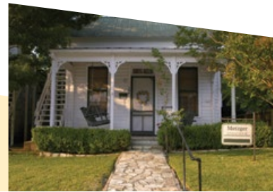
Metzger Sunday house

Small townhouses built by German settlers who lived in distant rural areas. Used over weekends by families while they traded or attended church.