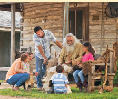
Fort Martin Scott