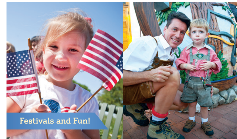
Festivals and Fun!