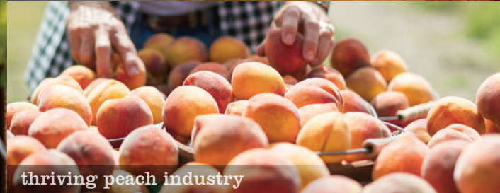
thriving peach industry