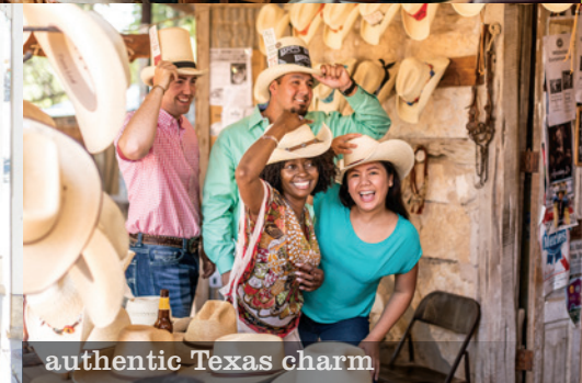
authentic Texas charm