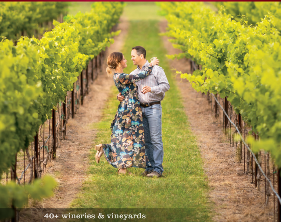
40+ wineries & vineyards

302 E. Austin St., Fredericksburg, TX 78624