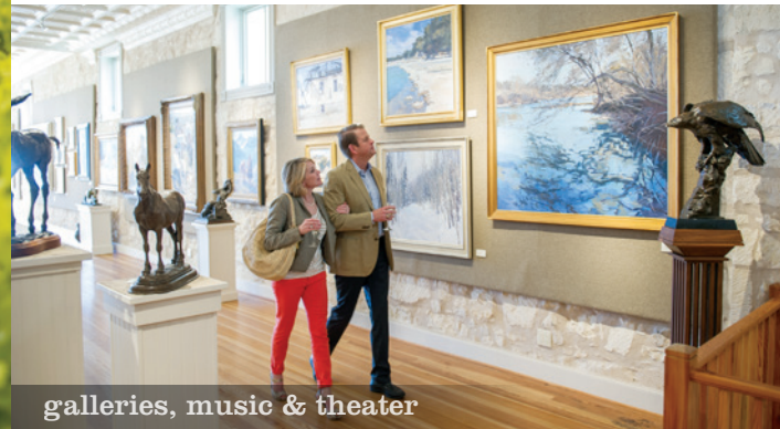
galleries, music & theater