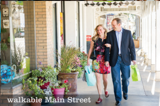
walkable Main Street