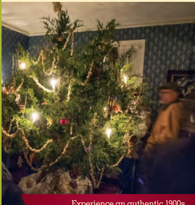
Experience an authentic 1900s farmhouse Christmas, complete with Christmas Tree lighting and treats.