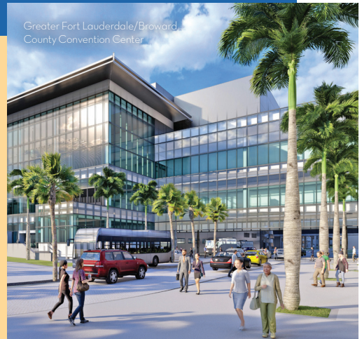
Greater Fort Lauderdale/Broward County Convention Center