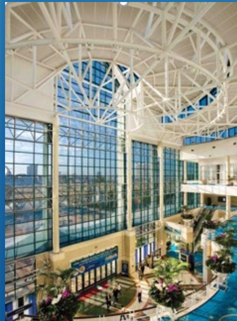
View of the Atrium Lobby