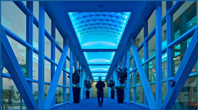
Garage parking with covered skywalks to Convention Center