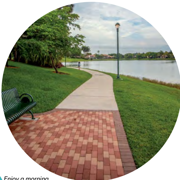
▲ Enjoy a morning walk at Peace Mound Park.

Bonus share: Weston is a wonderfully diverse place to live and raise a family. There is something for everyone. You never have to look for a babysitter here, bring those kids and let them enjoy life with you!