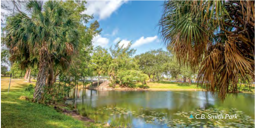
▲ C.B. Smith Park

Well-lit basketball court, playground and 6 soccer fields. 350 S.W. 196 Ave.