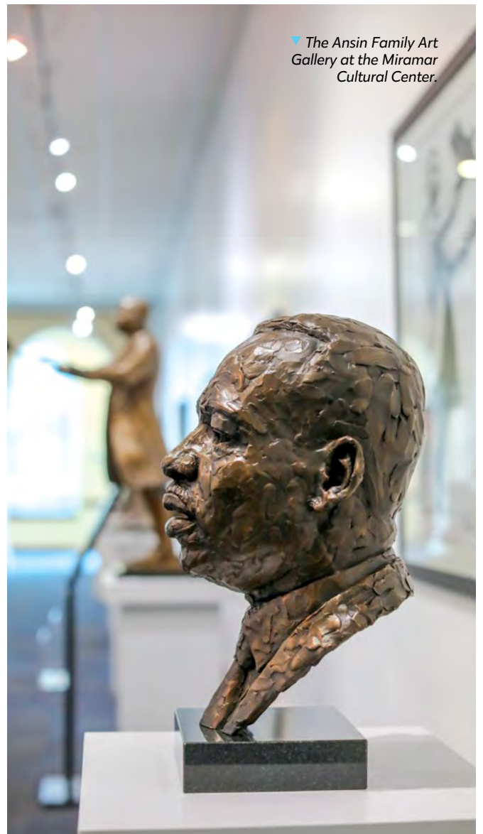
▼ The Ansin Family Art Gallery at the Miramar Cultural Center.

Adjacent to the Charles F. Dodge City Center building, The Frank includes a first floor with spacious galleries displaying contemporary art, from regional to international. The second floor is appointed with another gallery and a sun-warmed classroom.