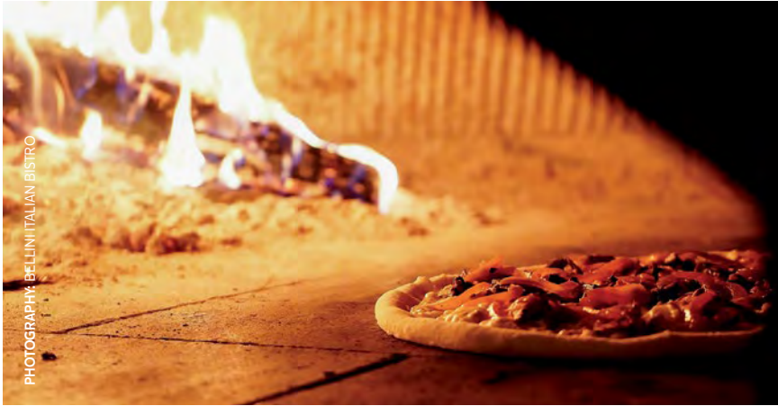
PHOTOGRAPHY: BELLINI ITALIAN BISTRO