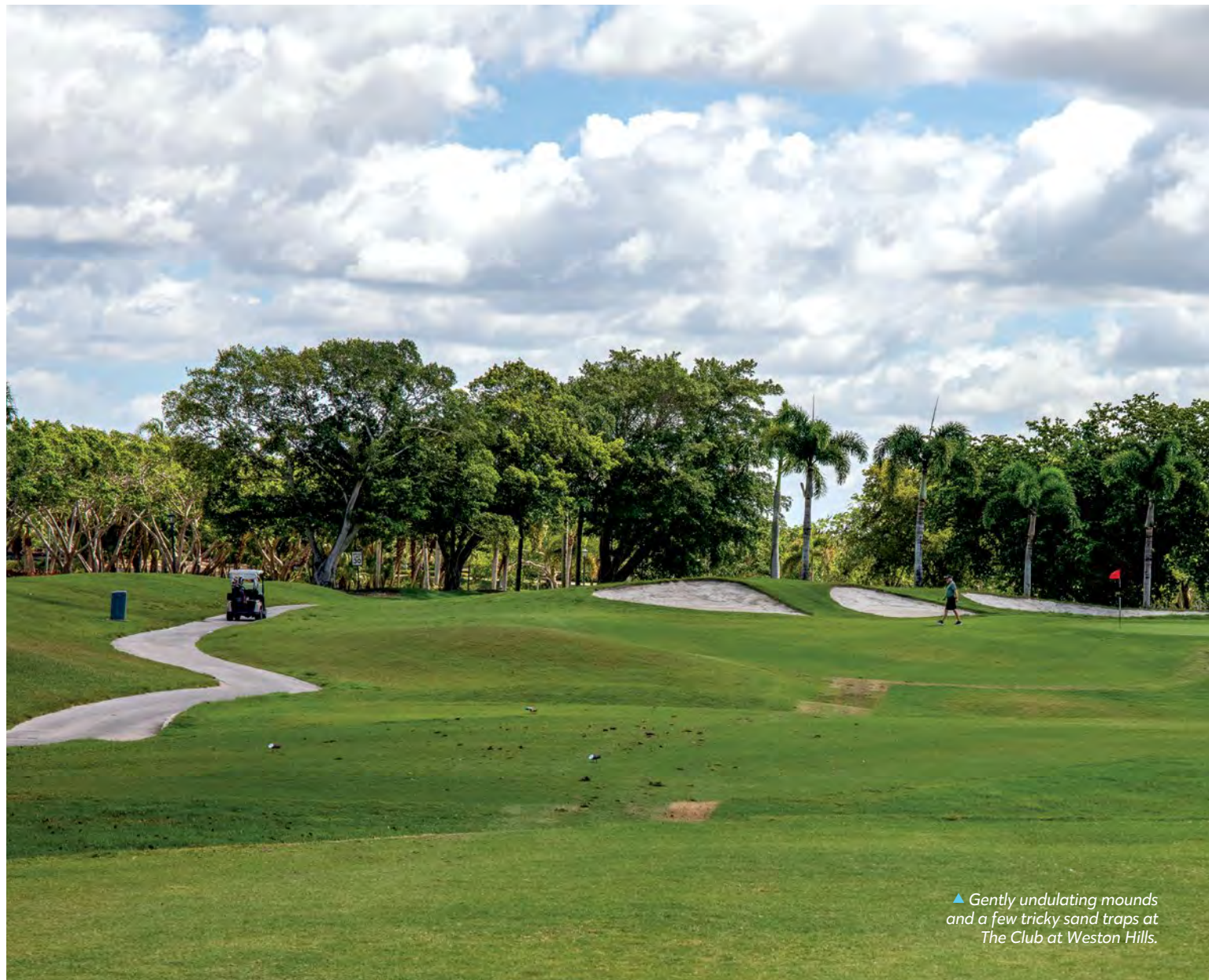
▲ Gently undulating mounds and a few tricky sand traps at The Club at Weston Hills.