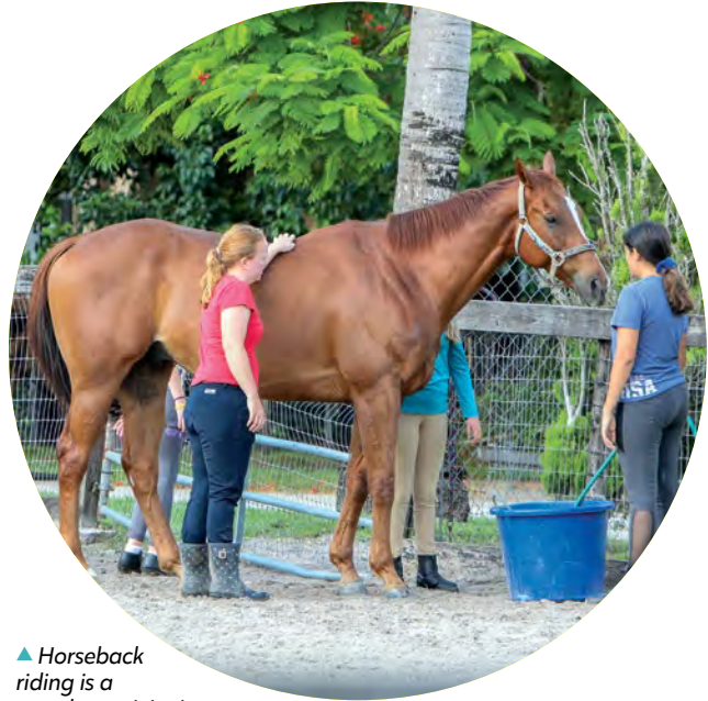
▲ Horseback riding is a popular activity in Southwest Ranches