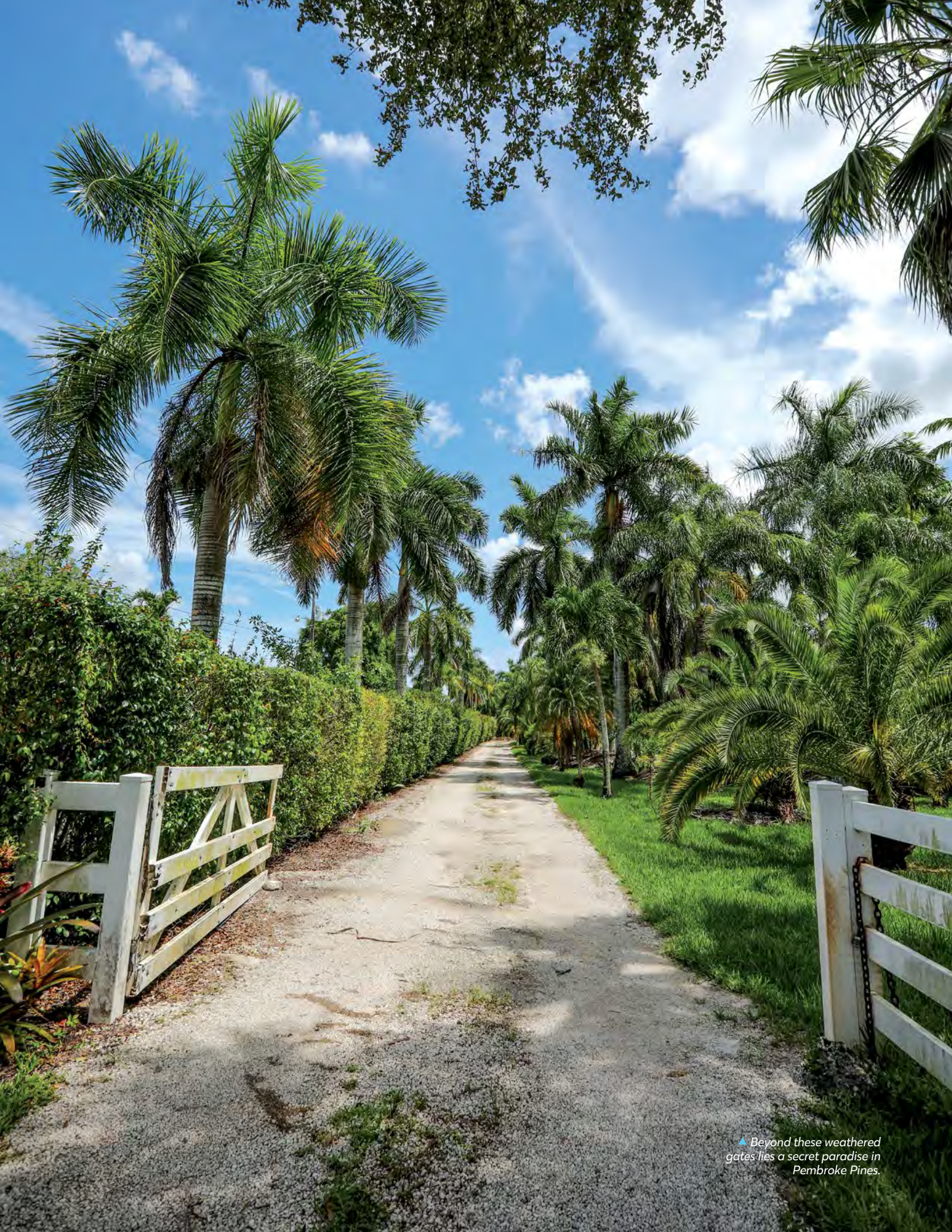
▲ Beyond these weathered gates lies a secret paradise in Pembroke Pines.