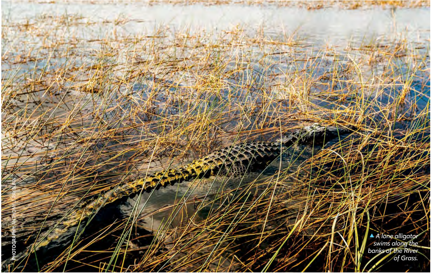
▲ A lone alligator swims along the banks of the River of Grass.