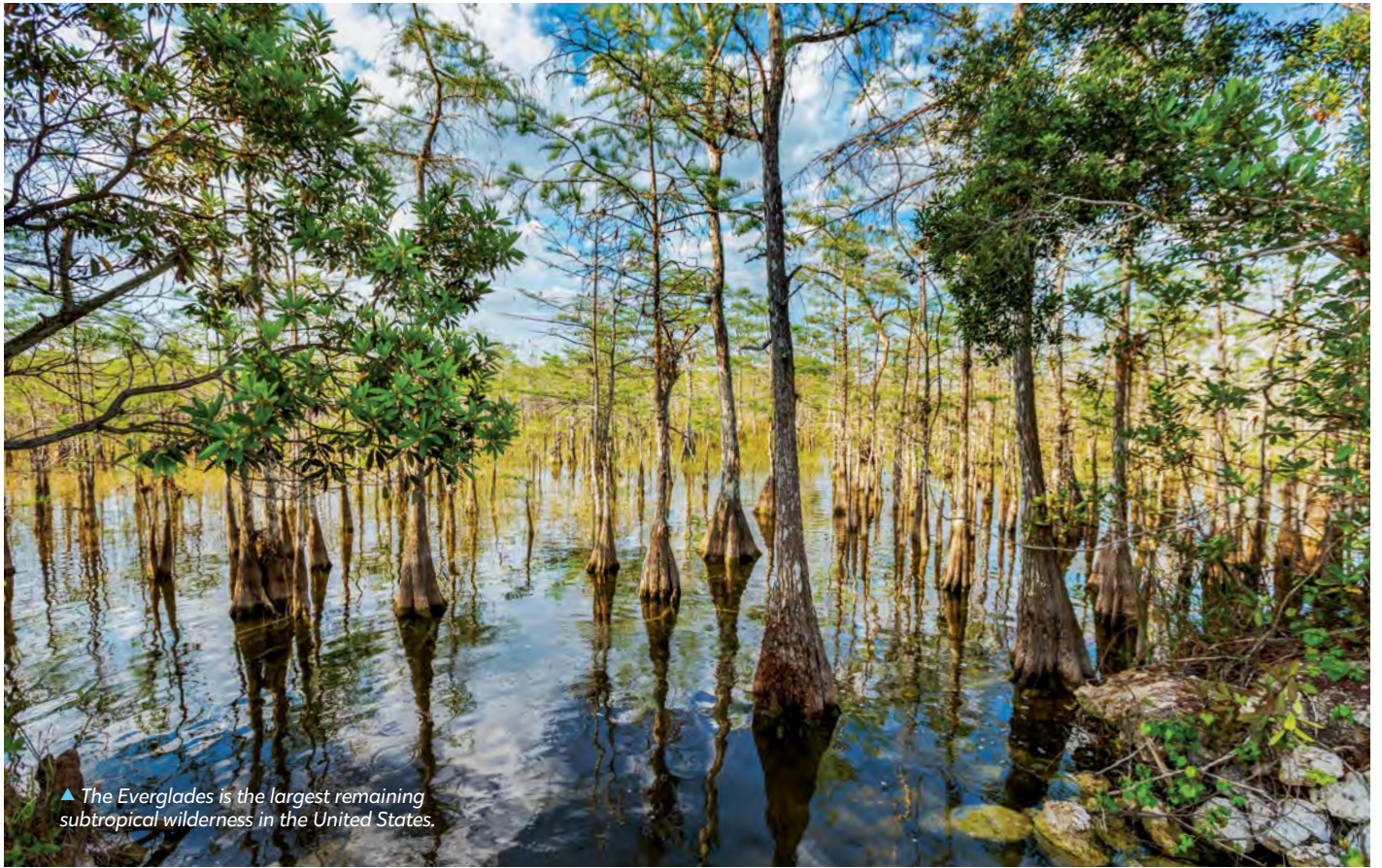
▲ The Everglades is the largest remaining subtropical wilderness in the United States.