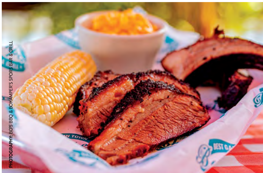
PHOTOGRAPHY: BO'S BBQ & BOKAMPER'S SPORTS BAR & GRILL