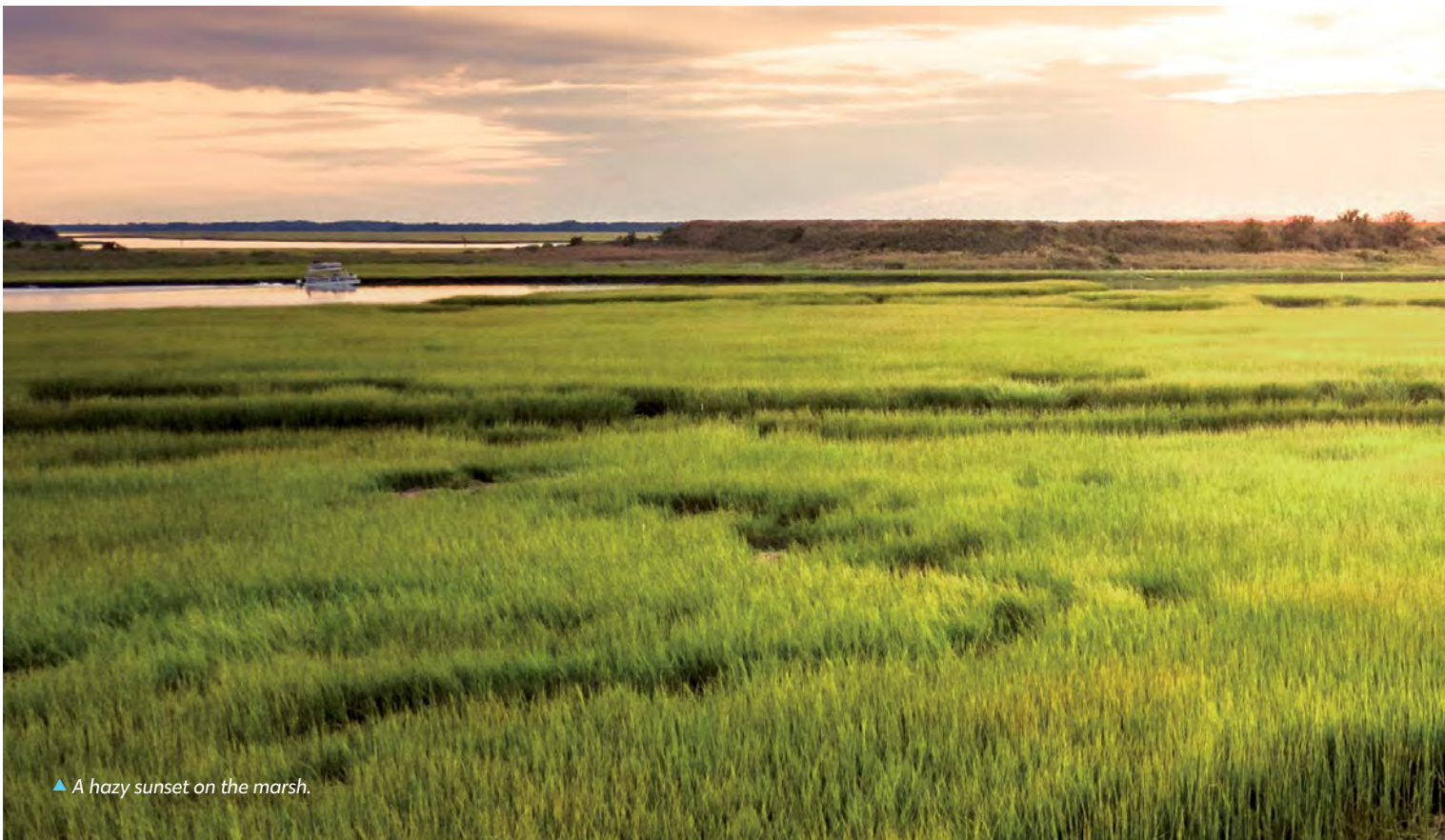
▲ A hazy sunset on the marsh.