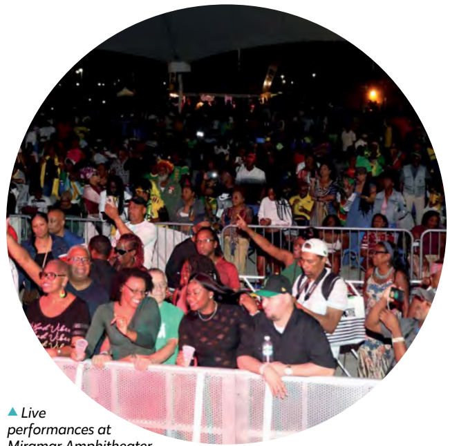
▲ Live performances at Miramar Amphitheater.