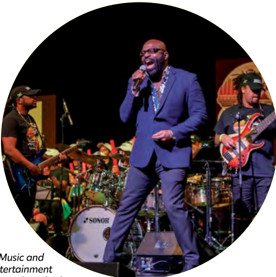
▲ Music and entertainment abound at Charles F. Dodge City Center

Homestyle cooking: You must visit the Mayor's Café for breakfast. There's a family setting where the waitress knows you by name and the mayor is serving you. My other favorite is Cebiche-Bar for Peruvian. It's a small place but the food is large in taste.