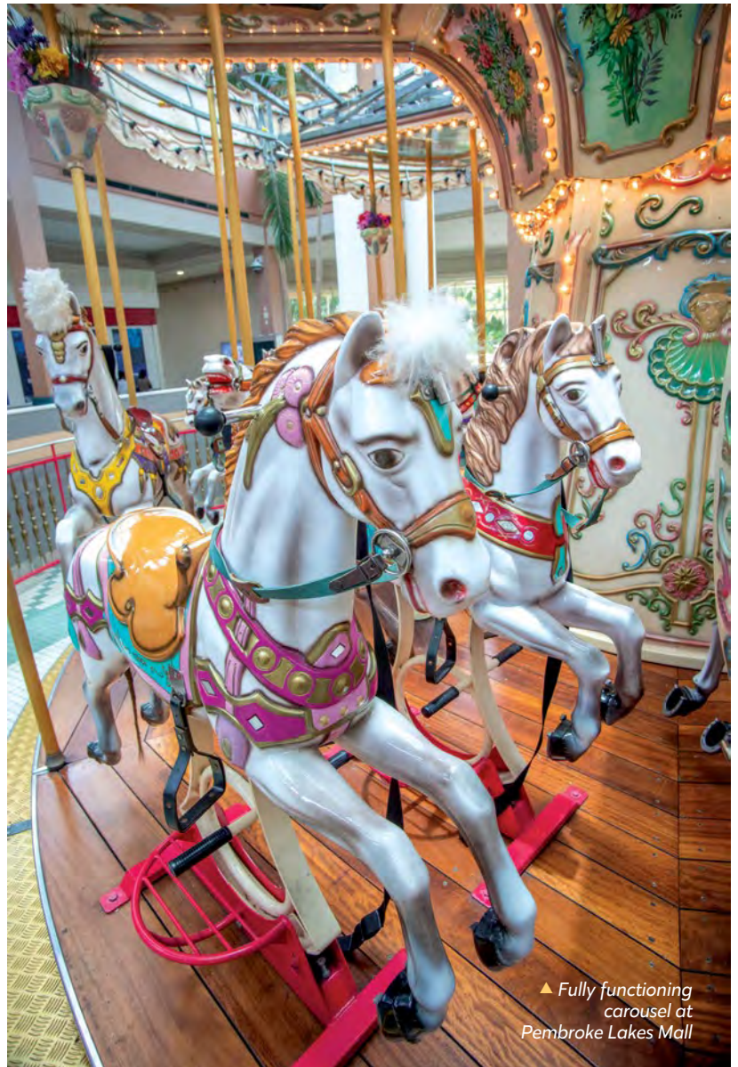
▲ Fully functioning carousel at Pembroke Lakes Mall

▼ Somewhere between the scenic horse trails and farmer's market, life seems to slow down in the town of Southwest Ranches. The unique blend of suburban living with ranch life presents a down-home vibe that belies rich cultural discoveries. On the culinary side, Southwest Ranches has the only American location for the cult favorite Japanese ramen chain, Shimuja, where you must try the new local invention – key lime ramen. The idyllic neighborhood is also home to the beautiful South Florida Hindu Temple and Shiva Vishnu Temple of South Florida.