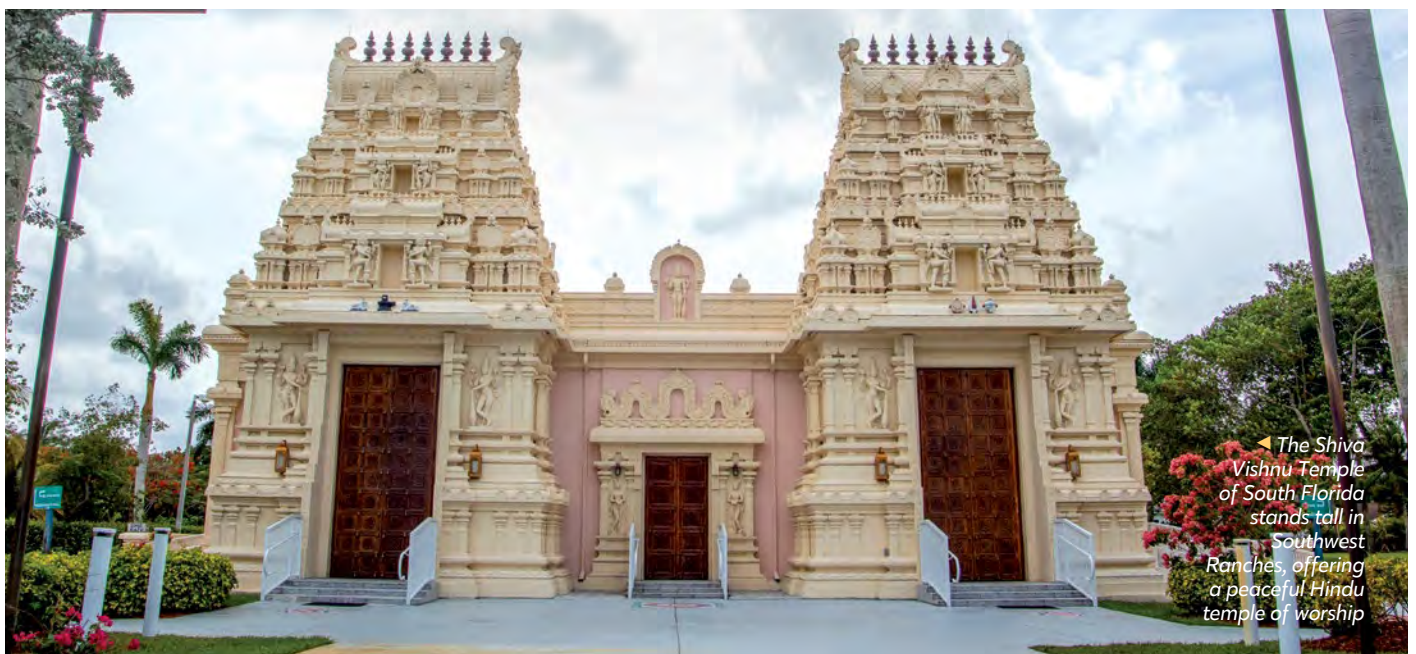
▲ The Shiva Vishnu Temple of South Florida stands tall in Southwest Ranches, offering a peaceful Hindu temple of worship