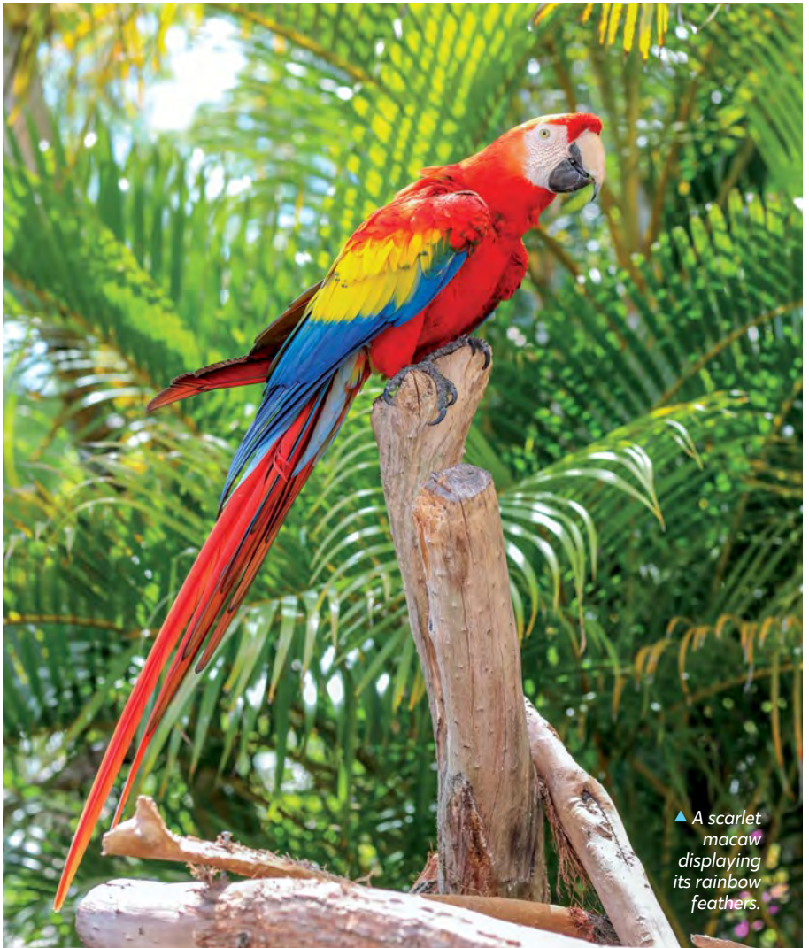
▲ A scarlet macaw displaying its rainbow feathers.