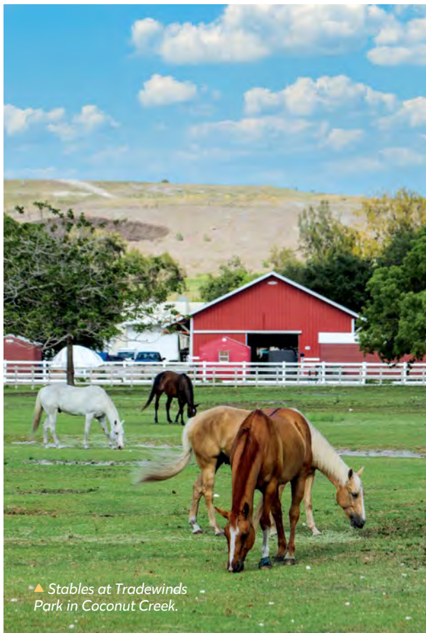
▲ Stables at Tradewinds Park in Coconut Creek.