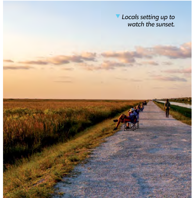
▼ Locals setting up to watch the sunset.

For those looking to simply bask in the beauty of nature, pack a blanket or lawn chair and set up for a front row view of the sunset. The slanting rays and vibrant red and orange hues make for an extraordinarily beautiful snapshot