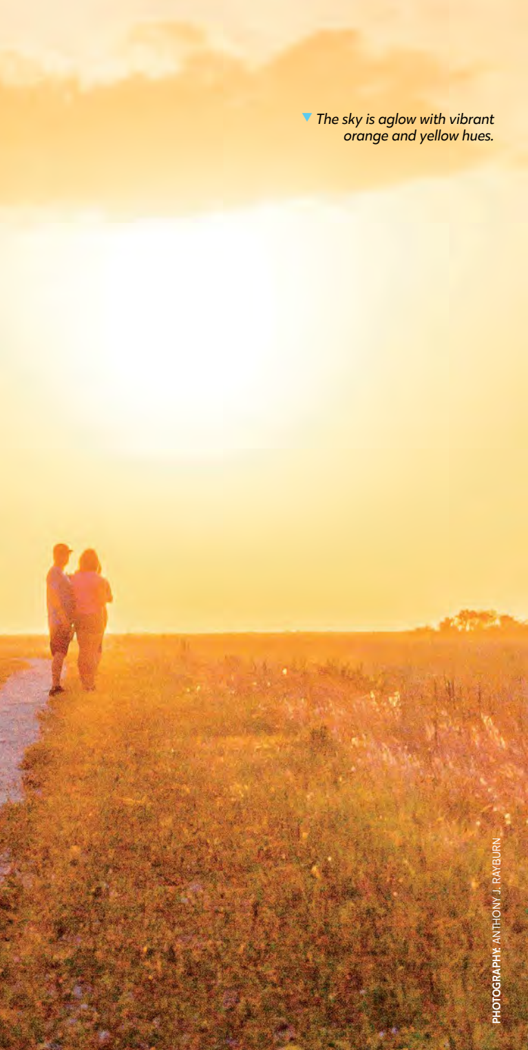
▼ The sky is aglow with vibrant orange and yellow hues.