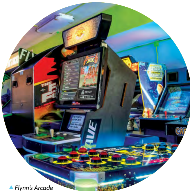
▲ Flynn's Arcade is a gamer's paradise with new and retro games.

Bonus share: Other fun Margate mentions include the Way Back When vintage experience on Margate Boulevard, as well as wall to wall video games for $20 all day at Flynn's Arcade.