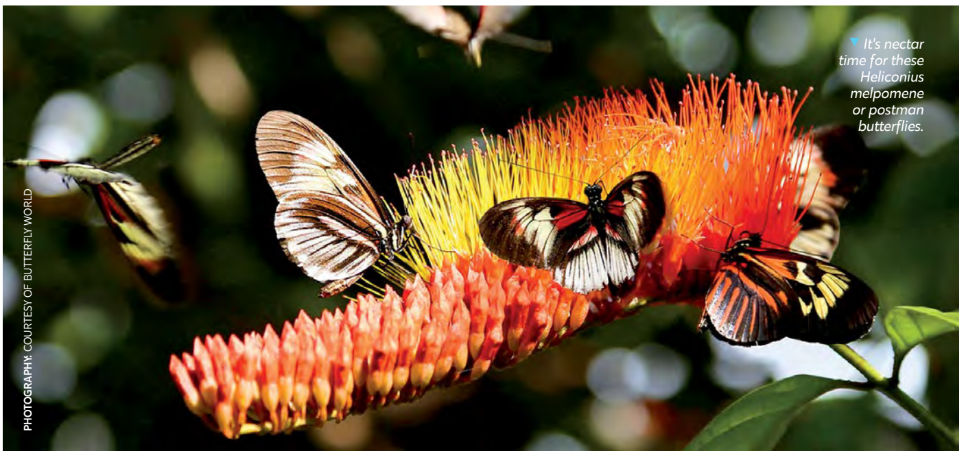
▼ It's nectar time for these Heliconius melpomene or postman butterflies.