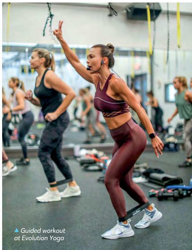
▲ Guided workout at Evolution Yoga

Groceries and bakery. 10635 W. Atlantic Blvd., Coral Springs walmart.com