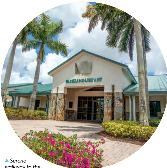
▲ Serene walkway to the Parkland Library.

Tacos locos: I recently discovered Los Bocados. It's a casual Mexican and Latin taco-slinging, all-day joint. The food is absolutely delicious, the staff is friendly and efficient and the space offers both indoor and outdoor dining.