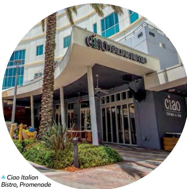
▲ Ciao Italian Bistro, Promenade at Coconut Creek