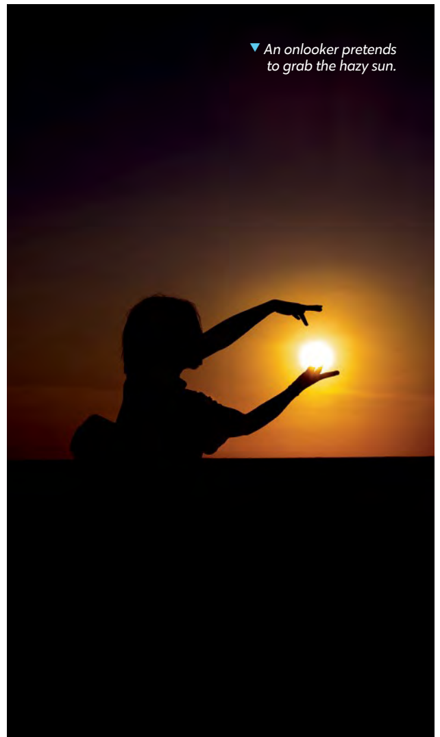
▼ An onlooker pretends to grab the hazy sun.