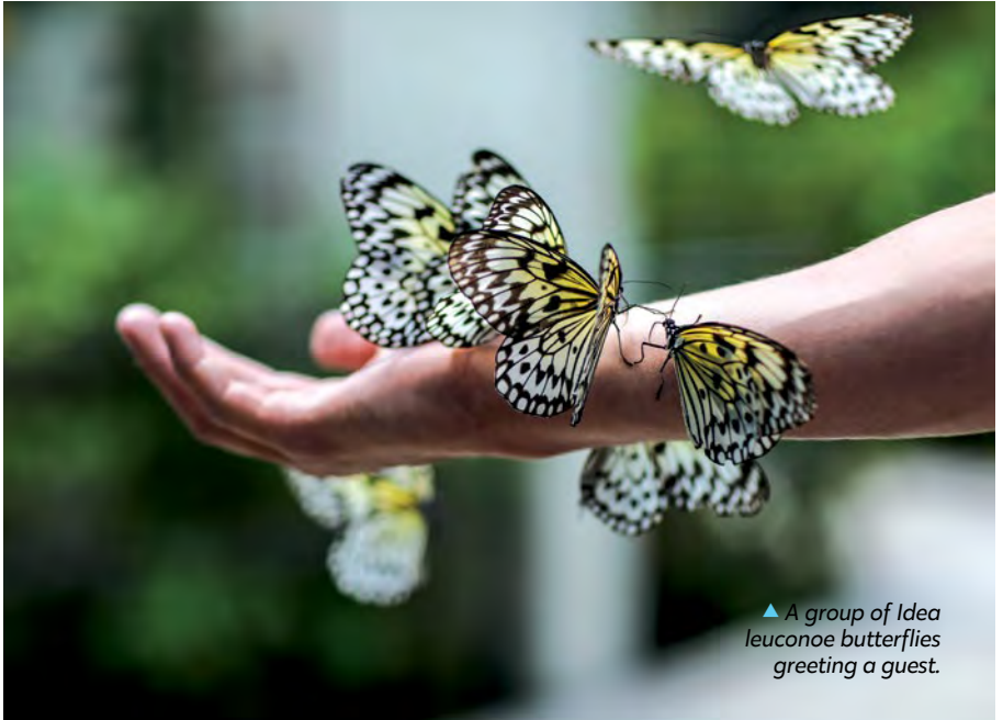
▲ A group of Idea leuconoe butterflies greeting a guest.

➡ Tradewinds Park South, 3600 W. Sample Rd, Coconut Creek butterflyworld.com