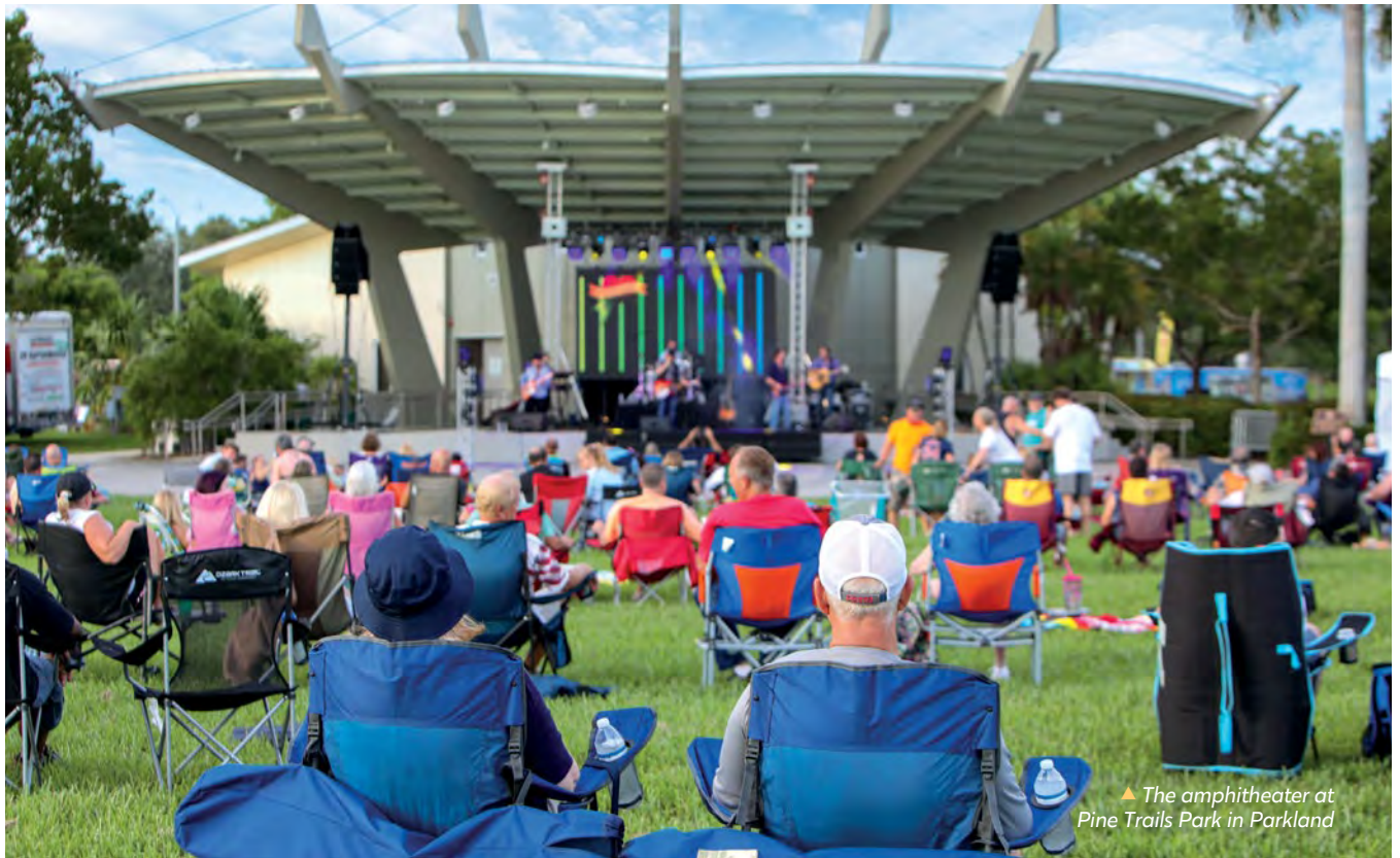
▲ The amphitheater at Pine Trails Park in Parkland