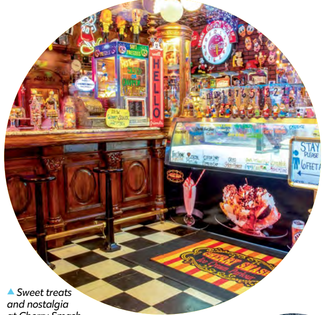
▲ Sweet treats and nostalgia at Cherry Smash.