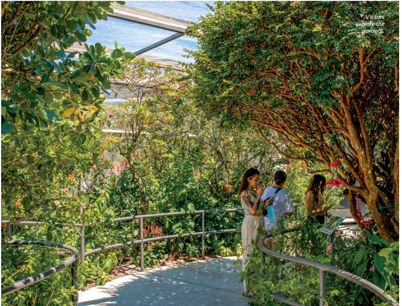
▼ Visitors explore the gardens.