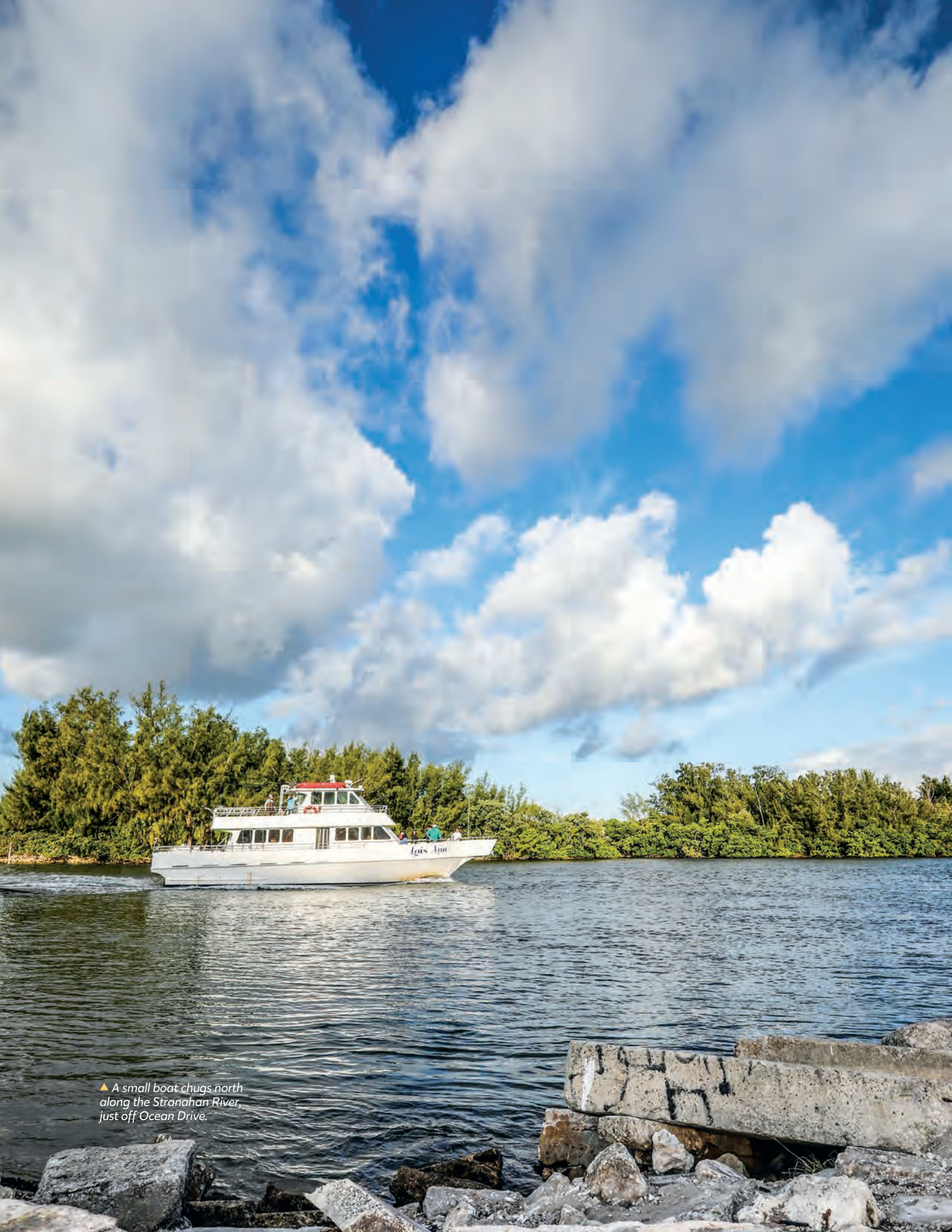
▲ A small boat chugs north along the Stranahan River, just off Ocean Drive.