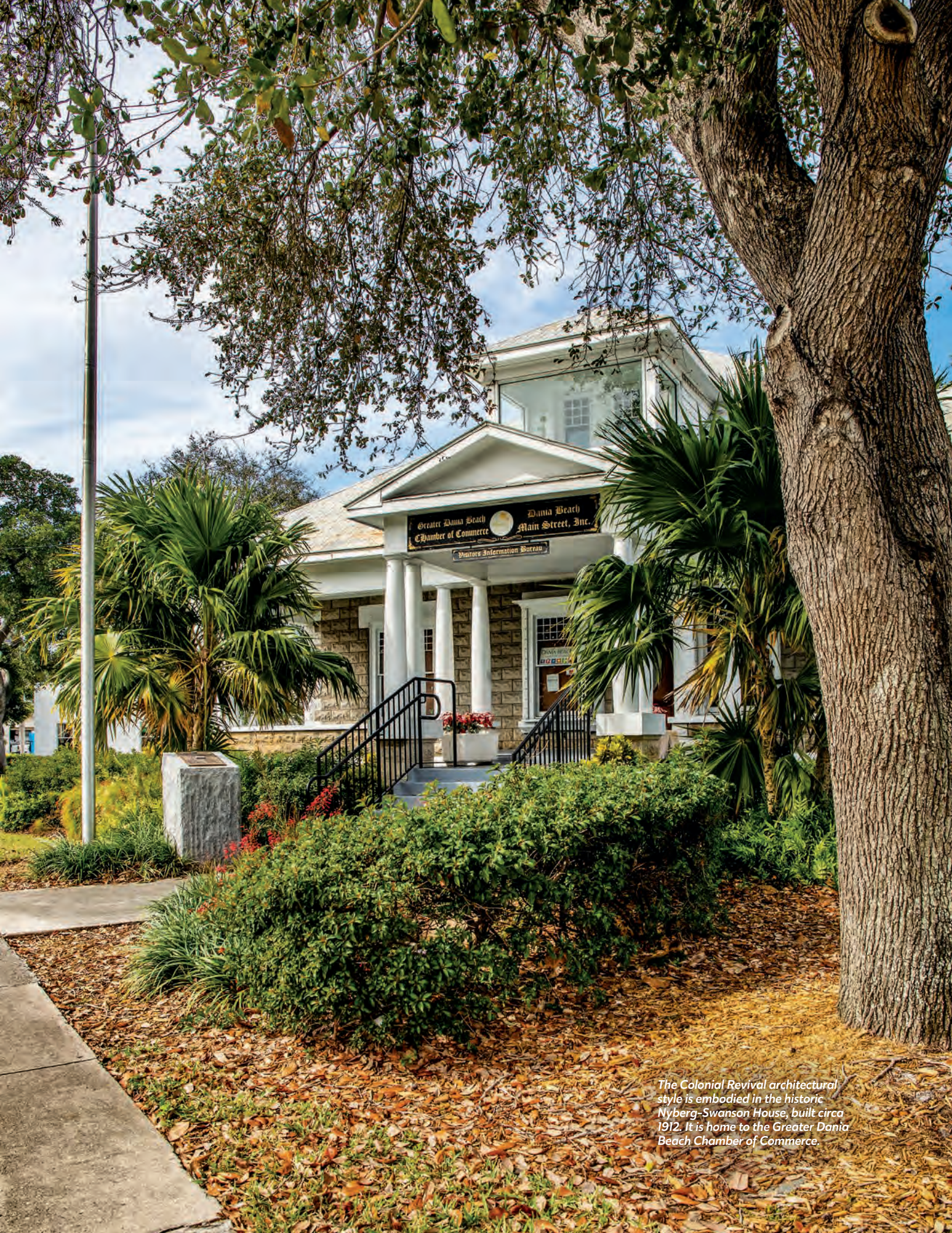
The Colonial Revival architectural style is embodied in the historic Nyberg-Swanson House, built circa 1912. It is home to the Greater Dania Beach Chamber of Commerce.