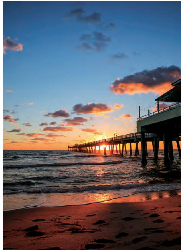
▲ Dania Beach Pier at sunrise.