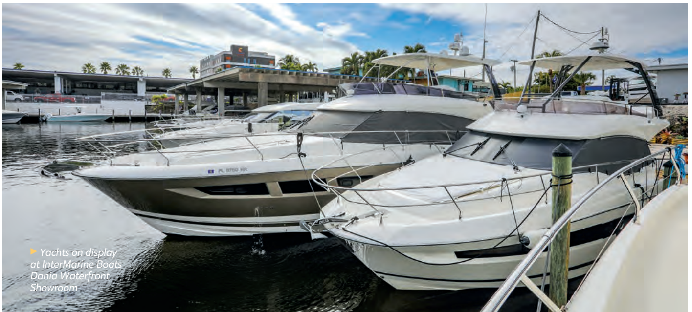
► Yachts on display at InterMarine Boats Dania Waterfront Showroom

Nearby, Dania Beach Marina is conveniently located for locals and visitors alike. The 92-slip municipal facility offers a Captain's Lounge, pump-out station at each slip, and is now home to SeaTech, the Institute for Ocean and Systems Engineering College of Florida Atlantic University.