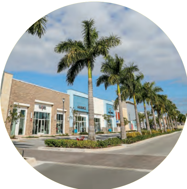
▲ Outdoor shopping at Dania Pointe.

Bonus share: Dania Beach across the tracks is the first incorporated Black community in Broward County. It's a must-do to see what has been preserved.