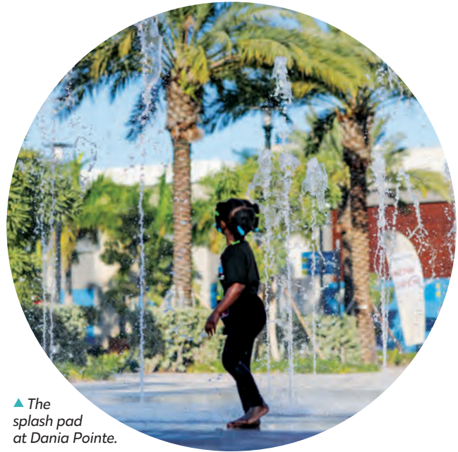
▲ The splash pad at Dania Pointe.

Bonus share: Try local restaurants like Antonio's or Paolo's for Italian, or Joe's Fish Grill for fresh fish and bait hour all day. And the beach, the beach, the beach! With all our faithful local eateries, the beach, and now Dania Pointe, there is no reason to ever leave Dania... for anything.