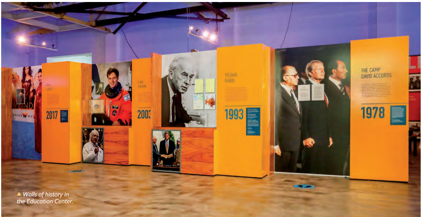
▲ Walls of history in the Education Center.