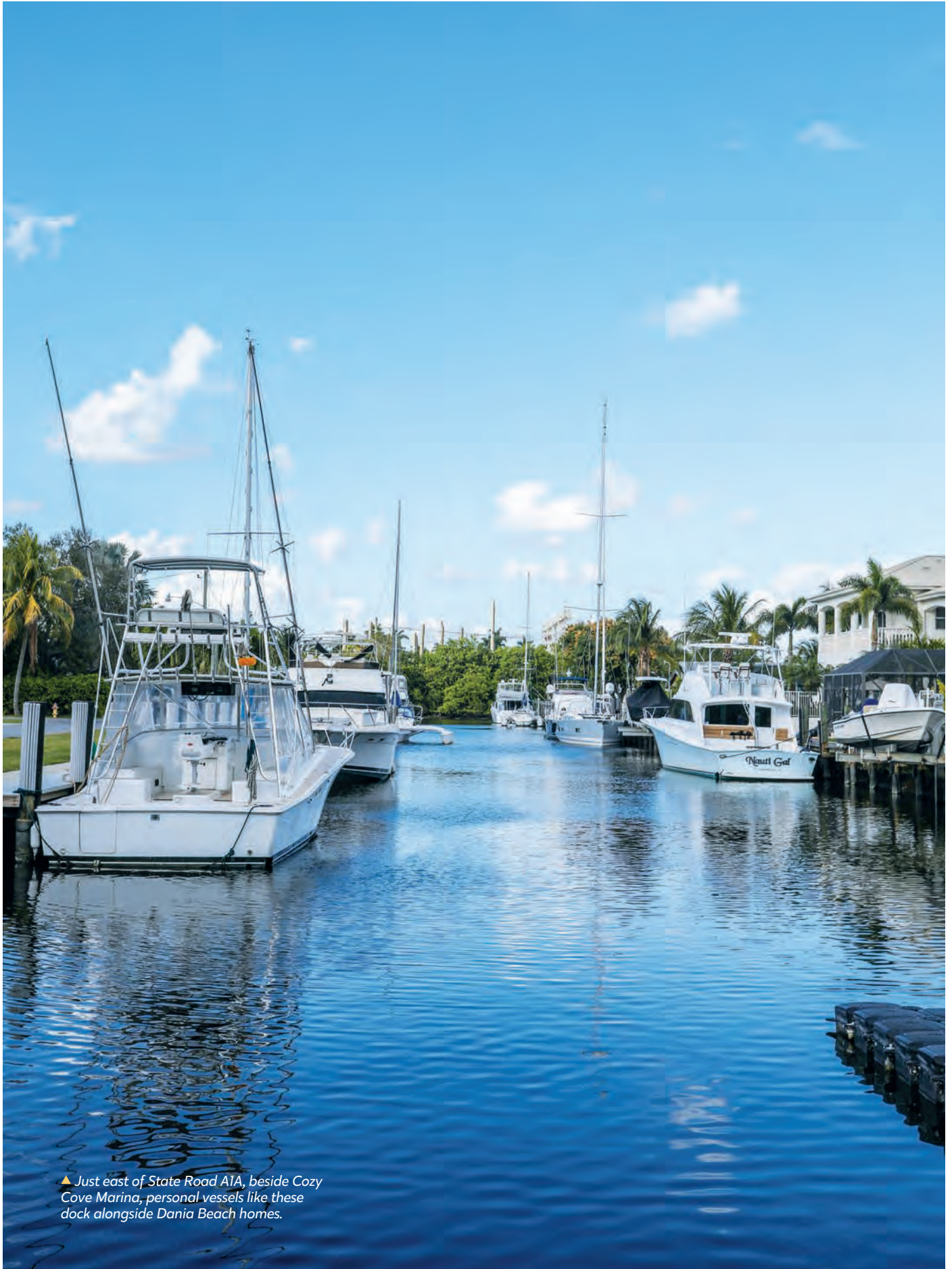
▲ Just east of State Road A1A, beside Cozy Cove Marina, personal vessels like these dock alongside Dania Beach homes.