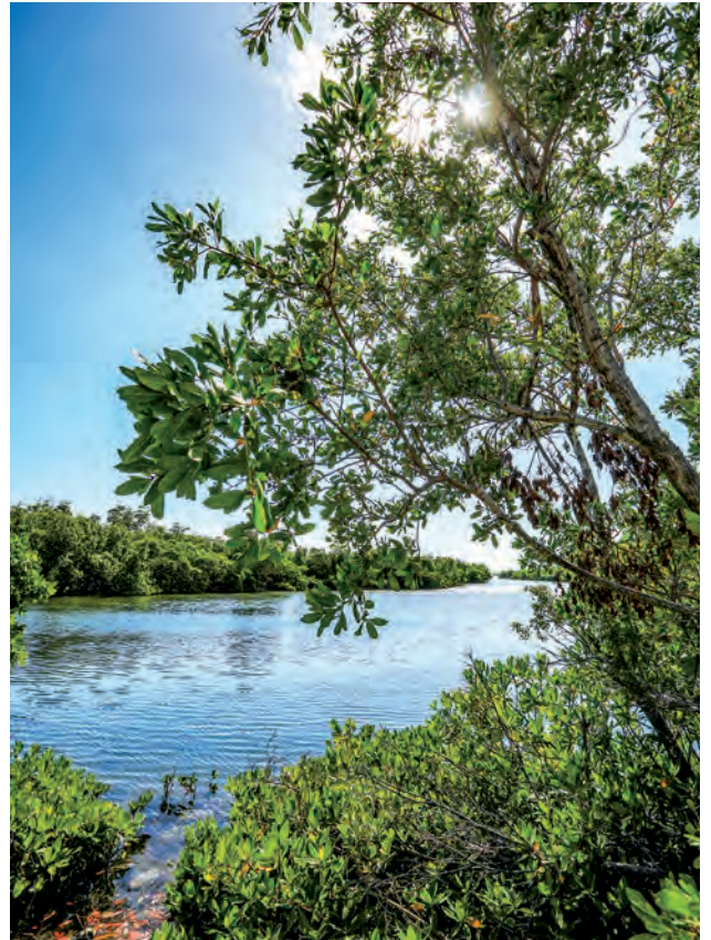
▲ View of West Lake from Dania Beach Blvd.

Then there's West Lake, where you'll share the gleaming waters with gentle manatees and pensive great blue herons in an environmentalist's oasis that provides some of South Florida's best bird watching under gorgeous cerulean skies. The meandering waterways of Dania Beach are ideal routes to your restored mind, body and soul.