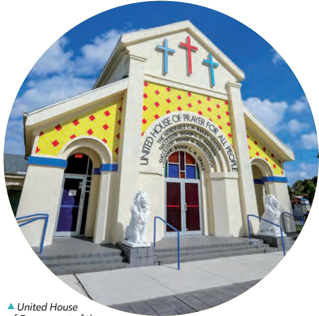
▲ United House of Prayer west of the train tracks in Dania Beach.

For casual or formal dining: Tropical Acres is an original Dania Beach family-owned establishment that captures the essence of old Florida with incredible service and a high-quality menu. My favorite meal there is an exquisitely prepared filet mignon with a glass of Cabernet.