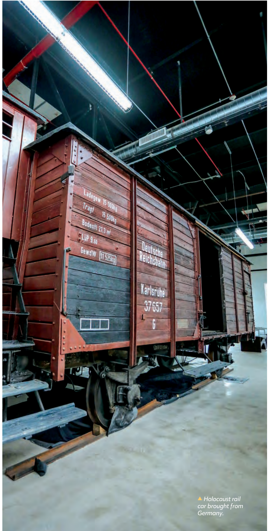
▲ Holocaust rail car brought from Germany.