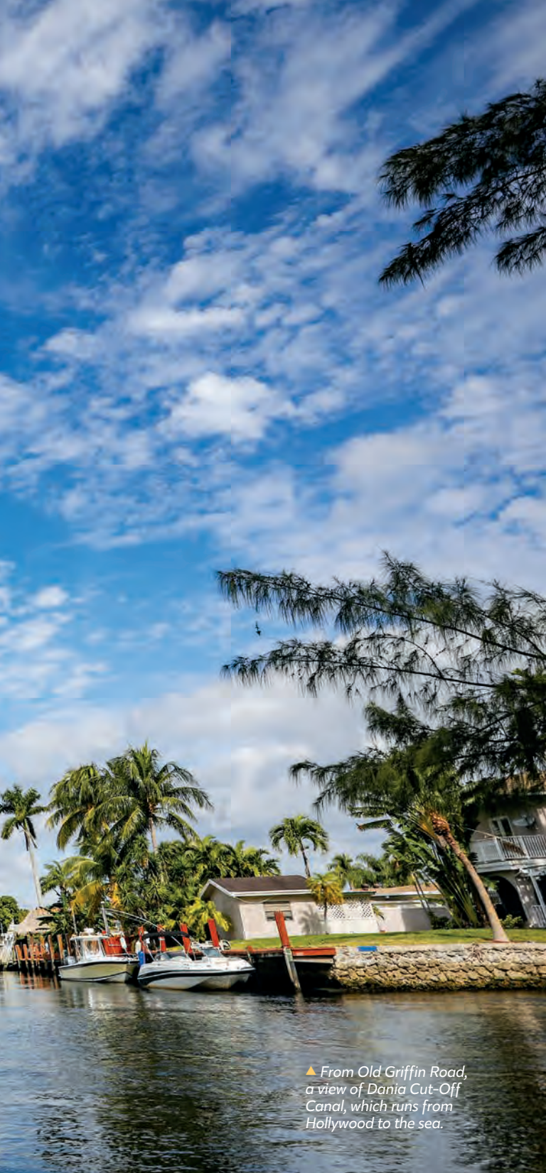
▲ From Old Griffin Road, a view of Dania Cut-Off Canal, which runs from Hollywood to the sea.

Then there's West Lake, where you'll share the gleaming waters with gentle manatees and pensive great blue herons in an environmentalist's oasis that provides some of South Florida's best bird watching under gorgeous cerulean skies. The meandering waterways of Dania Beach are ideal routes to your restored mind, body and soul.