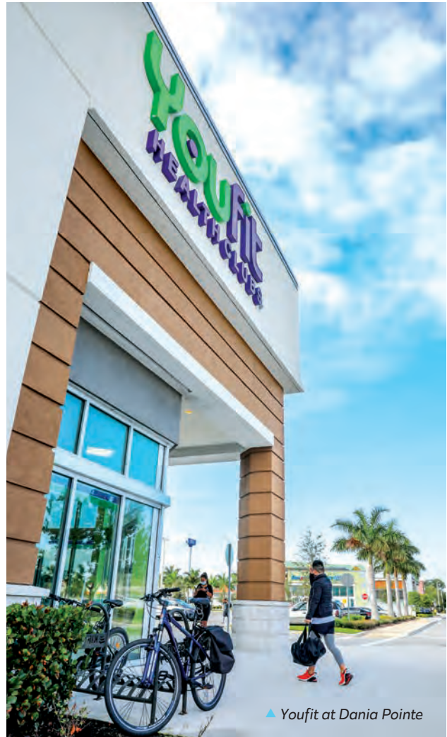
▲ Youfit at Dania Pointe

Publix Super Market at Oakbridge 3102 Griffin Road publix.com