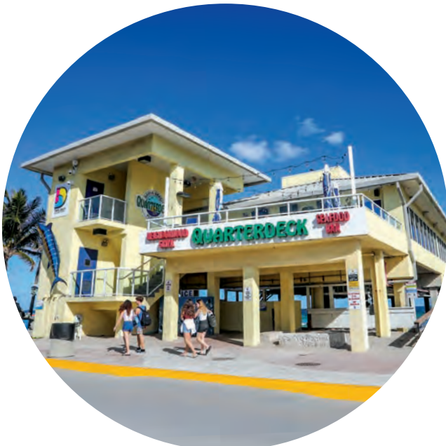
▲ The Quarterdeck building is the anchor connecting the iconic Dania Beach Pier to the sandy shoreline.

Bonus share: Coming in the near future, we have an approved "1,000 Mermaids" project that will place artificial reefs along the shore and facilitate underwater selfies.