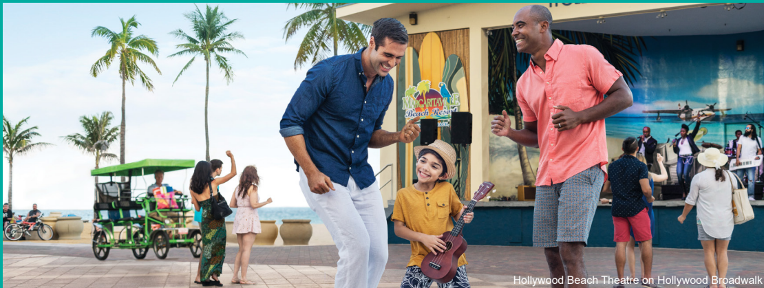
Hollywood Beach Theatre on Hollywood Broadway

Day or night, there's always something sunny going on. From concerts at BB&T Center and Hard Rock Event Center to arts and cultural festivals year-round, plus sporting events, watersports, nightlife and underground scene. Your Greater Fort Lauderdale experience can be as busy as you wish! Save time (and room in your suitcase) for a great find at a local boutique, upscale department store or designer outlet.