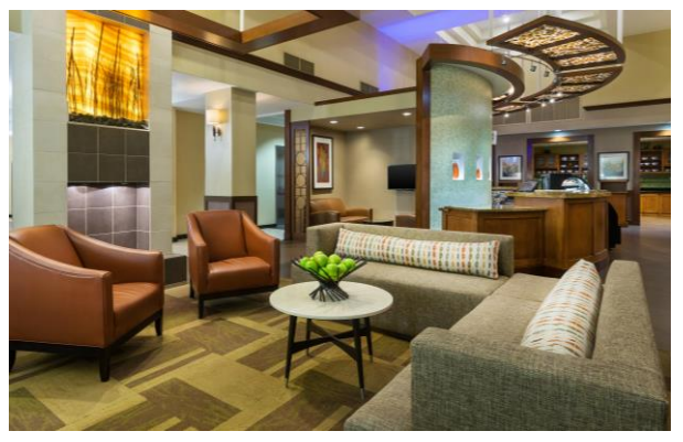
King guestrooms feature 470 square feet with spacious closet, work space, and separate bathtub and showers,