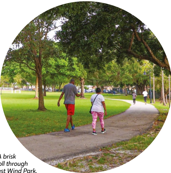
▲ A brisk stroll through West Wind Park.

Bonus share: Lauderhill is a melting pot of diverse cultures, making it a fascinating place to explore. From its vibrant Caribbean community to its thriving international population, the city embraces its multicultural heritage. Lauderhill offers an impressive selection of 25 parks throughout the city. If you have a love for the arts, the Lauderhill Performing Arts Center is a must-visit.