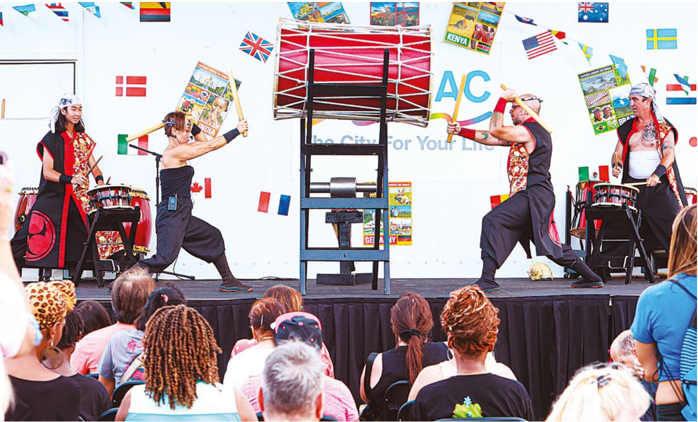
▲ Performers at One Tamarac Multicultural Festival at Tamarac Sports Complex. ▶ Attendees at Unifest, Vincent Torres Memorial Park in Lauderdale Lakes.

Planned by renowned architect Morris Lapidus, North Lauderdale is known by residents as "The City of Tomorrow." Its spirit of community shines through with events like the North Lauderdale Days and holiday parades around Hampton Park. Exciting annual events like the Halloween haunted forest trail and fireworks spectacular ignite children's imaginations, adding to the atmosphere.