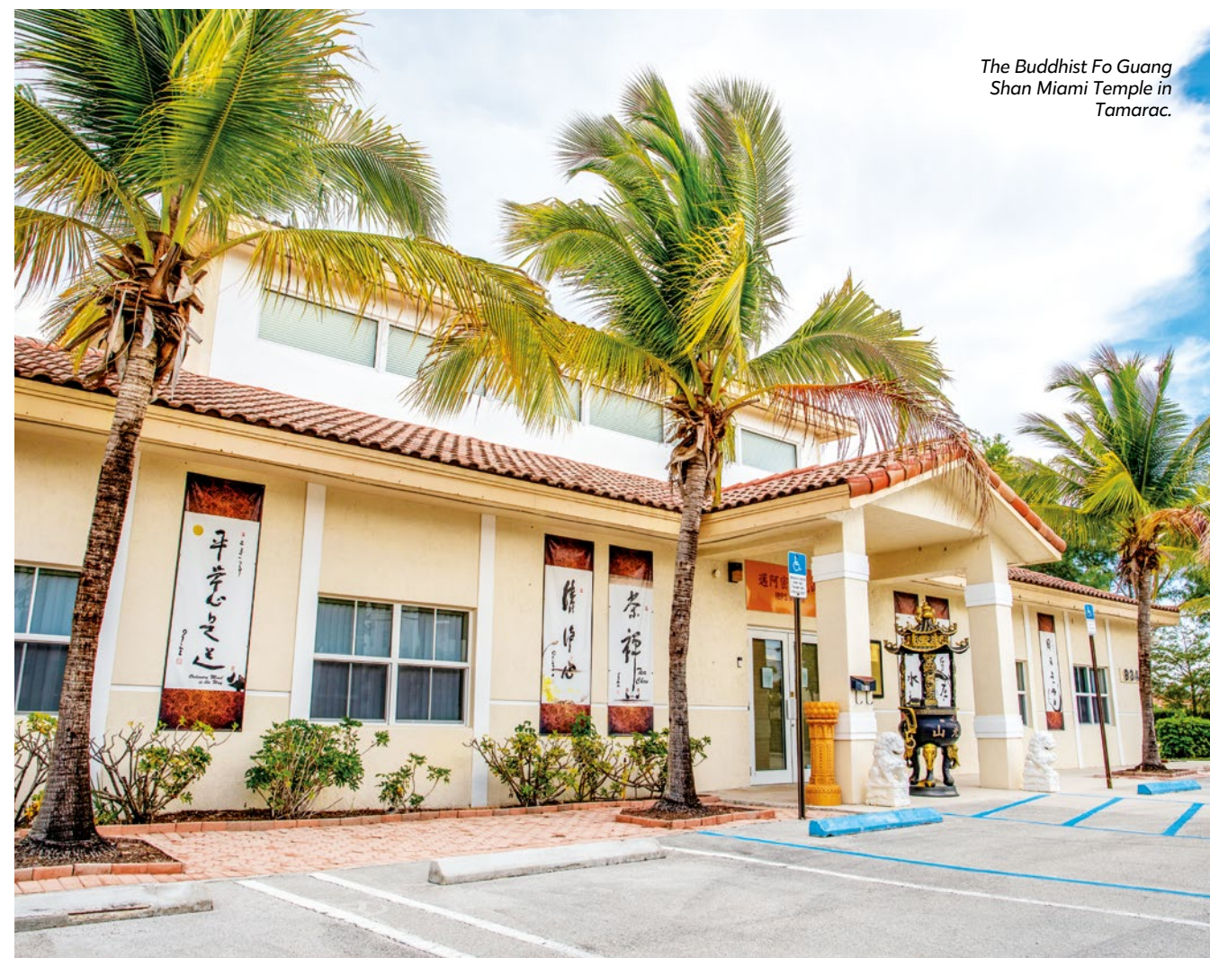
The Buddhist Fo Guang Shan Miami Temple in Tamarac.

Saturday morning, a day before the main carnival road march begins in Miami, Lauderdale plays host to J'ouvert, where revelers dance to soca and calypso from dawn to day caked in mud, clay, paint and oil, sometimes wearing devil's horns, a tradition that symbolizes liberation.