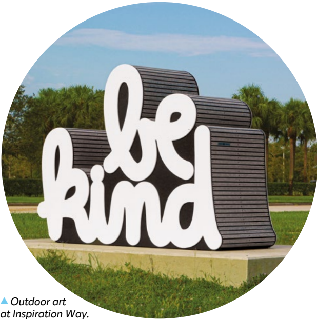
▲ Outdoor art at Inspiration Way.