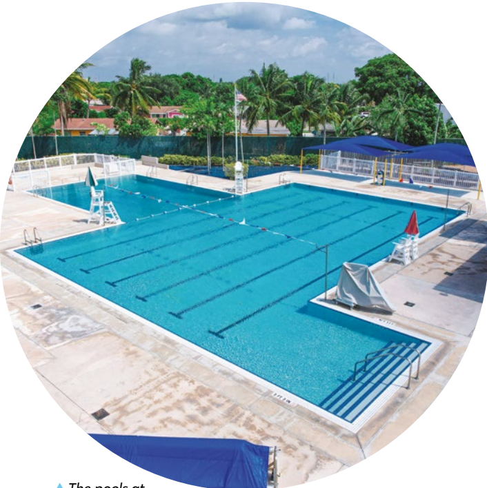
▲ The pools at Jerry Resnick Aquatic Center.

Bonus share: Jerry Resnick Aquatic Center is located right beside the City Hall with only a $2 admission fee, and it has an olympic-size pool and splash pad area for babies.