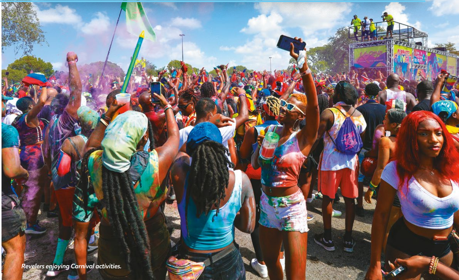
Revelers enjoying Carnival activities.