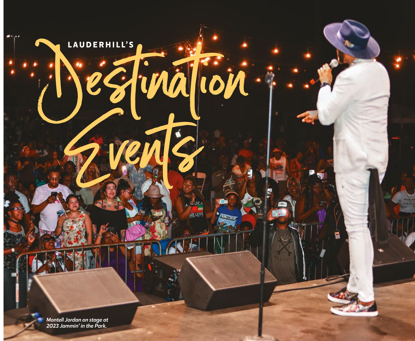
Montell Jordan on stage at 2023 Jammin' in the Park.

In vibrant Lauderhill, the yearly calendar of community-centric events, both large and small, offers a variety of to-dos for any local or visitor. Whether you love jazz, rap or consider yourself a foodie, Lauderhill's roster has something to excite.