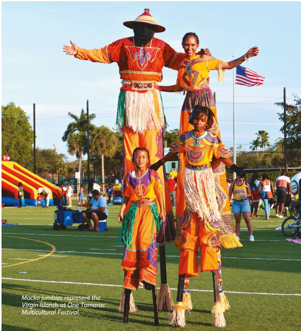
Mocko jumbies represent the Virgin Islands at One Tamarac Multicultural Festival.