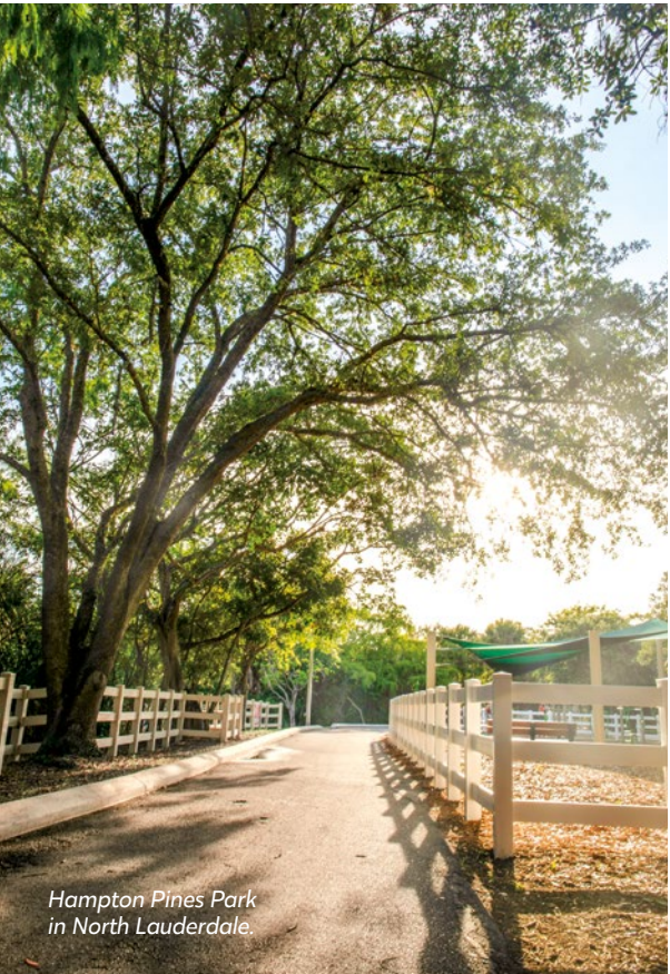
Hampton Pines Park in North Lauderdale.