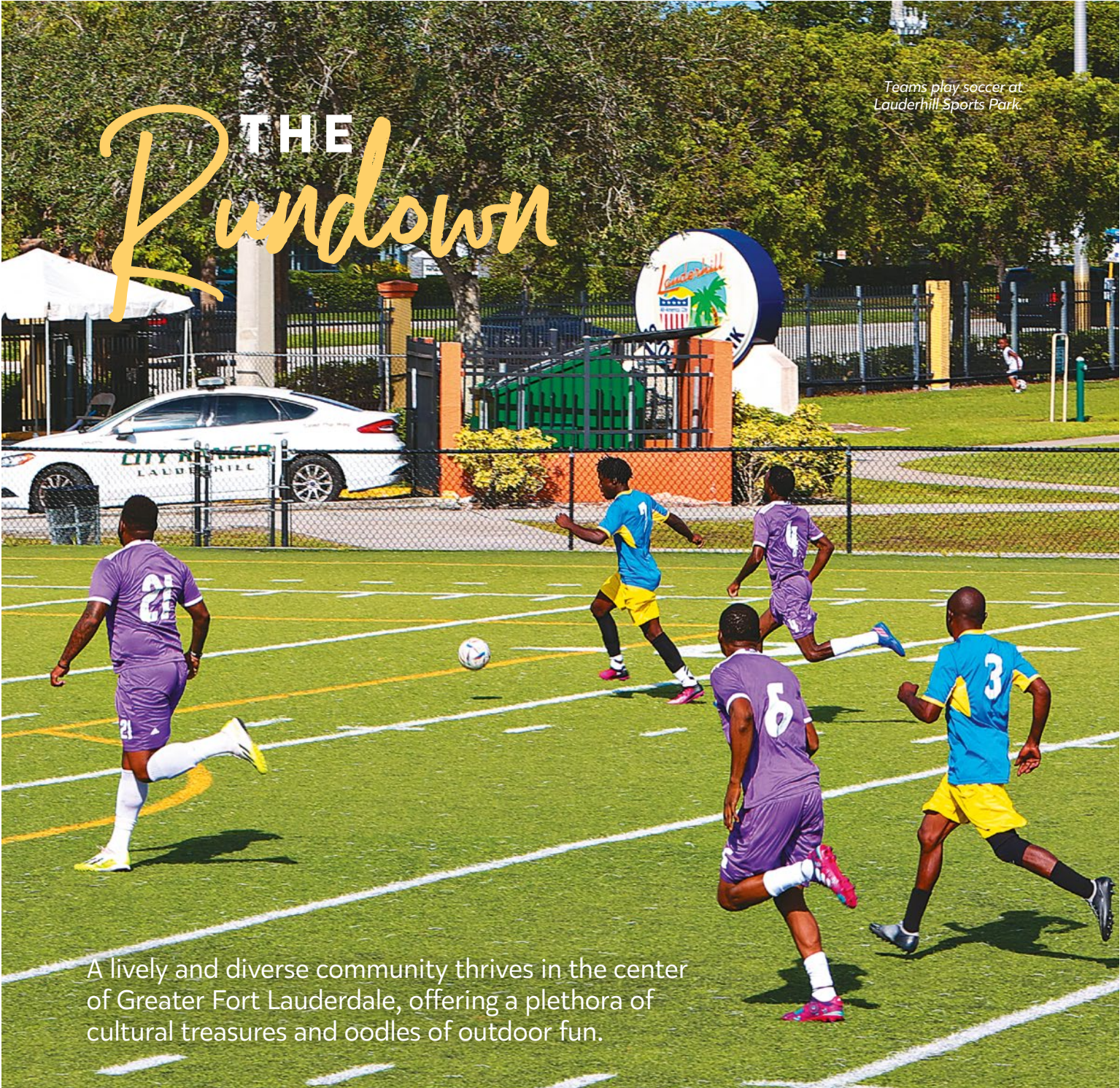
A lively and diverse community thrives in the center of Greater Fort Lauderdale, offering a plethora of cultural treasures and oodles of outdoor fun.

Once a dairy farm country, Lauderhill has flourished into a vibrant and multicultural community that welcomes both retirees and young families. The landmark residential development of Inverrary, once home to comedian Jackie Gleason, beckons residents with its iconic Inverrary Waterfall, a favorite spot for wedding photos. Regularly supported outdoor events keep social calendars full, while sports enthusiasts can cheer on their favorite teams at the Lauderhill Sports Park, home to the Lauderhill Lions Men's Soccer Club.