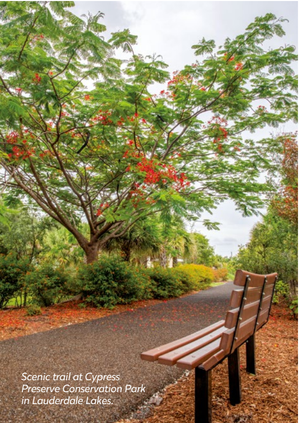
Scenic trail at Cypress Preserve Conservation Park in Lauderdale Lakes.

Preserve Conservation Park as the wind rustles through the trees. Find yourself in the midst of 6.4 acres of tall cypress and laurel oak as you meander along the scenic half-mile walking trail. Or go for a hike to clear your mind at Hampton Pines Park and take in the natural beauty. Casual anglers can cast their hooks in the quiet lake, while outdoor enthusiasts jump on a paddle board and mosey along the shoreline.