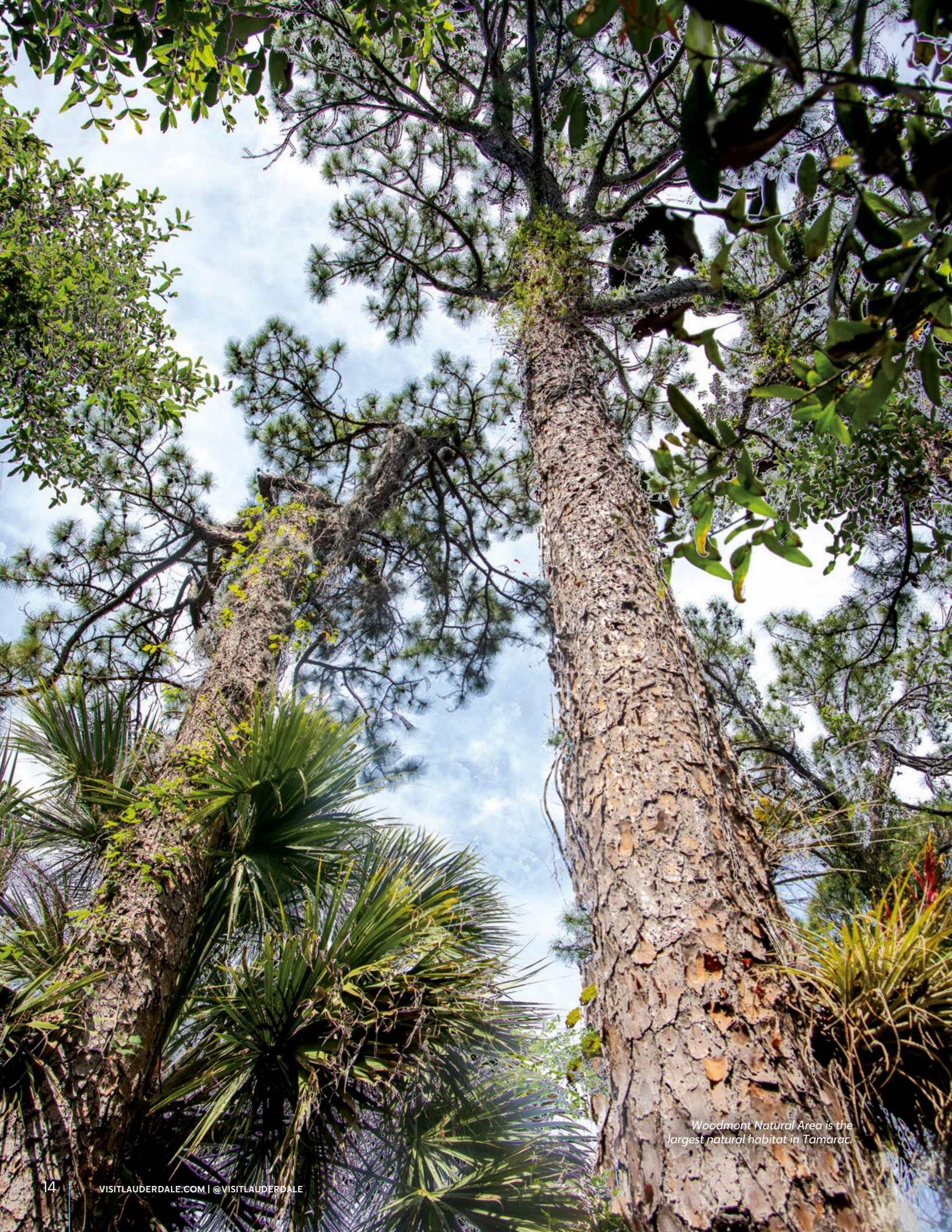
Woodmont Natural Area is the largest natural habitat in Tamarac.