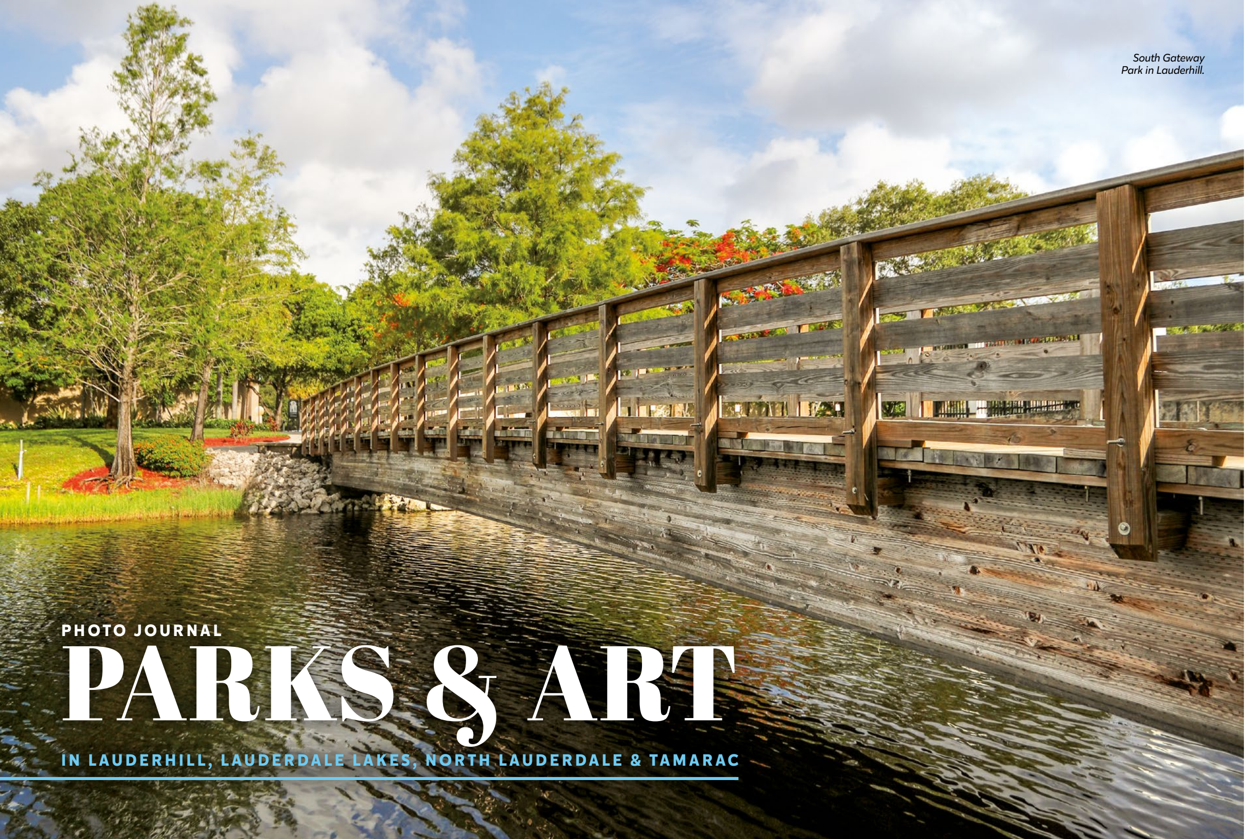
South Gateway Park in Lauderhill.