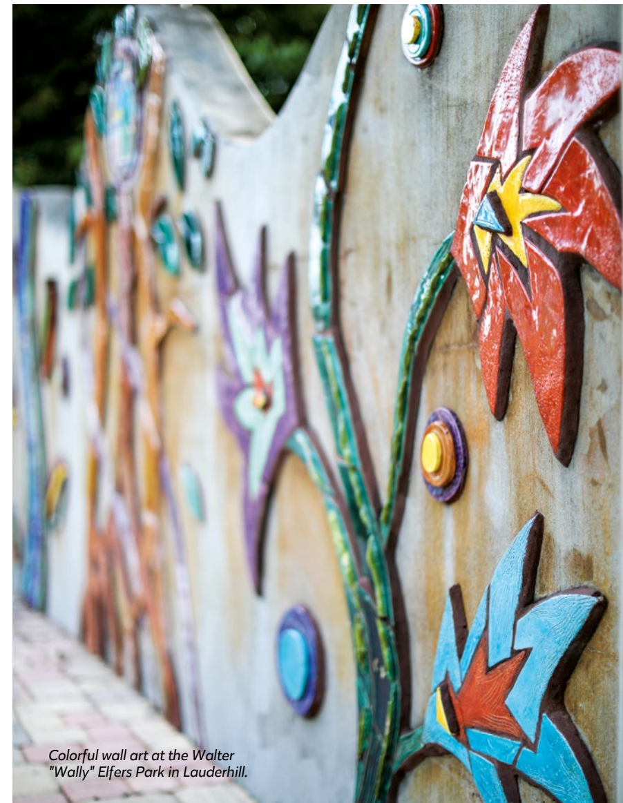
Colorful wall art at the Walter "Wally" Elfers Park in Lauderhill.