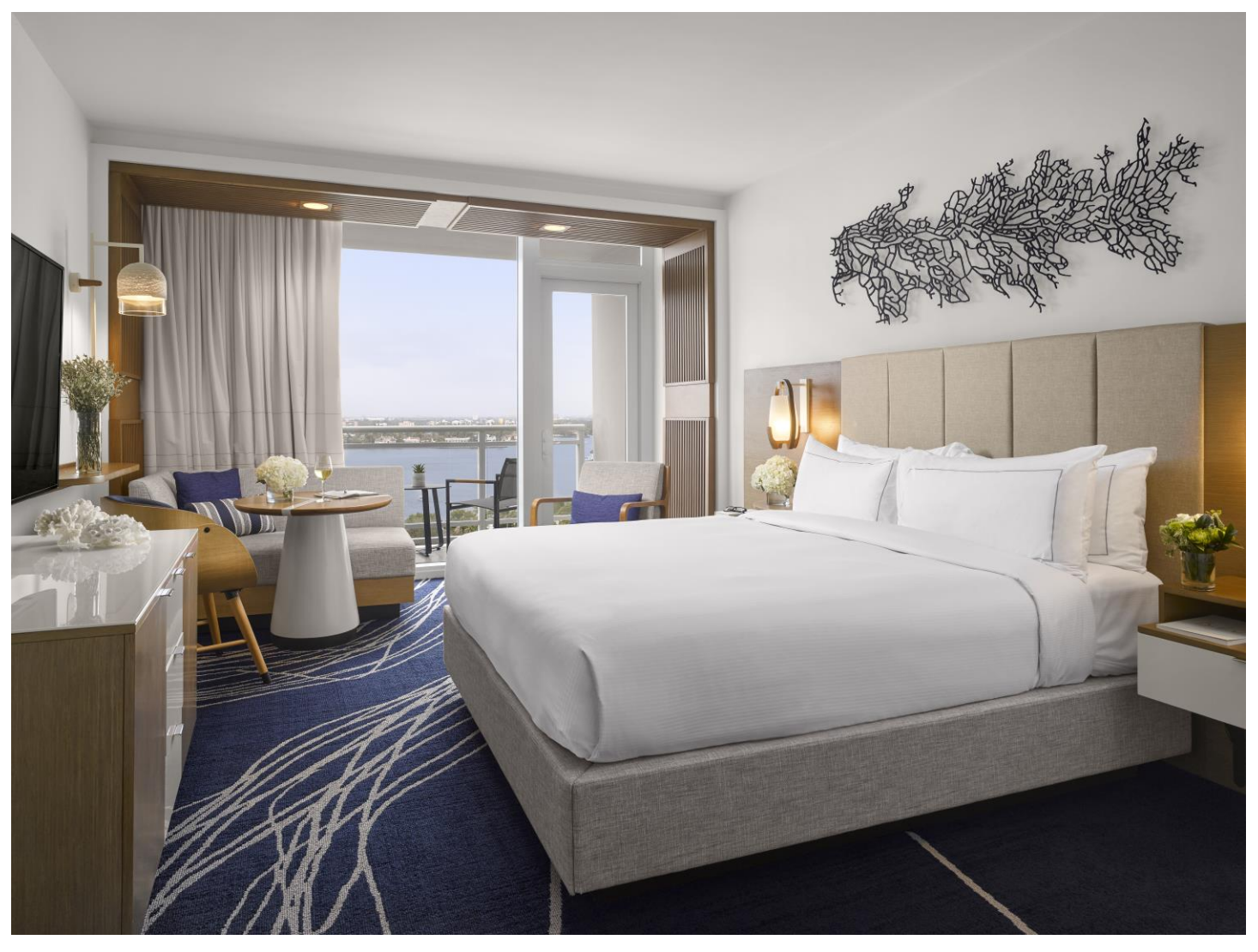
Page 2 of 4