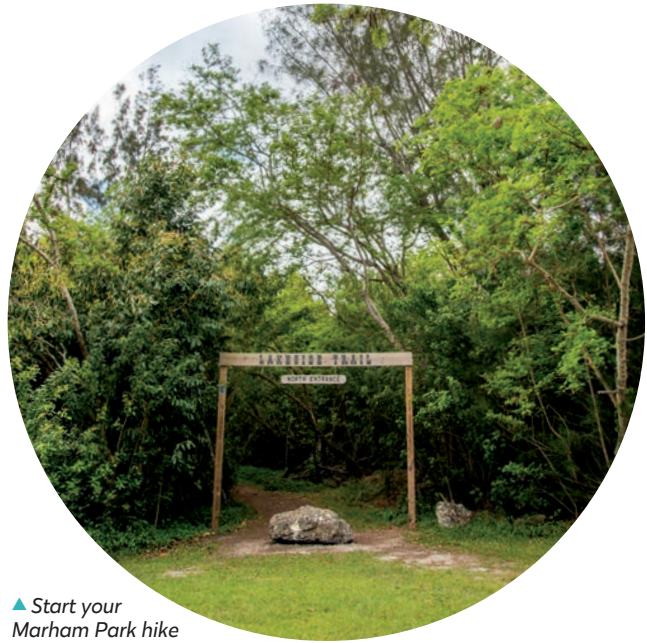
▲ Start your Markham Park hike at this rustic trailhead.