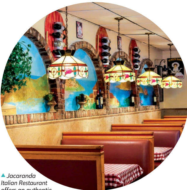
▲ Jacaranda Italian Restaurant offers an authentic menu in a traditional setting.

Bonus Share: Not only is Plantation quiet, but the police force is also very good. They are always respectful, so we respect them for what they do and how they treat people. I give an A+ to the Plantation police force.