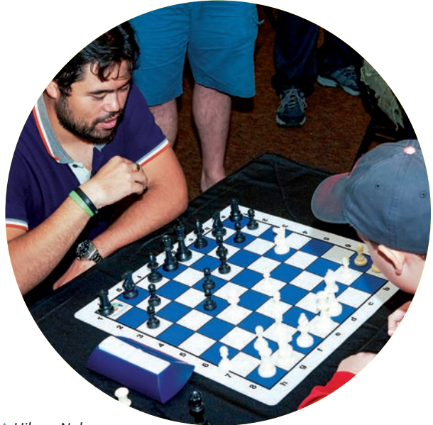
▲ Hikaru Nakamura, five-time US Chess Champion.