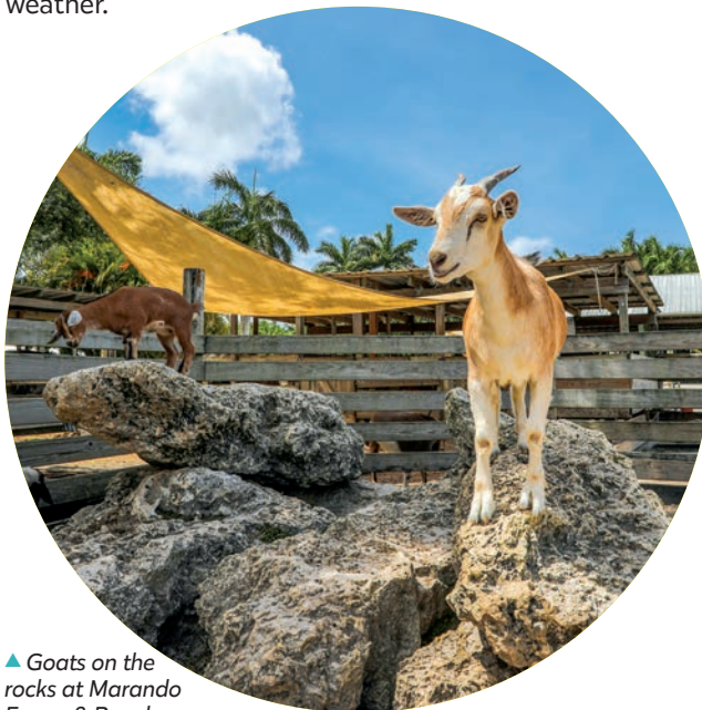
▲ Goats on the rocks at Marando Farms & Ranch.

Homestyle cooking: Flashback Diner off Davie Boulevard is great. It is laid back and relaxing with a lot of outdoor open seating and big outdoor fans for warm weather.