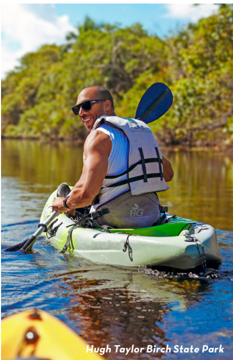
Hugh Taylor Birch State Park

Hugh Taylor Birch State Park , often referred to as the "Central Park" of Fort Lauderdale, is a must-visit for those wanting to explore the trails via hiking or biking without venturing too far from the city centre. Kayaking through the park's waterways offers a fresh perspective on local wildlife, including turtles, manatees, and numerous bird species.