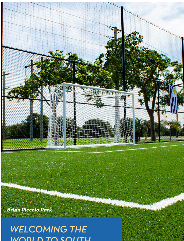
Brian Piccolo Park