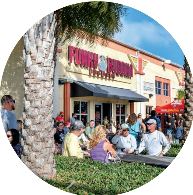
▲ Fun times at Funky Buddha Brewery.

Bonus share: Oakland Park has nice parks if you want to do some family activities in some quiet park spaces.