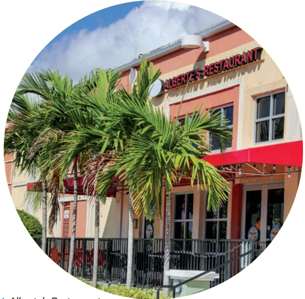
▲ Alberte's Restaurant offers the best in Haitian and Caribbean cuisine.

Bonus share: Oakland Park is less than a 10-minute drive to the beach and everything is central. It has lots of history and is a very easy city to get around.