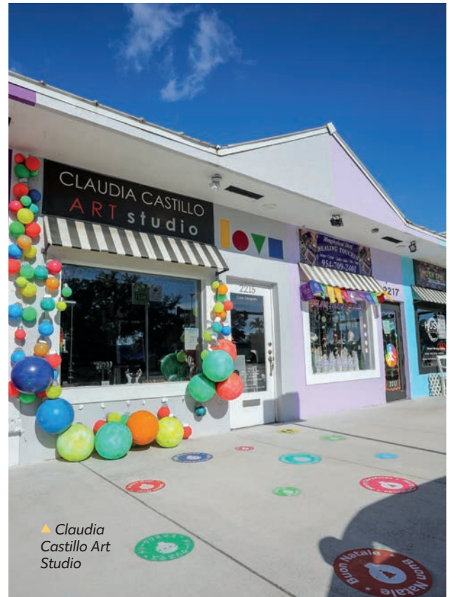
▲ Claudia Castillo Art Studio

▼ Colorful storefronts line the main retail strip on Wilton Drive.