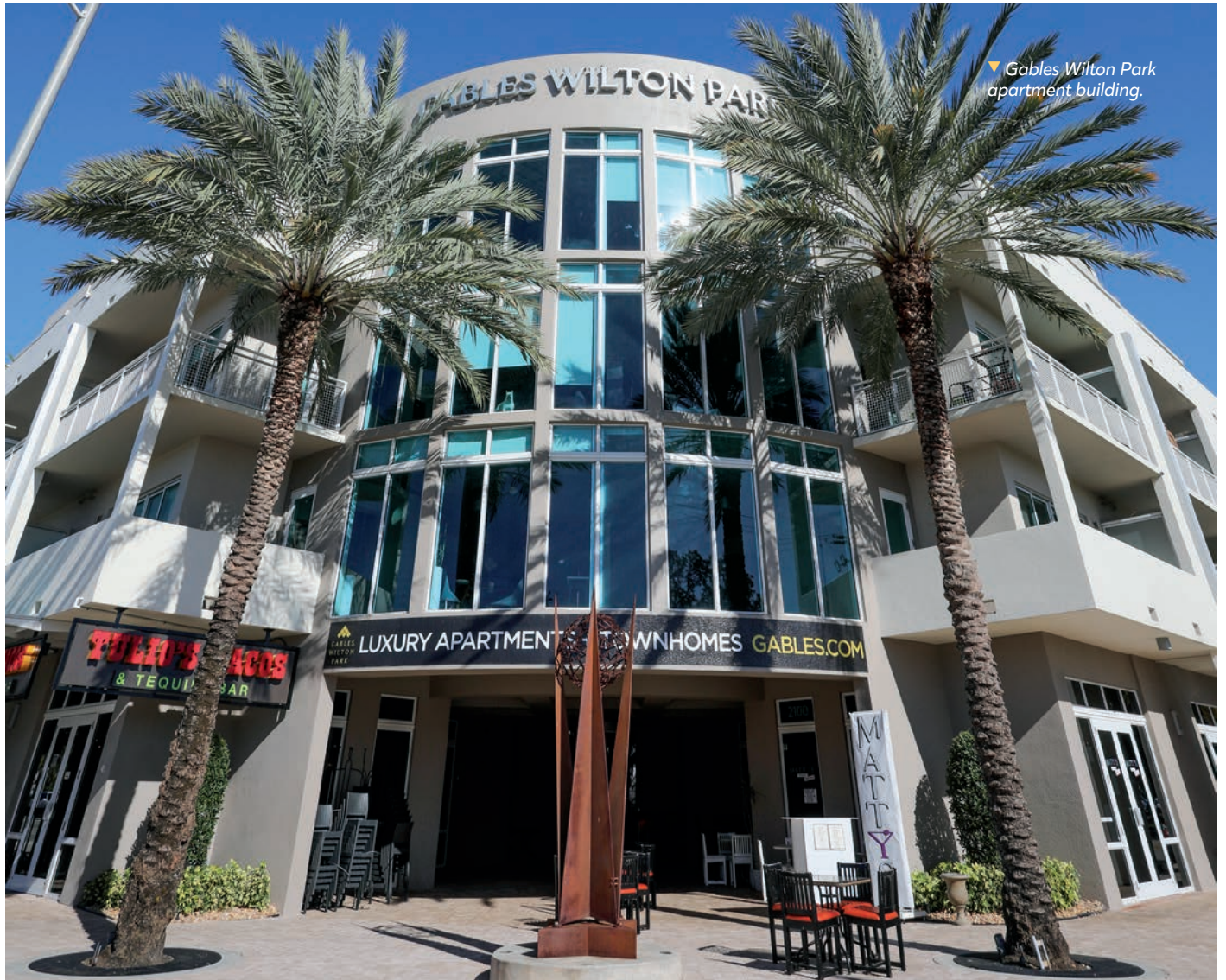
▼ Gables Wilton Park apartment building.