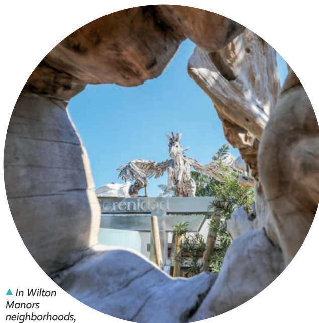
▲ In Wilton Manors neighborhoods, curiosities like a wooden pegasus perch atop modern homes.