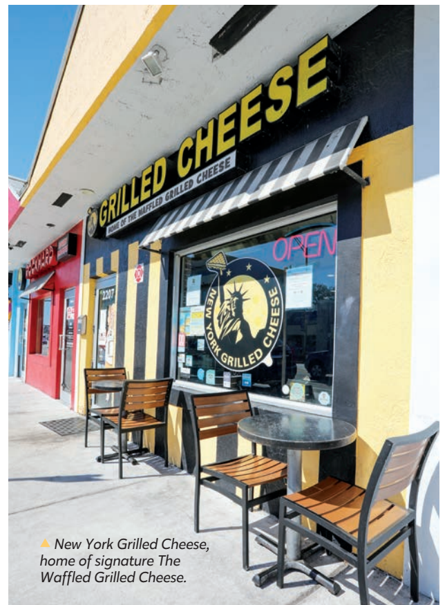
▲ New York Grilled Cheese, home of signature The Waffled Grilled Cheese.

The Island City has mastered the art of seamlessly blending contemporary aesthetic and rainbow canvases with traditional, old-school charm. For the curious, it's always a good day to wander the wonder-filled streets of Wilton Manors.