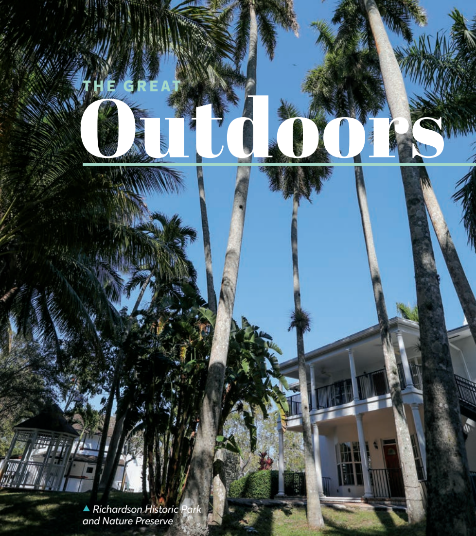
▲ Richardson Historic Park and Nature Preserve