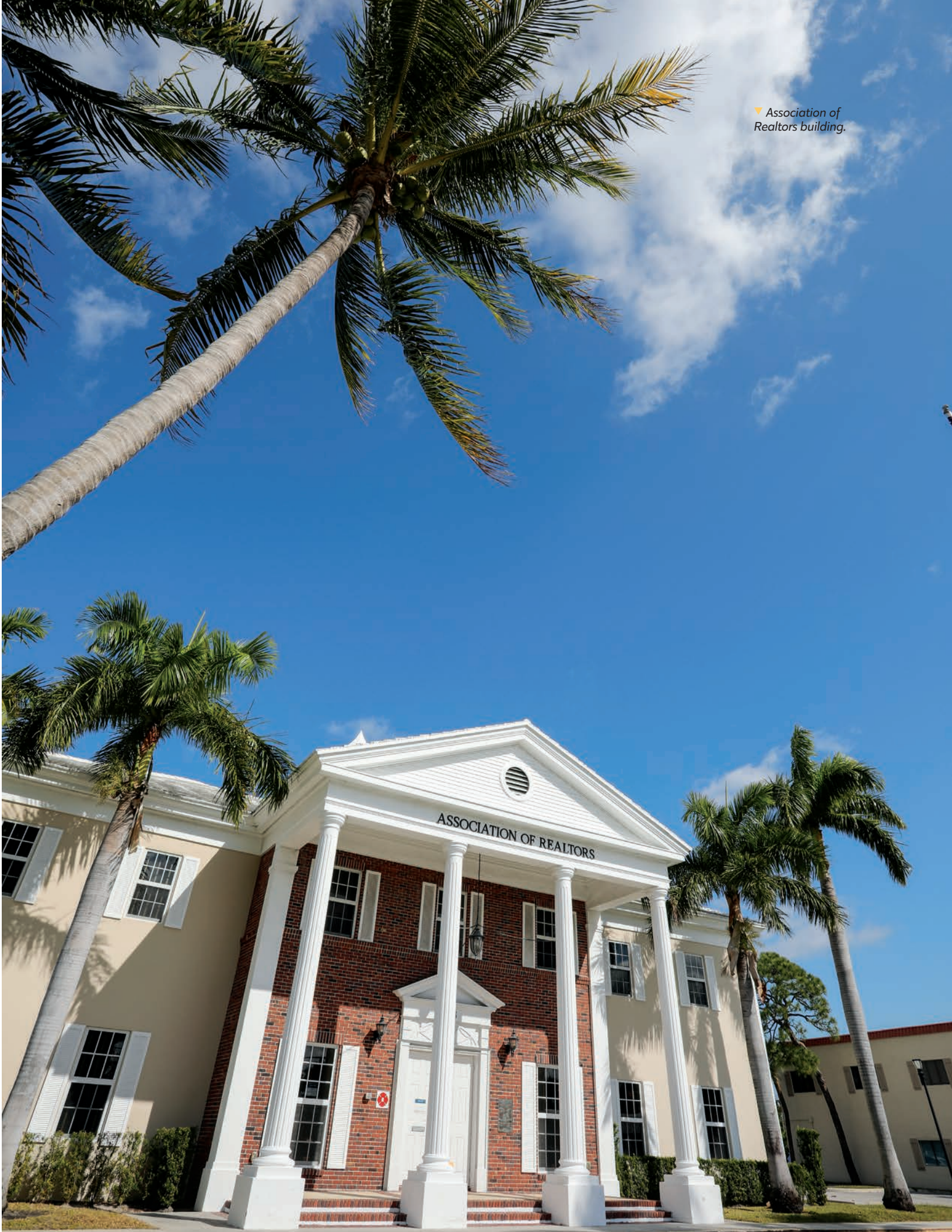
▼ Association of Realtors building.