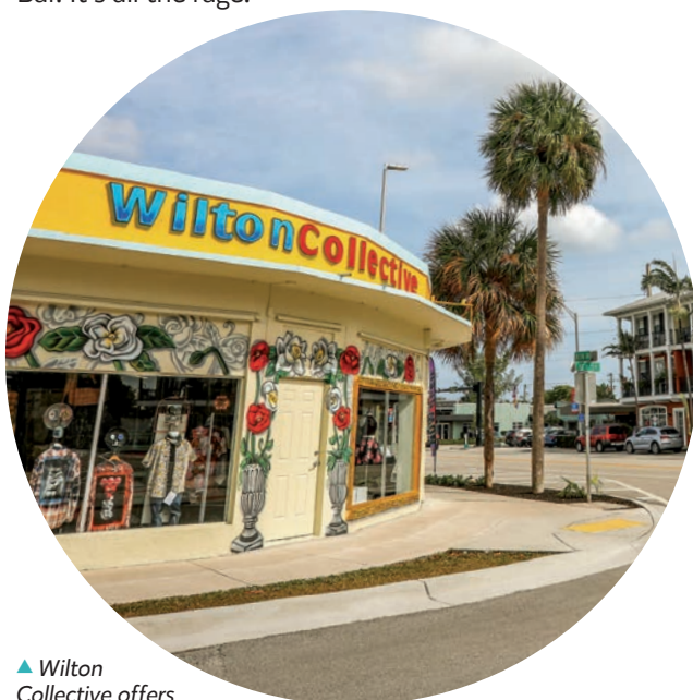
▲ Wilton Collective offers shopping and activities.

Can't choose just one: Every Monday, Bona Italian gives a portion of their proceeds to a different charity. On the weekends, it's all about Rosie's for the burgers and lively atmosphere. On the occasional Friday or Saturday I conclude my night at New York Grilled Cheese. The Buffalo chicken grilled cheese sandwich is out of this world. I'd be remiss if I didn't mention one of the latest hotspots, Tulio's Taco and Tequila Bar. It's all the rage.