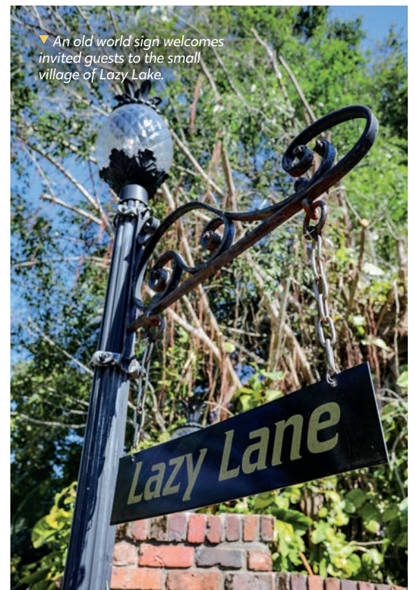
▼ An old world sign welcomes invited guests to the small village of Lazy Lake.

► The Village of Lazy Lake remains a lovingly preserved corner of subtropical wild, doggedly protected by passionate locals. In 1925, the area was a simple limestone quarry supplying the construction of Wilton Manors. Water soon filled the rock pit, creating its storybook lake. Not much for fanfare, or even visitors, Lazy Lake is more of a closely held secret than a tourism attraction.