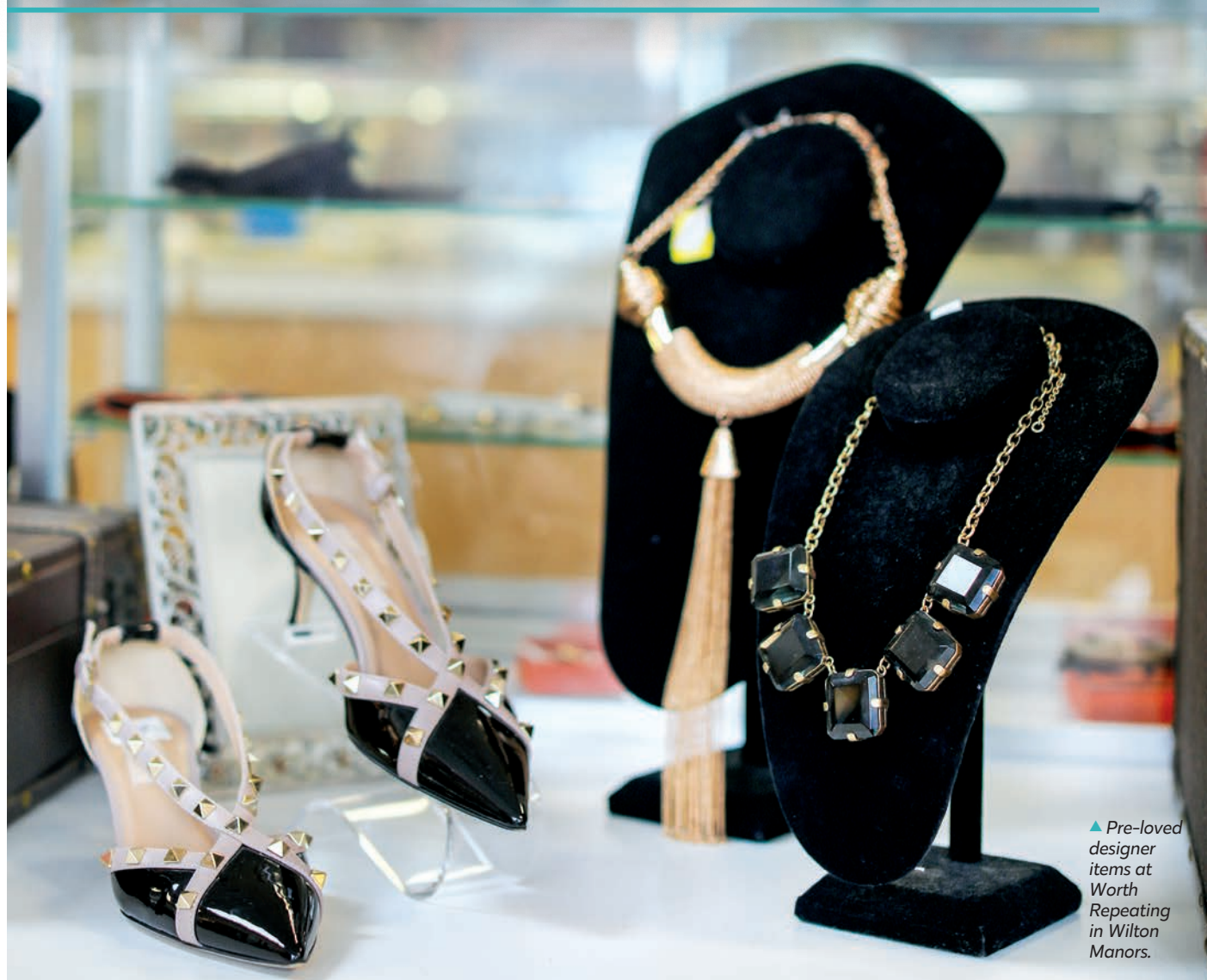
▲ Pre-loved designer items at Worth Repeating in Wilton Manors.

For those with time (and money) to spare in Wilton Manors and Oakland Park, there is no shortage of great shopping. With a massive range of boutique, antique and unique shops to choose from, those who love shopping small, pre-loved or vintage will not be disappointed. Find everything from specialty furniture and vintage clothing to nostalgic treats from the past and perfectly original gifts.