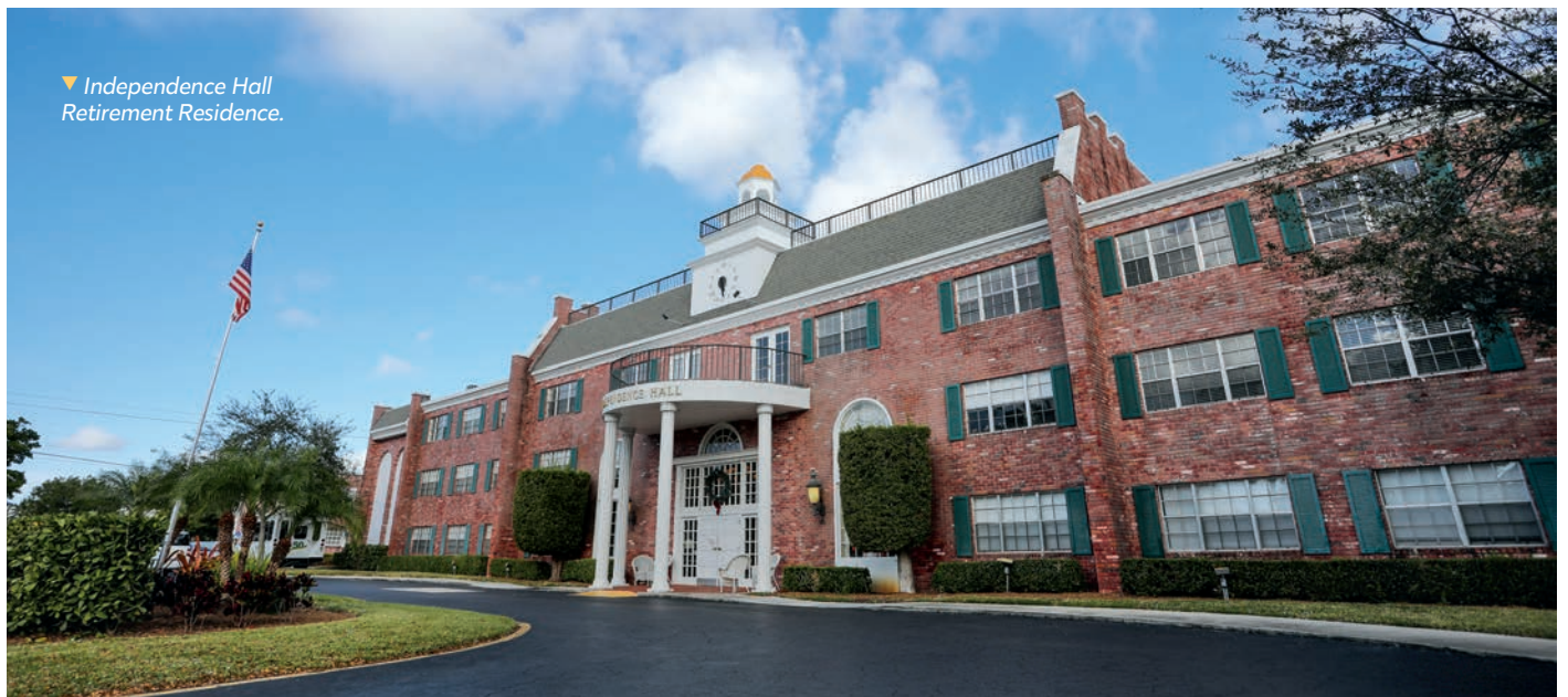
▼ Independence Hall Retirement Residence.