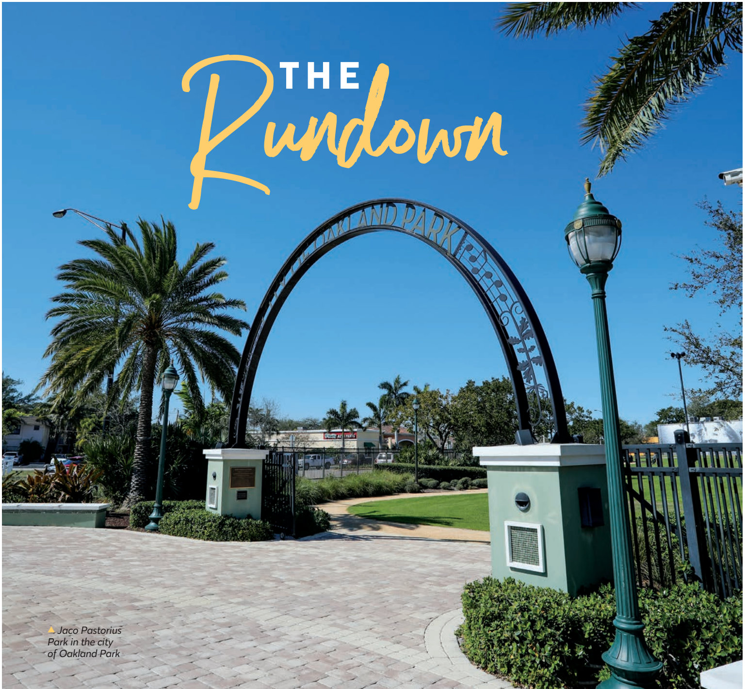
▲ Jaco Pastorius Park in the city of Oakland Park

The quaint communities of Wilton Manors, Oakland Park and Lazy Lake are known by locals for their cozy character, but there's so much more to love.