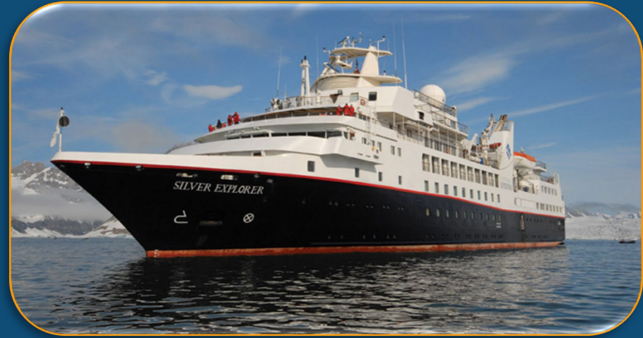
Silversea Cruises' Silver Explorer