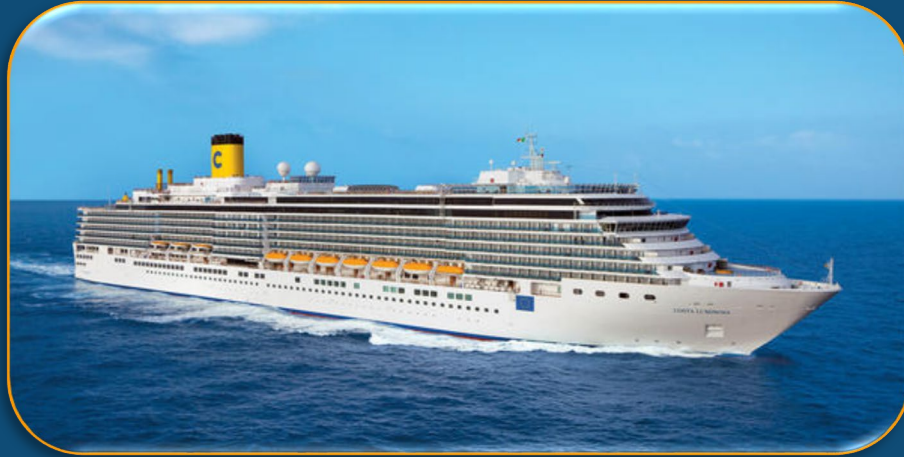
Costa Cruises' Costa Luminosa