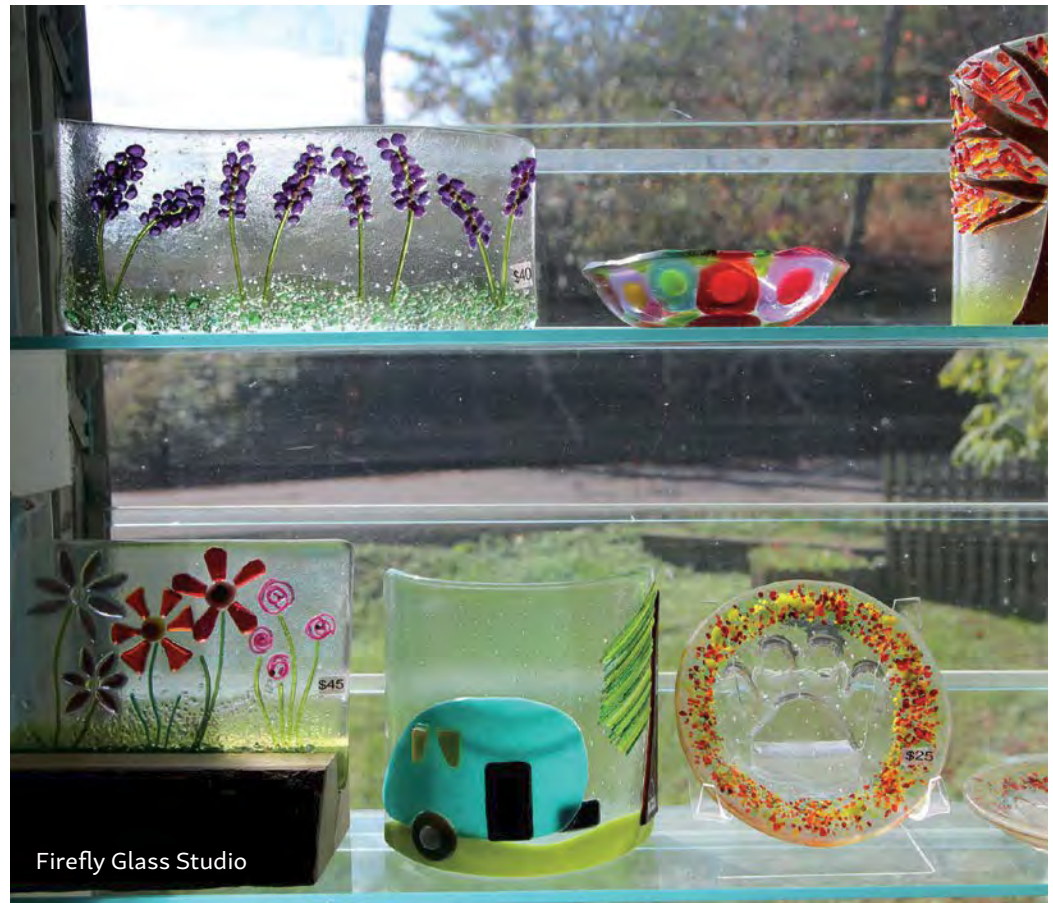
Firefly Glass Studio

Come and enjoy a rich collection of paintings and drawings that tell the story of our beautiful mountains and the amazing heritage that we and they come from.