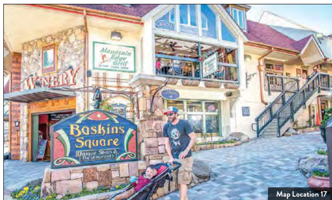
Map Location 17

651 Parkway, Suite 110 (865) 325-6022 tomandearlsbackalleygrill.com Tom & Earl's Back Alley Grill is open Daily and serves Lunch and Dinner. We have a Full-Service Bar and Ice Cold Beer On Tap. Live Music Weekly!