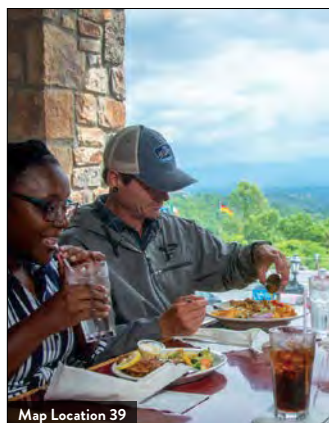
Map Location 39