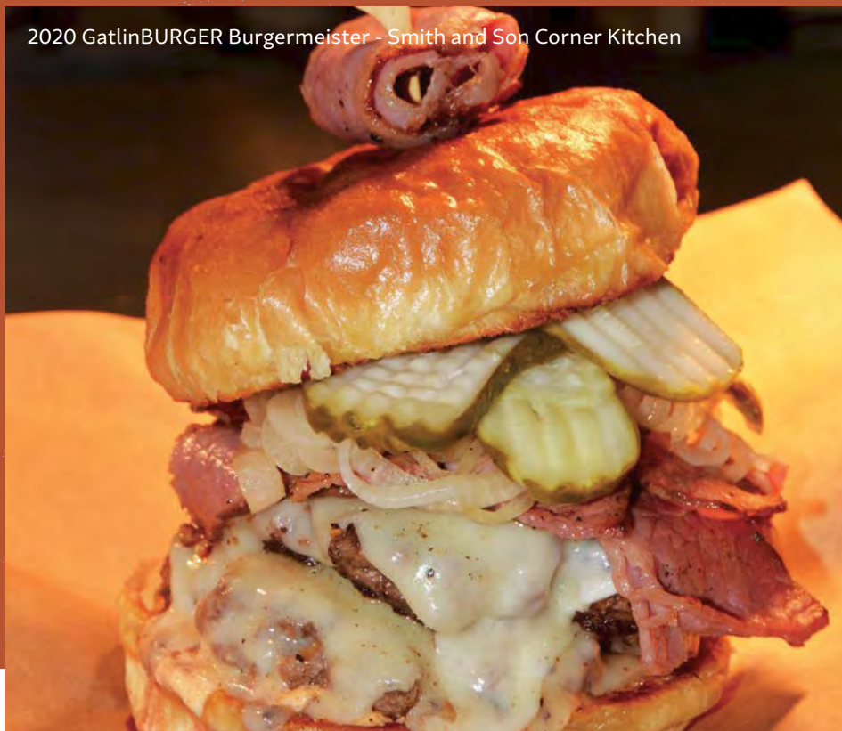
2020 GatlinBURGER Burgermeister - Smith and Son Corner Kitchen

Is there anything more American than a big breakfast? Probably not. (Sorry, apple pie.) Around these parts, we specialize in all kinds of fixins', from fancy to the Far East, but there's just something special about waking up to crisp mountain air and cracklin' bacon. Breakfast is fuel for the day. Motivation to get out of bed. And just really good. Grab a seat at one of our many eating establishments that serve up a mean plate of morning grub, from Crockett's Breakfast Camp to the Little House of Pancakes to Flapjacks Pancake Cabin or the Log Cabin Pancake House (hmm...we're sensing a theme). Bring the little ones and the big ones and dig in to the day.