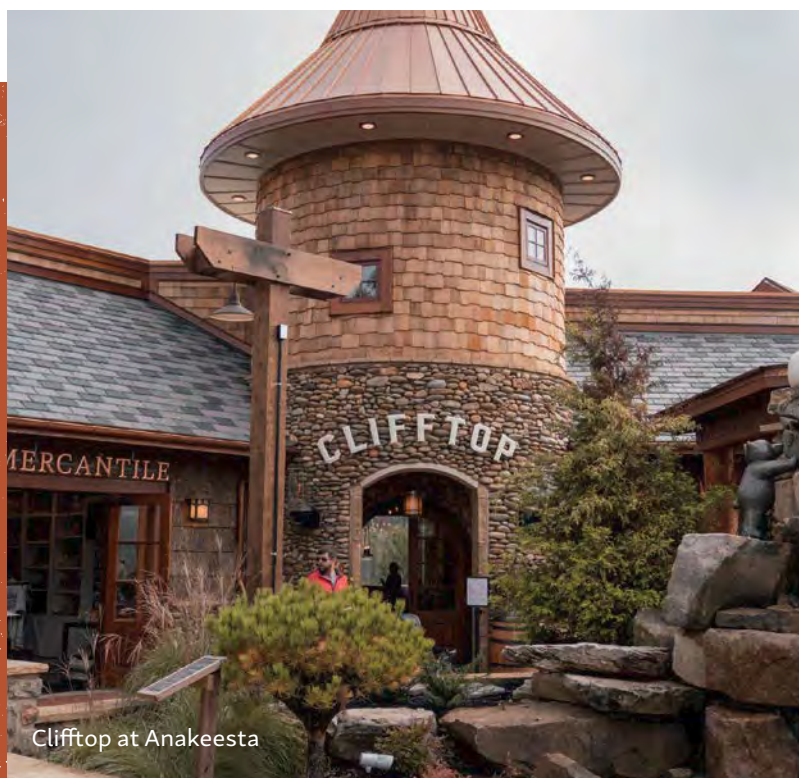
Clifftop at Anakeesta