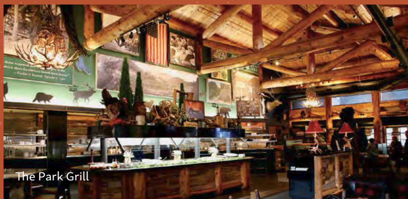
The Park Grill

If you haven't been paying attention, you might not know that we've become a bit of a destination for burger geeks all over the country. So much so that in 2020, we launched our own burger celebration, aptly titled GatlinBURGER Week. For seven days, restaurants in town compete in the ultimate burger-making challenge, bringing their best off-menu gourmet burgers to a table near you for an everyday burger price. While you're here - for GatlinBURGER Week or otherwise - swing by any of our local restaurants where they're vying for top burger honors everyday. You be the judge. What is your favorite GatlinBURGER?