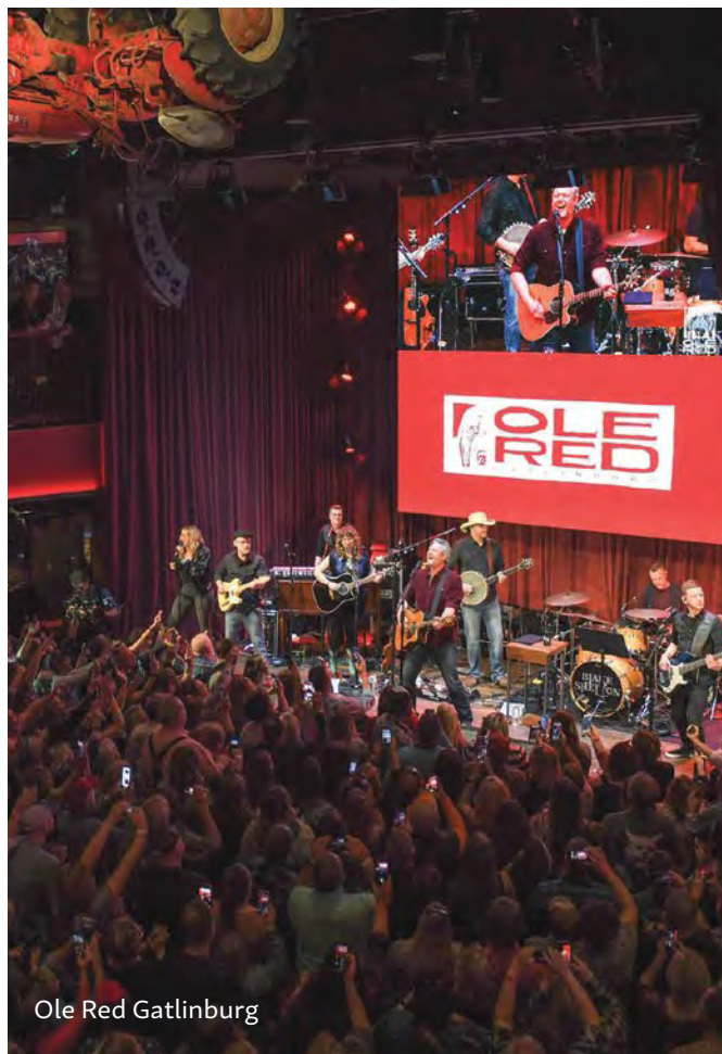
Ole Red Gatlinburg