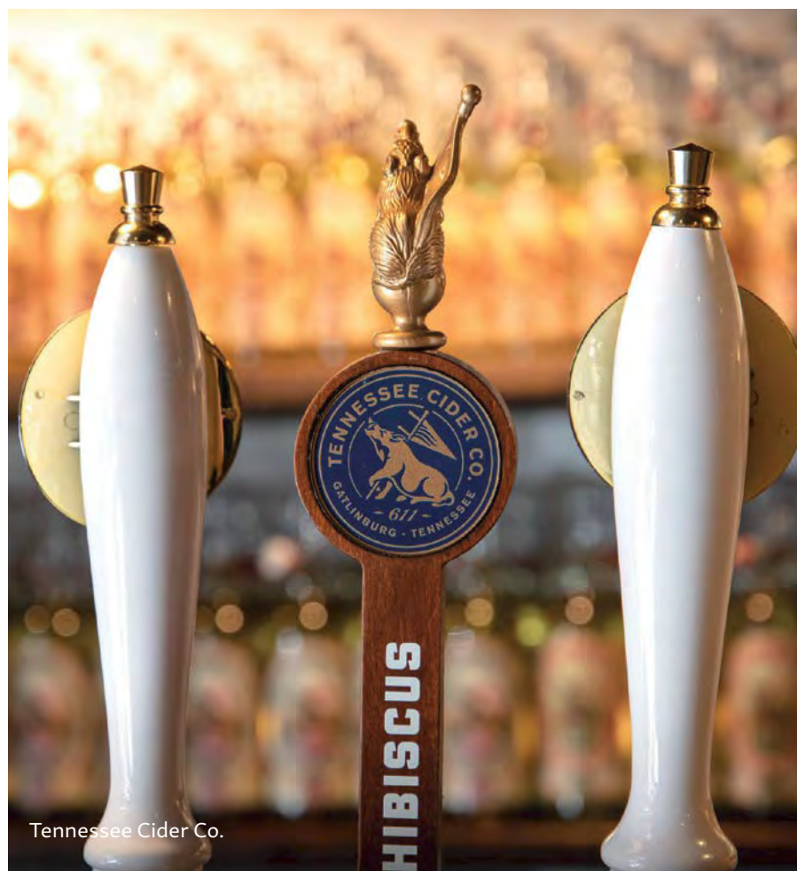
Tennessee Cider Co.

This here's moonshine country, but you wouldn't know it by the amount of breweries, wineries, and cideries we've got, on—ahem—tap. Between hot-spots like Doc Collier's, Sugarlands Distilling and the Tennessee Cider Co. (pictured here), you could pack an entire weekend full of superior sippin' and still need a few days to get everything in—and see straight again. Belly up to the bar at the aforementioned Sugarlands Distilling for their small batch "Roaming Man Rye," a collectible that was inspired by the spirit of both exploration and tradition—embodying the perfect blend of so much of what we do and who we are in Gatlinburg. However you choose to explore our liquid bounty, we ask that you enjoy what we have to offer responsibly, and in good company.