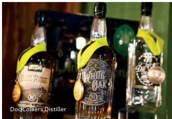
Doc Colliers Distiller

888-765-9463 • 865-436-7551 • smokymountainwinery.net