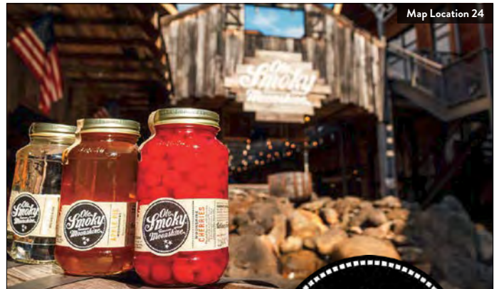
Map Location 24