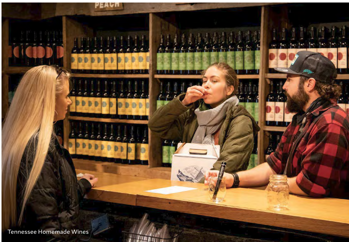
Tennessee Homemade Wines