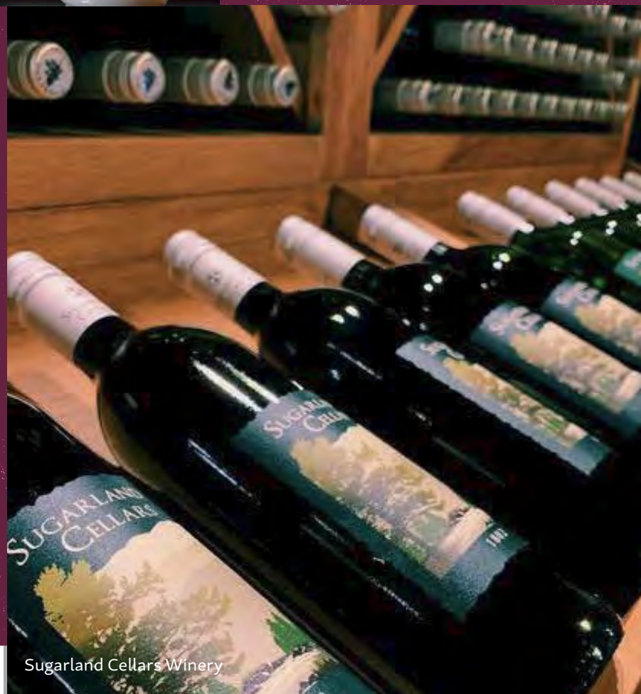
Sugarland Cellars Winery

Calling all vinophiles! While everyone knows about Napa and Sonoma and all the other famous West Coast valleys that produce so much of our nation's wine, Gatlinburg is a hidden gem, known only to those curious enough to try something off the beaten vineyard. A walkable city center makes winery hopping convenient and much safer than the alternatives, too. In fact, nearly all of our wineries, including Sugarland Cellars, Little Bear Winery, and Tennessee Homemade Wines, are located right on the Parkway—some even within a bottle or two's distance of each other. Whether you're in town for a girls' getaway or a romantic weekend, don't put a cork in your stay until you've treated yourself to a glass or two of something special that proves you can get good wine east of the Mississippi—if you know where to look.