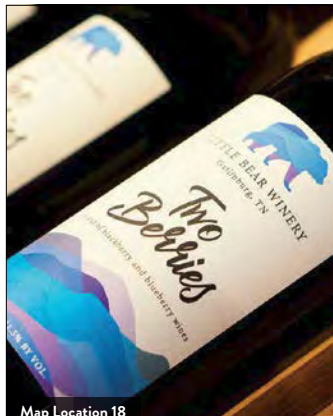
Map Location 18