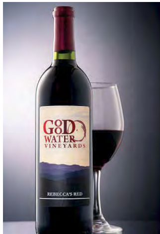
Map Location 66