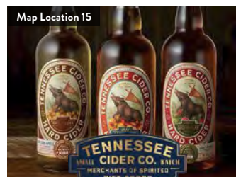
Map Location 15

Tennessee Cider Company, Gatlinburg's first true Cidery, located in the heart of downtown. It's an Old General Store feel with incredible locally made Ciders and wet goods made by great local folks.