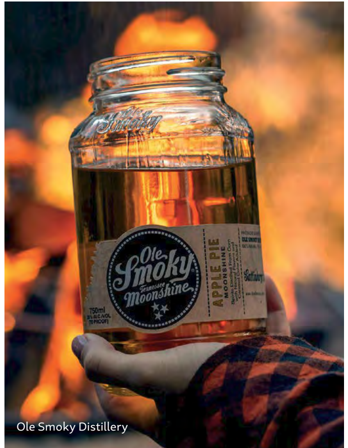
Ole Smoky Distillery

643 Parkway (865) 412-1030 tnhomemadewines.com Rooted deep in family tradition, Tennessee Homemade Wines is a true taste of Gatlinburg. Made with local fruit, crafted by local folk, and served by local friends. Stop in for free tasting. Open 7 days a week.