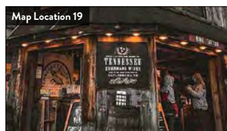
Map Location 19

BOTTLED IN THE HEART OF EAST TENNESSEE TENNESSEE HOMEMADE WINES MADE IN THE HEART OF THE SOUTH GATLINBURG, TN