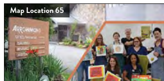
Map Location 65

National Arts Education Center. Weekend, one-week and two-week workshops in all craft media. Scholarships for local community members, teachers, veterans. Galleries, art supply store, and library free and open to the public. Enriching Lives Through Art and Craft.