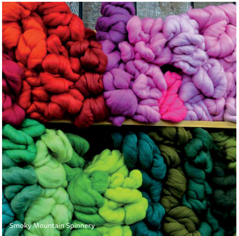
Smoky Mountain Spinnery

On the off chance no creations catch your eye, many of our artisans are more than happy to teach you how to make your own. Whether you mold clay into a one-of-a-kind keepsake with guidance from a Smoky Mountain potter or learn how to melt and manipulate glass into a delicate decoration at one of our glass blowing studios, you're sure to leave with a handmade memory you'll cherish forever.