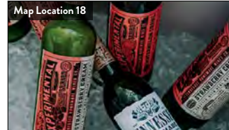
Map Location 18

DISCOVER HOW IT'S MADE WITH A FREE TOUR!