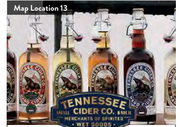
Map Location 13

Tennessee Cider Company, Gatlinburg's first true Cider, located in the heart of downtown. It's an Old General Store feel with incredible locally made Ciders and wet goods made by great local folks.