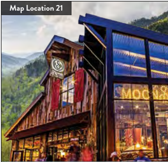
Map Location 21

Sugarlands DISTILLING CO. GATLINBURG, TENNESSEE