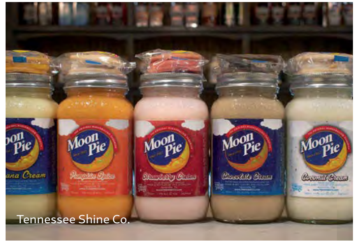
Tennessee Shine Co.

888-765-9463 • 865-436-7551 • smokymountainwinery.net