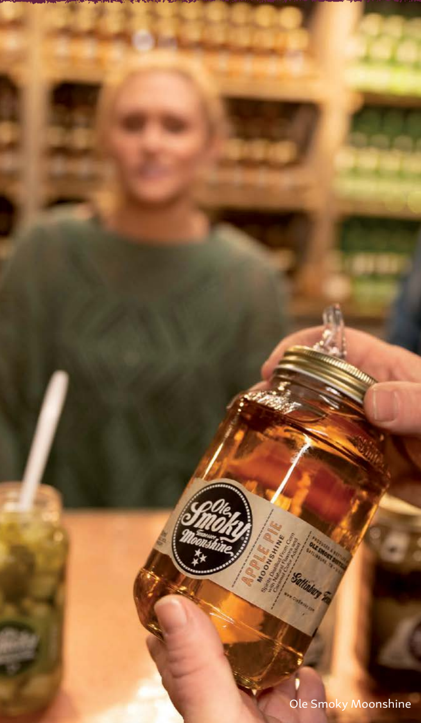
Ole Smoky Moonshine