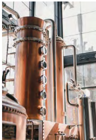
Map Location 59