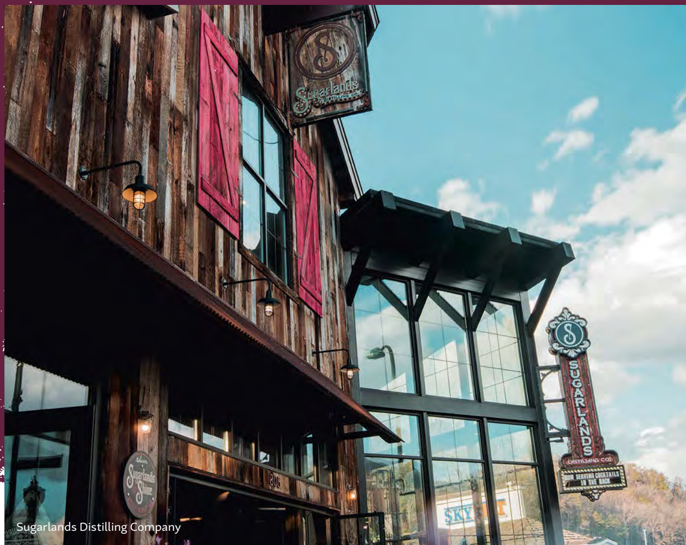
Sugarlands Distilling Company

Winemaking, on the other hand, doesn't have quite as glamorous a history in Gatlinburg. But that's not holding our local vintners back. Just embark on one of our two wine trails to see what we mean. Both Rocky Top and Gatlinburg Wine Trails have free tastings at each stop. Just grab your official Wine Trail Passport and you'll be ready to sample your way through the best vino the Smokies have to offer.