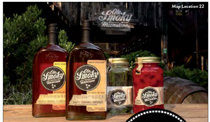
Map Location 22