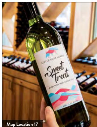
Map Location 17