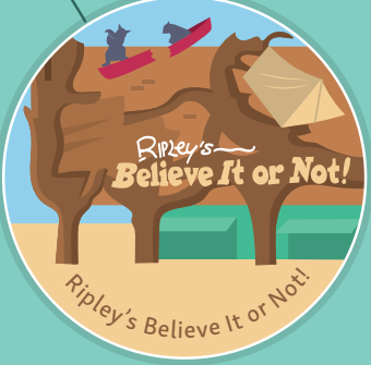
Ripley's Believe It or Not!