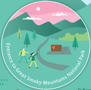
Entrance to Great Smoky Mountains National Park