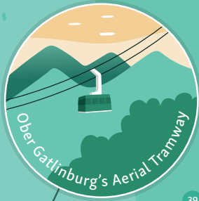
Ober Gatlinburg's Aerial Tramway