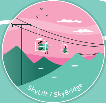
SkyLift / SkyBridge