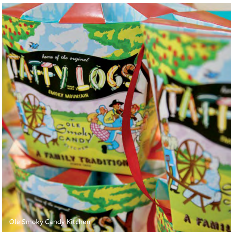
Ole Smoky Candy Kitchen

Stroll down the parkway to find niche stores of all varieties. From houseware, hiking gear, and homemade soaps to hand-carved signs and handmade treats and more – it's a melting pot of the brand-name and locally made, making for a memorable shopping experience in the mountains.