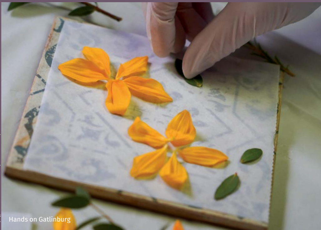
Hands on Gatlinburg

The Community now consists of an eight-mile loop of shops, studios and galleries that countless experts in ceramics, doll-making, jewelry, painting, woven goods and more call home. Many of them come from a long line of creators who have made it their life's work to master their craft before passing it onto the next generation—a fact that gives visitors an exclusive look at age-old techniques that have stood the test of time.