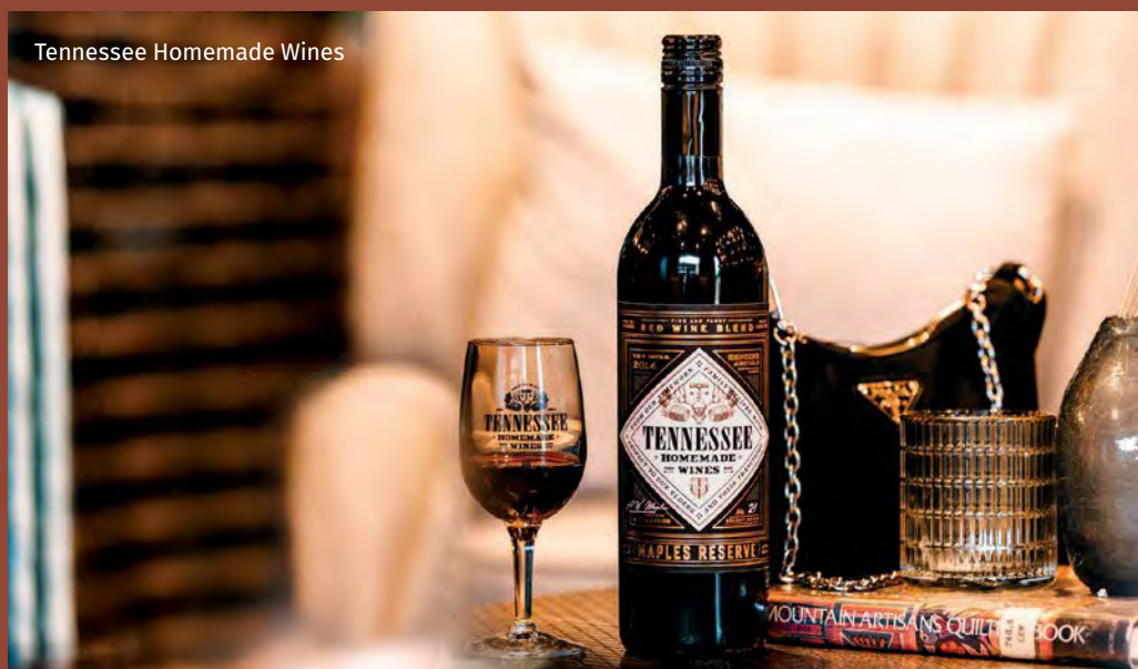
Tennessee Homemade Wines

Though our past is rich with the clear whiskey-making craft, we've begun new traditions since then, too. Take the Gatlinburg Wine Trail for instance. The trail is dotted with local vineyards offering plenty of southern sweet and Tennessee-made varietals to taste, toast and take back home. There's even a Wine Trail Passport to make your vino voyage official!