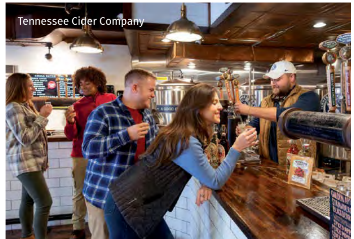
Tennessee Cider Company

888-765-9463 • 865-436-7551 • smokymountainwinery.net