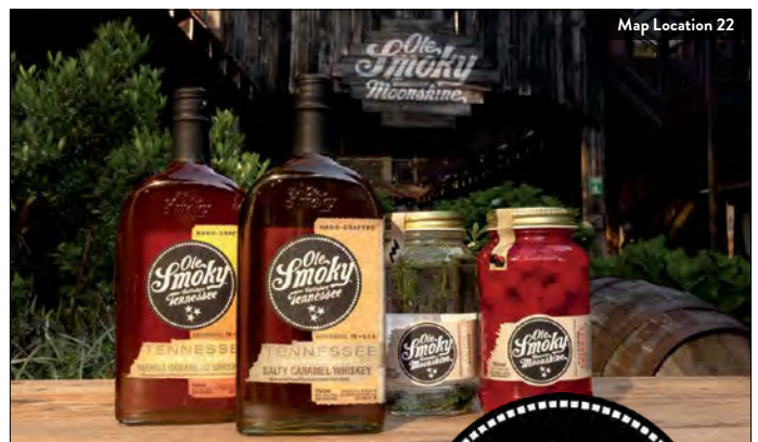
Map Location 22