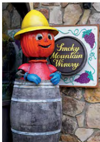
Map Location 53