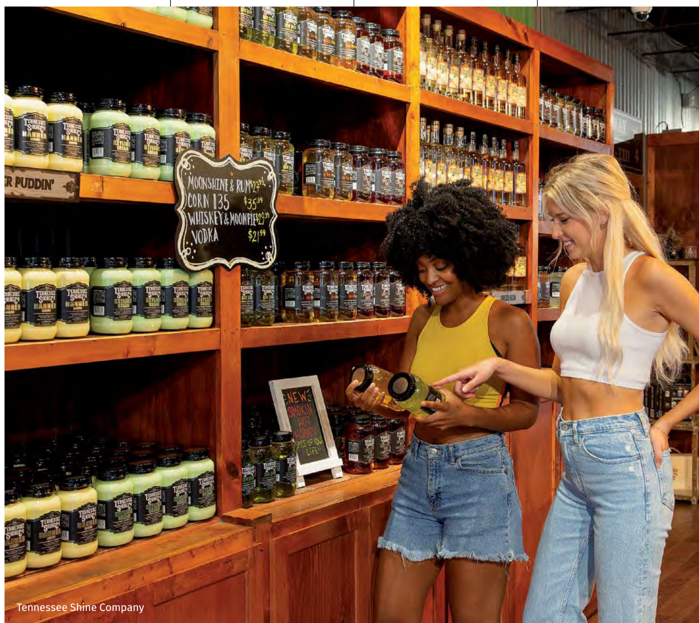
Tennessee Shine Company

1133 Parkway (865) 325-1110 sugarlandcellars.com Stop in today for a tour of our wine cellar and a free wine tasting! Open 7 days a week. Located at traffic light #10 across from NOC's Great Outpost.