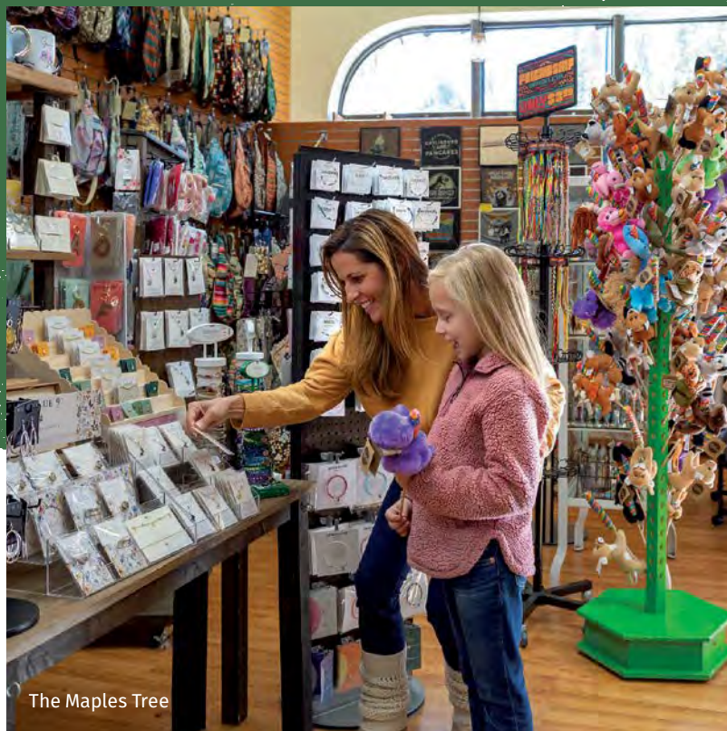
The Maples Tree

Not all souvenirs are made to last. For those who prefer the edible sort, you're in store for a whole host of treats. From juicy caramel apples and decadent chocolates to homemade taffies and candies of all kinds, try as many as you dare or take some home to share! Either way, all it takes is a little shopping around to get your hands on a sugar fix you'll only find in Gatlinburg.