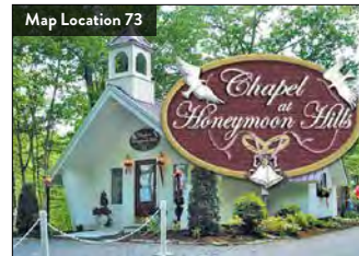
Map Location 73

865-430-3372 • 800-693-6479 • ChapelatthePark.com