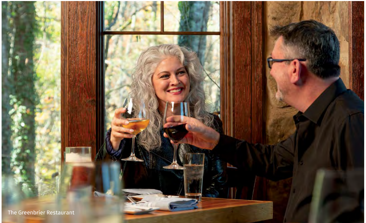
The Greenbrier Restaurant