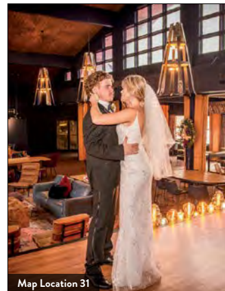
Map Location 31