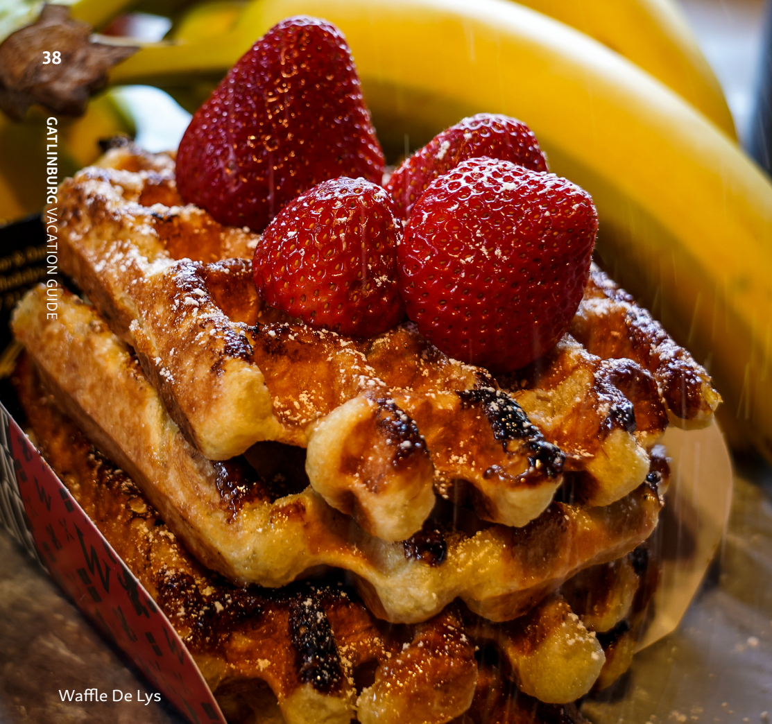
Waffle De Lys

Walking the Parkway is a time-honored tradition that can burn some calories. If you're in need of fuel for the next game of mini golf or shopping excursion, Gatlinburg eateries offer a weary soul a dizzying array of choices. Internationally speaking (I'm talking French here) Gatlinburg has Authentic Belgian waffles and a walkup French Creperie that will have your taste buds crying "ooo la la!" Needing something heartier? Snag a Reuben at the Cheese Cupboard and Hofbrauhaus in The Village or a street style bratwurst from Fannie Farkle's. Don't forget to checkout Gatlinburg's newest restaurant - Guy Fieri's Chicken Guy! for chicken tenders that will make you question which came first... the "chicken or the egg?"