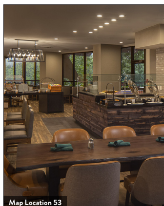
Map Location 53