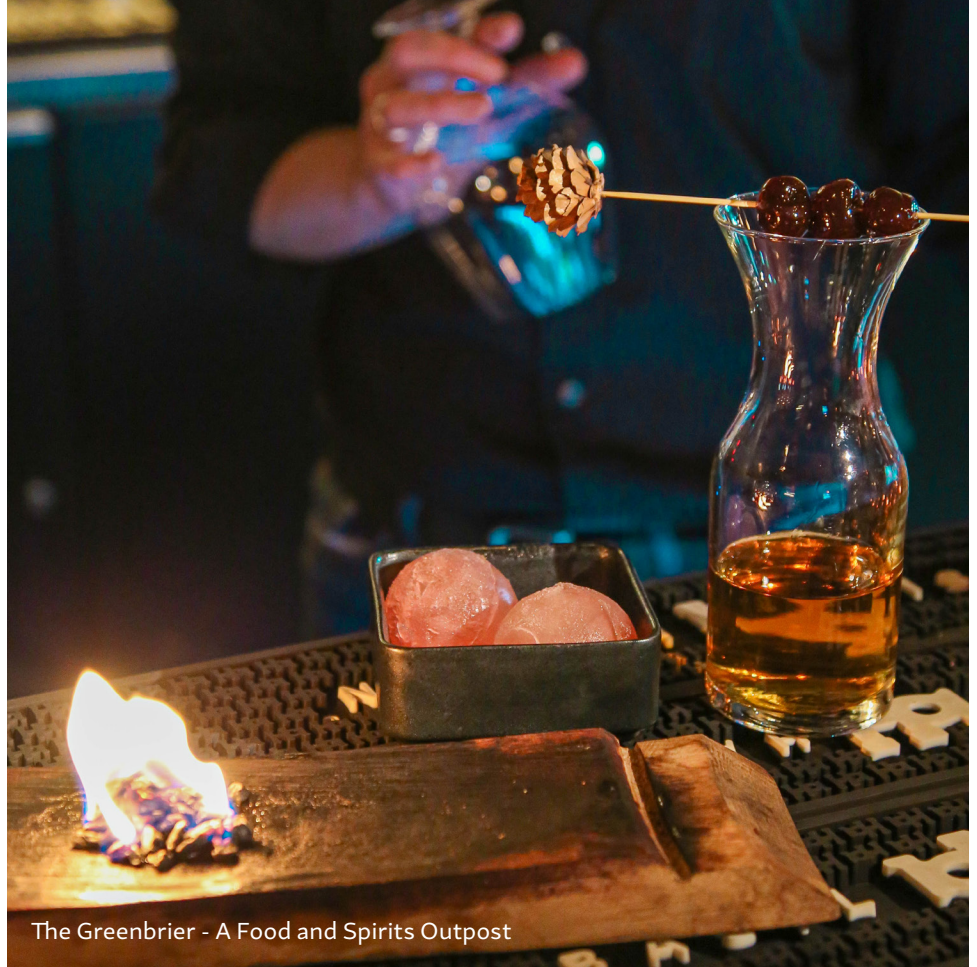
The Greenbrier - A Food and Spirits Outpost

One way to impress your travel companion is by reserving a table at The Greenbrier - A Food and Spirits Outpost. This top-notch steakhouse touts chef-inspired menus for both food and libations. Speaking of which, order the Dylan (pictured here) for their take on an Old Fashioned that's anything but dated. Other spots to cook up some romance include Cherokee Grill, The Peddler Steakhouse, The Park Grill and, for dinner and a show, Blake Shelton's own Ole Red.