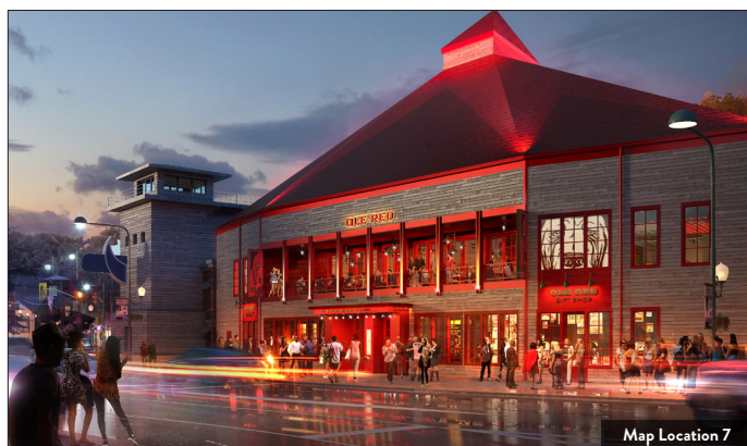
Map Location 7

800-251-9202 • 865-436-5423 • obergatlinburg.com