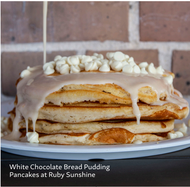
White Chocolate Bread Pudding Pancakes at Ruby Sunshine