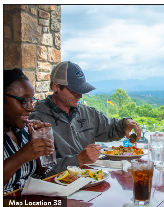
Map Location 38