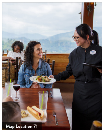
Map Location 71