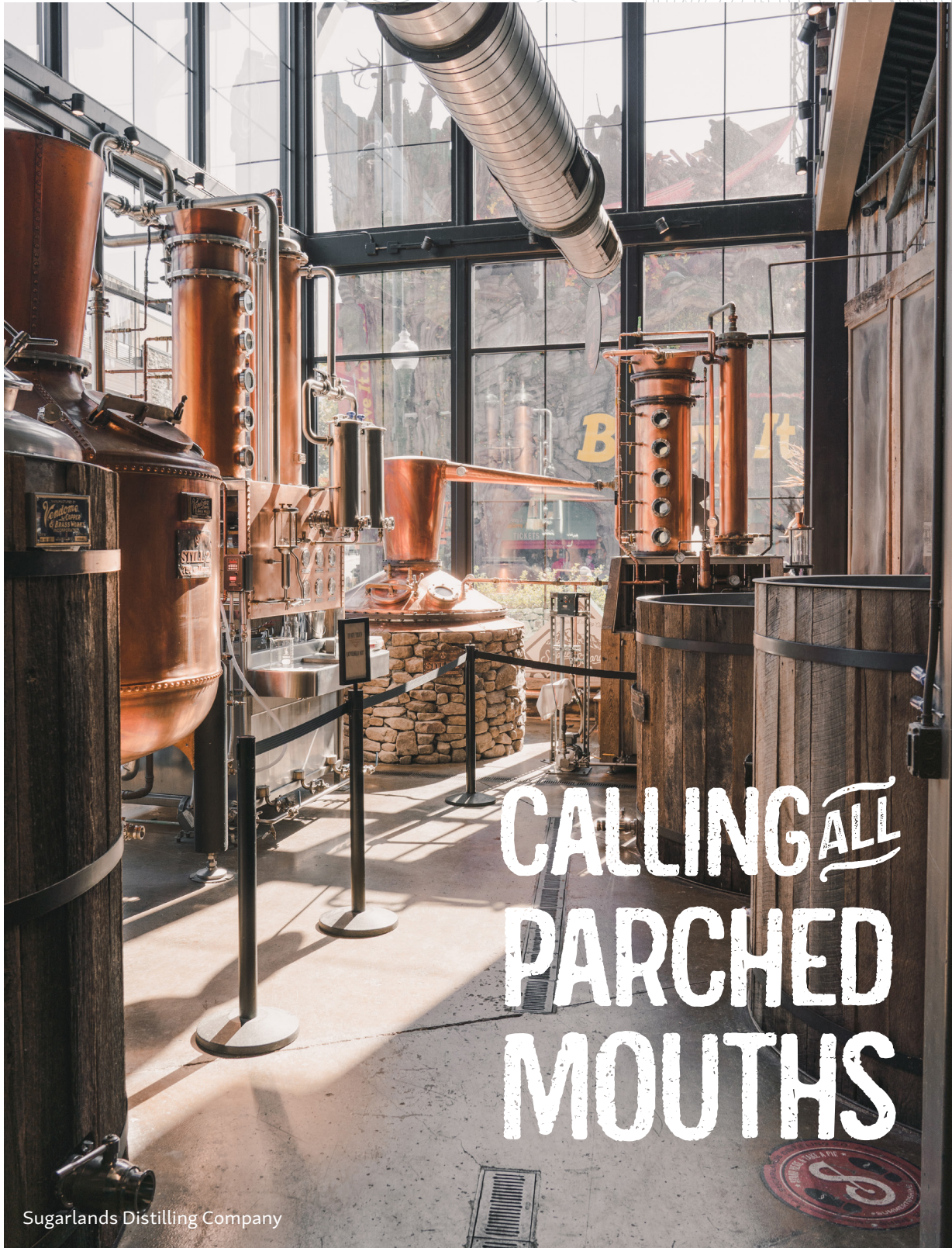
Sugarlands Distilling Company