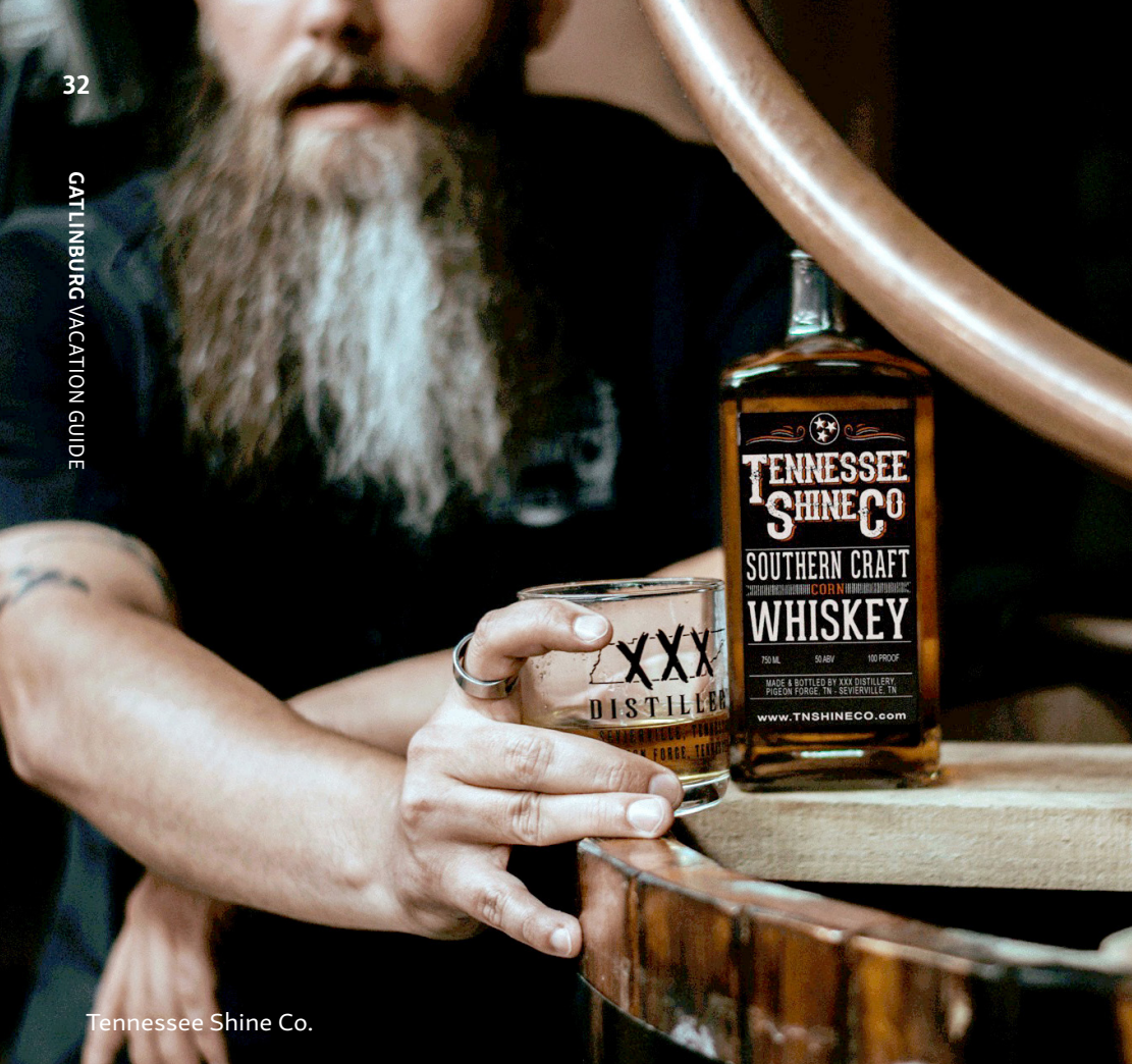
Tennessee Shine Co.

It's about quality, not quantity, for the folks at Tennessee Shine Co. That's why you'll only find small-batch moonshine and whiskey with their name on it. Take their Moonshine History Tour for a little education before enjoying a free tasting. From classics like Tennessee Straight Bourbon Whiskey to the more playful Blue Houdini, TN Shine Co. sticks to family recipes that have been passed down for generations. So, whichever flavor you choose, you know you're going to be sipping something good.