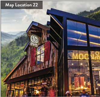
Map Location 22

Sugarlands DISTILLING CO. GATLINBURG, TENNESSEE