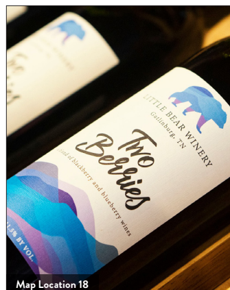
Map Location 18