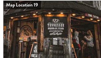
Map Location 19