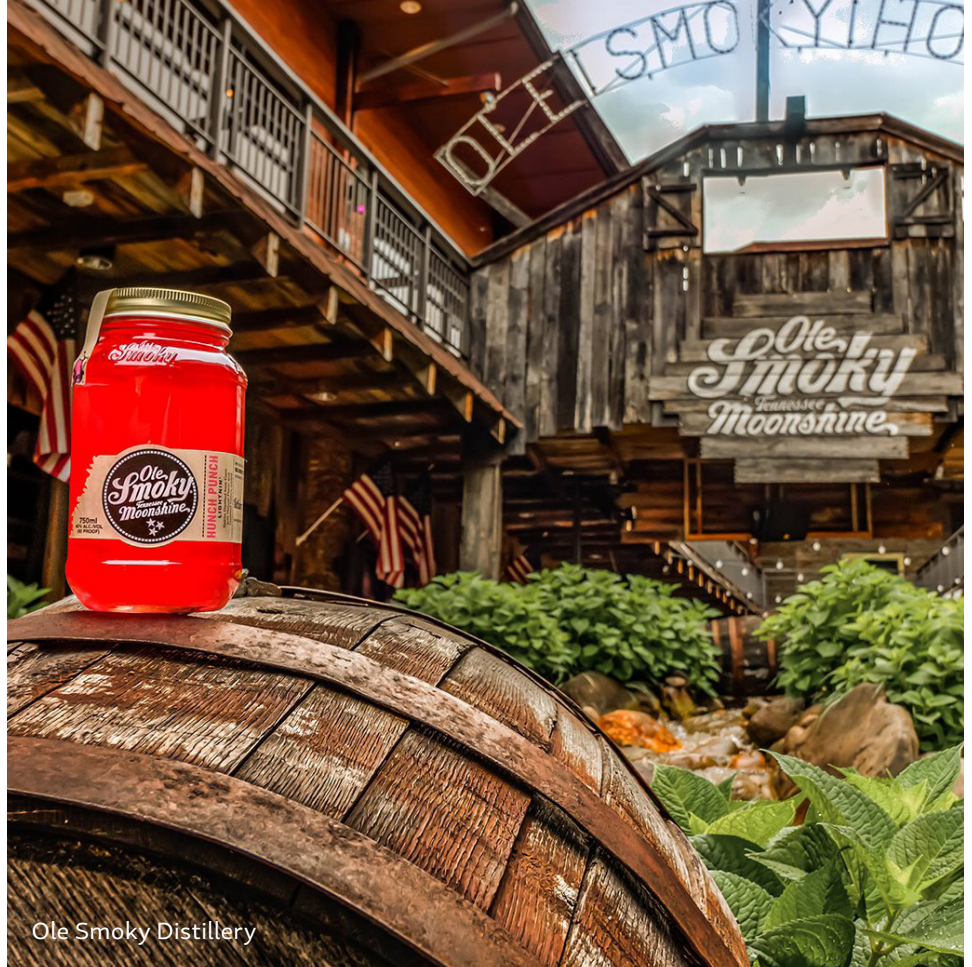
Ole Smoky Distillery

As Tennessee's first legal moonshine distillery, Ole Smoky also knows a thing or two about what makes a good jar. Bring the whole family for a self-guided tour where you can check out their authentic copper stills in action. Then hunker down in the holler for a live bluegrass show every day from noon until dark to really round out the entire experience. We'd be surprised if you don't take a jar or two home—you won't find a smoother souvenir this side of the Smokies.