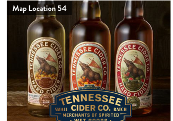
Map Location 54

Tennessee Cider Company, Gatlinburg's first true Cidery, located in the heart of downtown. It's an Old General Store feel with incredible locally made Ciders and wet goods made by great local folks.