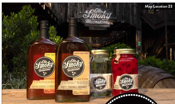
Map Location 23