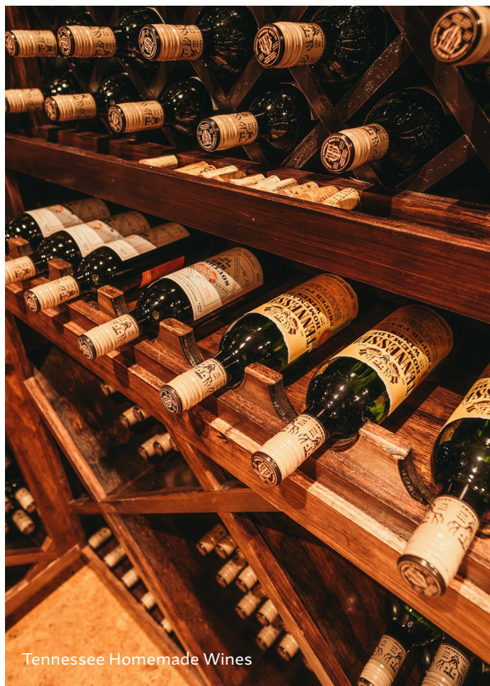
Tennessee Homemade Wines

519 Parkway (865) 325-1468 tnshineco.com Visit the NEWEST distillery in Gatlinburg and get an authentic taste of Smoky Mountain Shine.