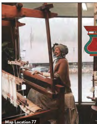
Map Location 77