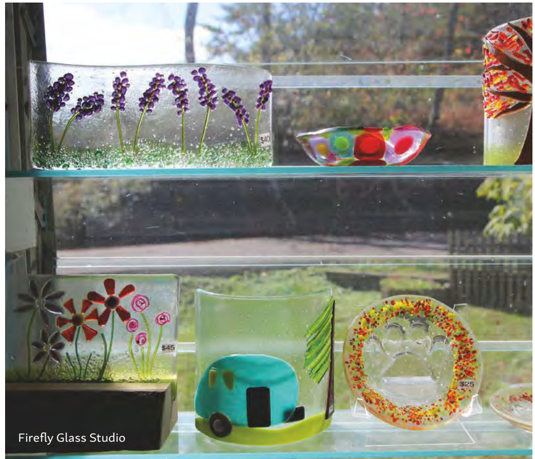
Firefly Glass Studio

Come and enjoy a rich collection of paintings and drawings that tell the story of our beautiful mountains and the amazing heritage that we and they come from.