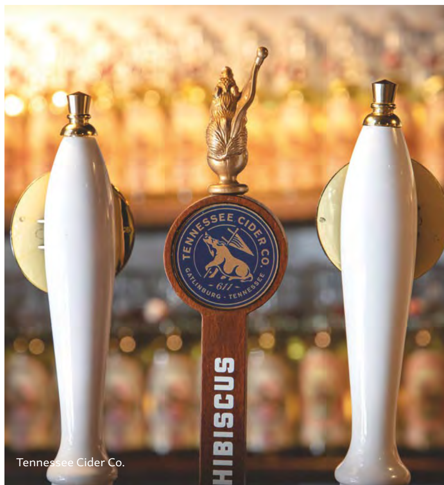
Tennessee Cider Co.

This here's moonshine country, but you wouldn't know it by the amount of breweries, wineries, and cideries we've got, on—ahem—tap. Between hot-spots like Doc Collier's, Sugarlands Distilling and the Tennessee Cider Co. (pictured here), you could pack an entire weekend full of superior sippin' and still need a few days to get everything in—and see straight again. Belly up to the bar at the aforementioned Sugarlands Distilling for their small batch "Roaming Man Rye," a collectible that was inspired by the spirit of both exploration and tradition—embodying the perfect blend of so much of what we do and who we are in Gatlinburg. However you choose to explore our liquid bounty, we ask that you enjoy what we have to offer responsibly, and in good company.