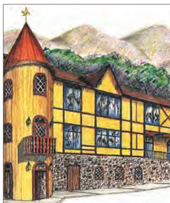
Map Location 76