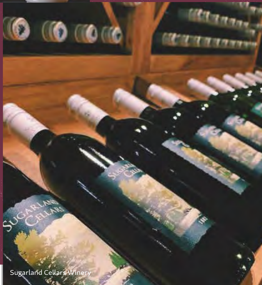
Sugarland Cellars Winery

Calling all vinophiles! While everyone knows about Napa and Sonoma and all the other famous West Coast valleys that produce so much of our nation's wine, Gatlinburg is a hidden gem, known only to those curious enough to try something off the beaten vineyard. A walkable city center makes winery hopping convenient and much safer than the alternatives, too. In fact, nearly all of our wineries, including Sugarland Cellars, Little Bear Winery, and Tennessee Homemade Wines, are located right on the Parkway—some even within a bottle or two's distance of each other. Whether you're in town for a girls' getaway or a romantic weekend, don't put a cork in your stay until you've treated yourself to a glass or two of something special that proves you can get good wine east of the Mississippi—if you know where to look.