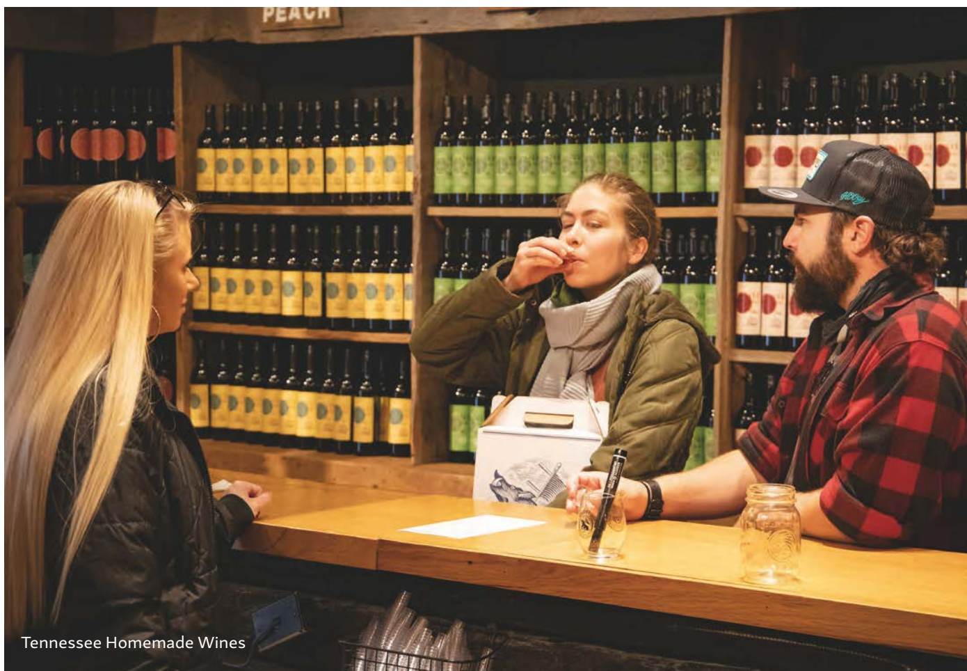
Tennessee Homemade Wines