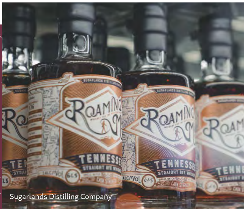
Sugarlands Distilling Company