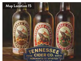
Map Location 15

Tennessee Cider Company, Gatlinburg's first true Cidery, located in the heart of downtown. It's an Old General Store feel with incredible locally made Ciders and wet goods made by great local folks.