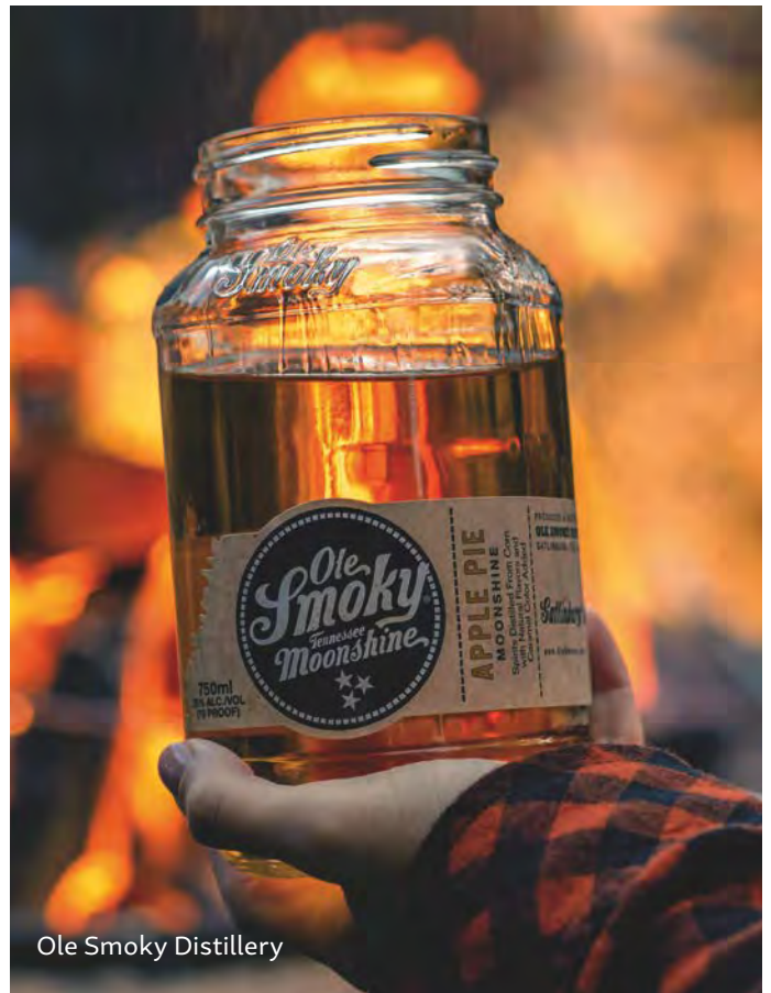
Ole Smoky Distillery

643 Parkway (865) 412-1030 tnhomemadewines.com Rooted deep in family tradition, Tennessee Homemade Wines is a true taste of Gatlinburg. Made with local fruit, crafted by local folk, and served by local friends. Stop in for free tasting. Open 7 days a week.