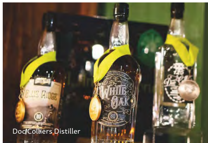
Dod Colliers Distiller

888-765-9463 • 865-436-7551 • smokymountainwinery.net