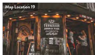
Map Location 19