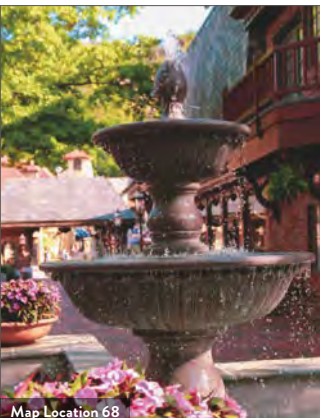
Map Location 68

Mountain Mall #B7 611 Parkway, Gatlinburg, TN 37738 865-436-4202