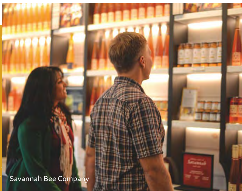
Savannah Bee Company