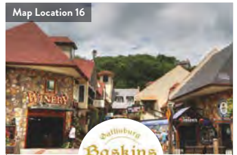
Map Location 16

Claire's, God's World, New Orleans Sandwich Co, TN Jeds, The Jerky Store, Little Bear Winery, Mountain Edge Grill, The Potter and The Park