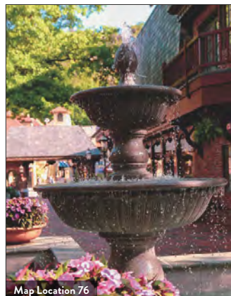
Map Location 76