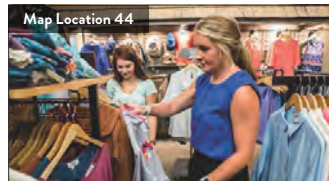
Map Location 44