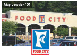
Map Location 101

Located on Hwy 321 across from Gatlinburg Post Office. Food City is Gatlinburg's everyday low price supermarket. Featuring Certified Angus Beef, pharmacy, floral, bakery/deli, salad bar, sushi, picnic supplies, full line of groceries and a fuel station.