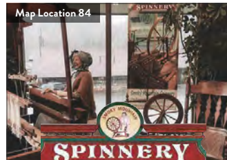
Map Location 84

Spinning, Weaving, Knitting, Crocheting, Rug Hooking, Felting, Dyeing Equipment & Supplies. Classes & Demonstrations. Gifts & Antiques