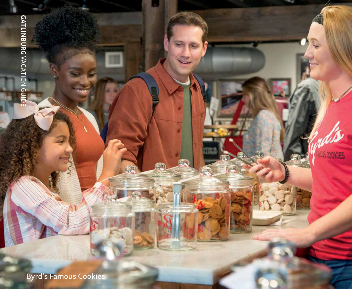
Byrd's Famous Cookies

According to Cheapism.com, Gatlinburg is the shopping mecca of Tennessee.