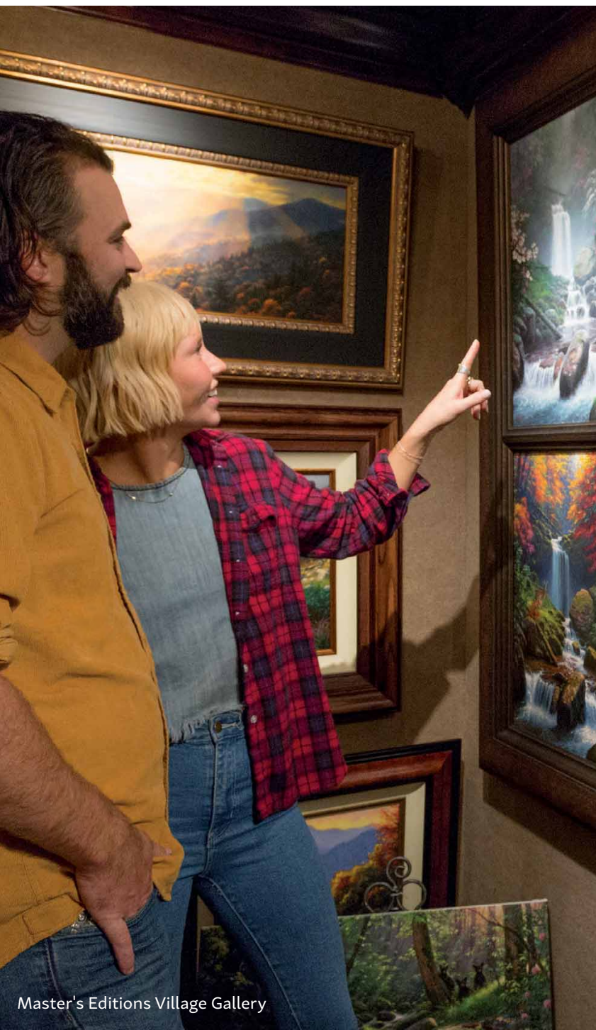
Master's Editions Village Gallery