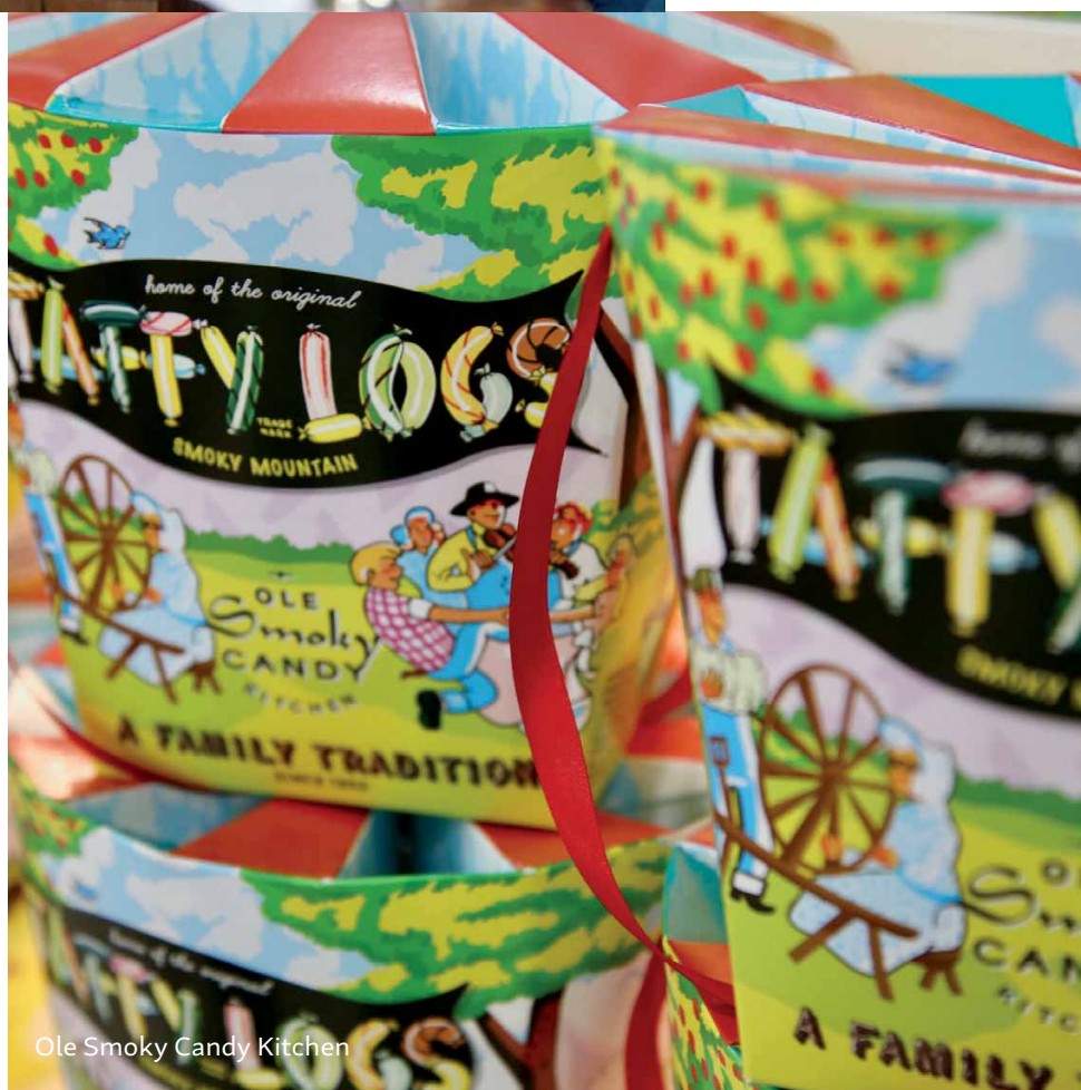
Ole Smoky Candy Kitchen

For a strategic approach to shopping, we suggest concentrating your efforts on these key locations: the eight-mile Great Smoky Arts and Crafts Community loop and the Parkway in Downtown Gatlinburg. On the loop, you'll find galleries and studios galore - all home to handmade keepsakes from over 100 local artists and craftspeople. Then make your way toward our city center and stroll the Parkway where you will discover boutiques, eateries and uniquely themed shops at our atypical take on a shopping mall. We have 9, but who's counting?