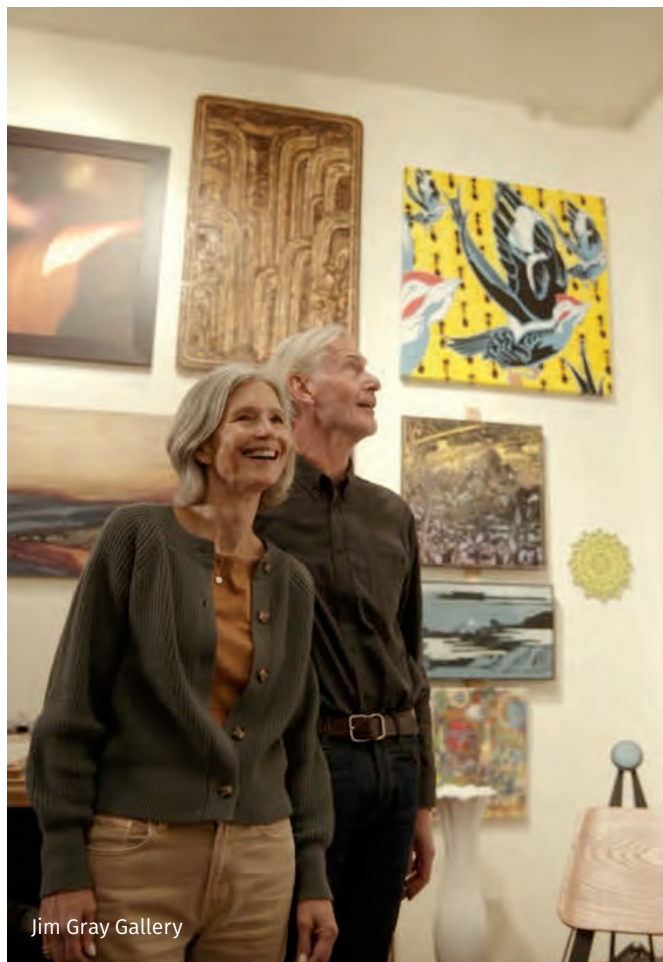
Jim Gray Gallery

Ceramicists, glassblowers, and painters of all kinds, you'll find a maker for every type of medium along the community's eight-mile loop of studios, shops, and galleries. If you're lucky, you'll even get to witness one of them in action, creating their next masterpiece or demonstrating the techniques they've been honing their whole lives. It's a truly remarkable sight, so be sure to stop by!