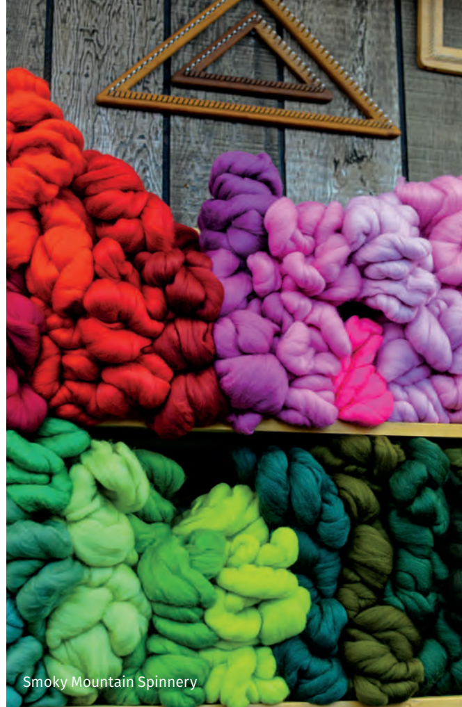
Smoky Mountain Spinnery

Ceramicists, glassblowers, and painters of all kinds, you'll find a maker for every type of medium along the community's eight-mile loop of studios, shops, and galleries. If you're lucky, you'll even get to witness one of them in action, creating their next masterpiece or demonstrating the techniques they've been honing their whole lives. It's a truly remarkable sight, so be sure to stop by!