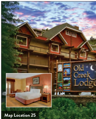
Map Location 25