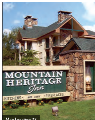
Map Location 23