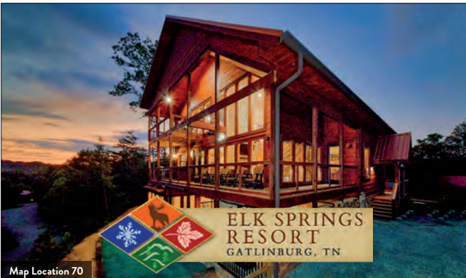
Map Location 70