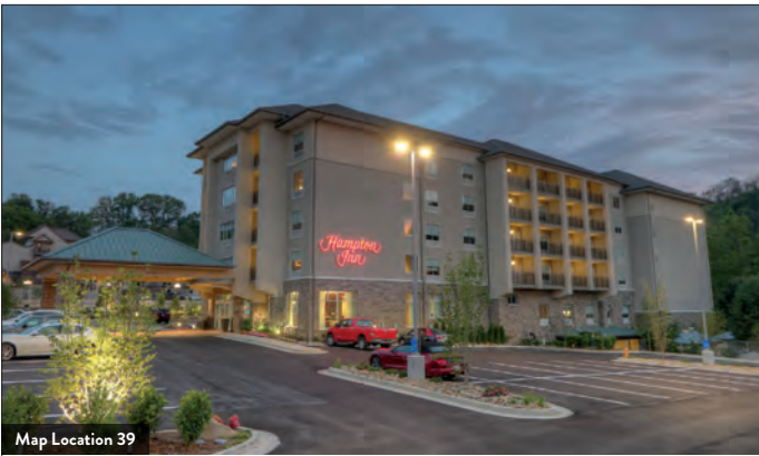
Map Location 39