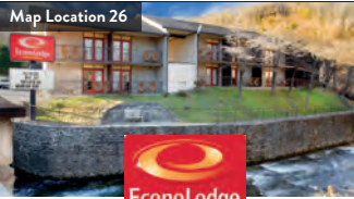
Map Location 26

Econo Lodge on the River is walking distance to downtown Gatlinburg attractions, shops and restaurants. Enjoy a quiet, relaxing stay in one of our river view rooms or suites. We offer an Easy-Start Continental Breakfast daily for our guests. We look forward to serving you with the superior stay you deserve and hope to become your home away from home. See you soon!