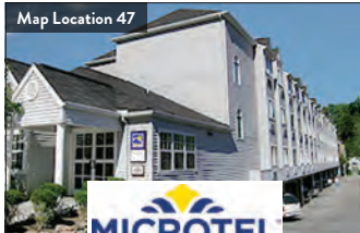
Map Location 47

888-447-0222 • 865-430-4200 margaritavilleresortgatlinburg.com