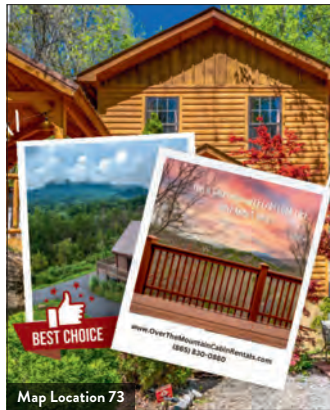
Map Location 73