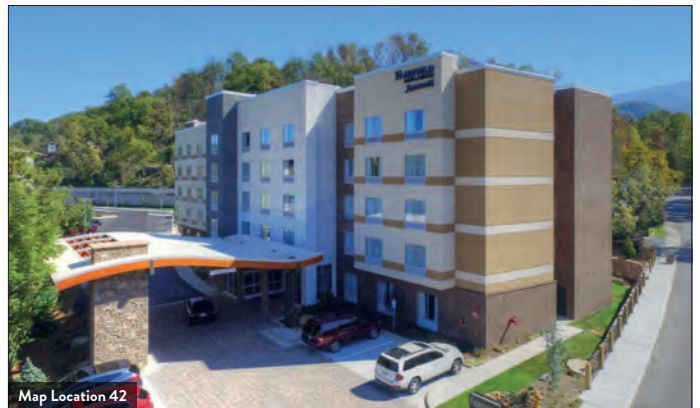
Map Location 42