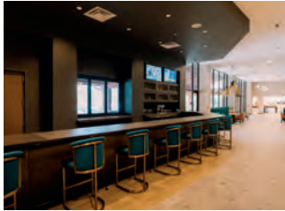
Map Location 40

Gatlinburg's brand-new resort hotel, which borders Great Smoky Mountains National Park! Upscale accommodations with superior amenities; resort style outdoor pool with spiral slide, lazy river, indoor pool, outdoor hot tub, multiple firepits, and activity lawn. On-site restaurant & bar, serving lunch & dinner, featuring Appalachian fare. Hotel offers; complimentary cook-to-order breakfast, daily evening reception, Wi-Fi, and parking. Visit the Guide Room to book your outdoor excursions and stop by Sugarlands for a specialty coffee, ice cream or local hand-made gifts. Hotel is just minutes away from Gatlinburg Convention Center and downtown parkway. Located on the Gatlinburg Trolley route. On-site catering available with 12,800 sq. ft. of meeting space.