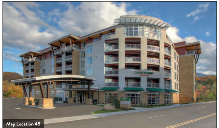
Map Location 45