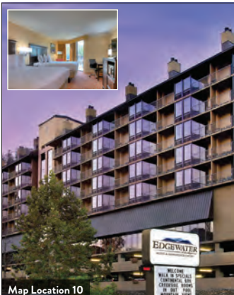
Map Location 10