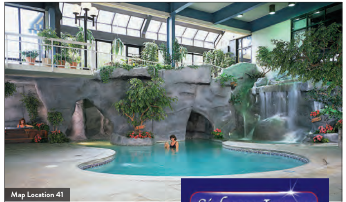
Map Location 41