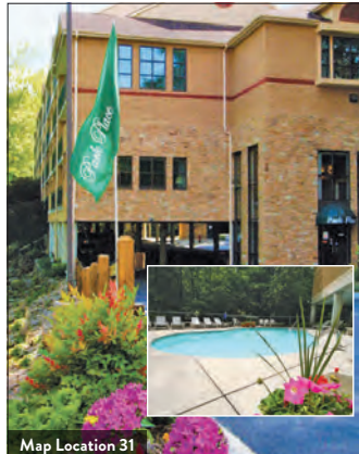
Map Location 31

800-883-7134 • 865-436-5926 smcrentals.com