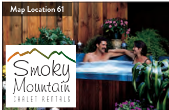
Map Location 61

800-210-8789 vacationrentalsingatlinburg.com