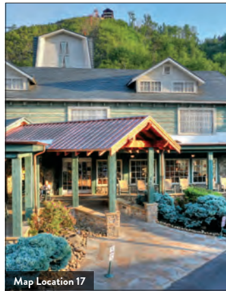
Map Location 17

865-436-4933 • GatlinburgHistoricNatureTrail.HamptonByHilton.com