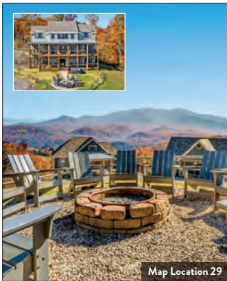
Map Location 29