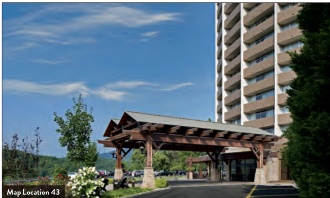
Map Location 43

866-766-5968 • 865-436-7851 • sidneyjames.com