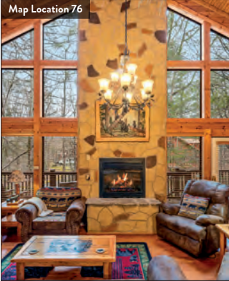
Map Location 76