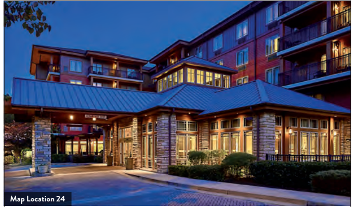
Map Location 24