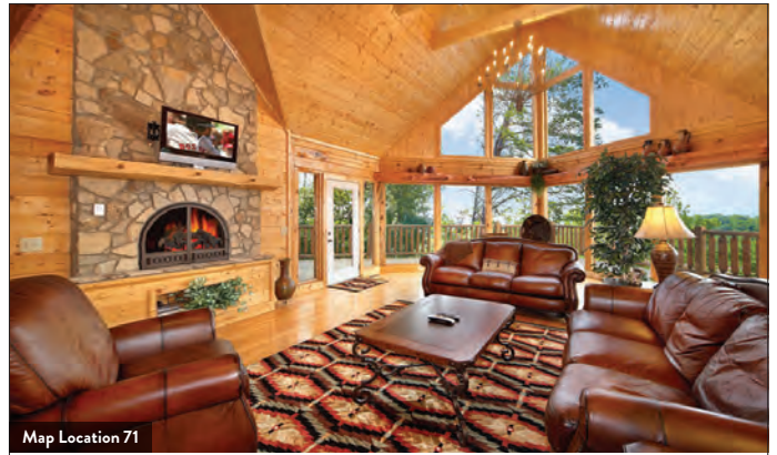
Map Location 71