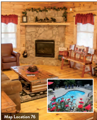
Map Location 76

865-830-0880 • OverTheMountainCabinRentals.com