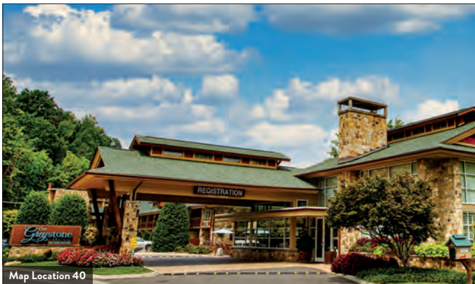
Map Location 40