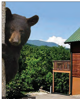
Map Location 75

865-436-6333 • 866-787-6659 • CabinsOfTheSmokyMountains.com