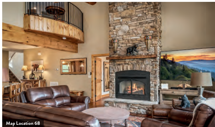
Map Location 68

888-468-1361 • 865-430-9201 • mtnshadows.com