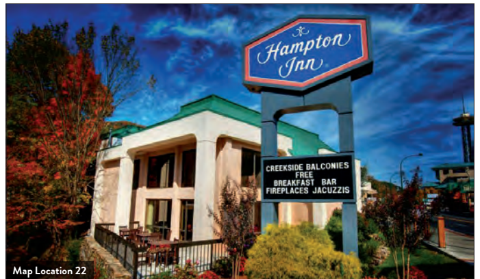
Map Location 22