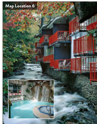
Map Location 6