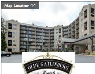
Map Location 44