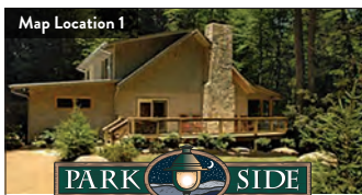
Map Location 1

800-798-9122 • 865-436-3901 honeymoonhills.com