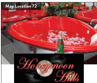
Map Location 72