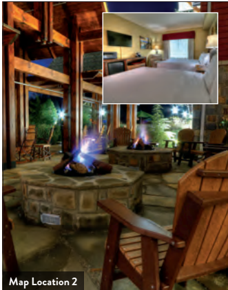
Map Location 2

865-430-7200 • 888-430-7200 • oldcreeklodgegatlinburg.com