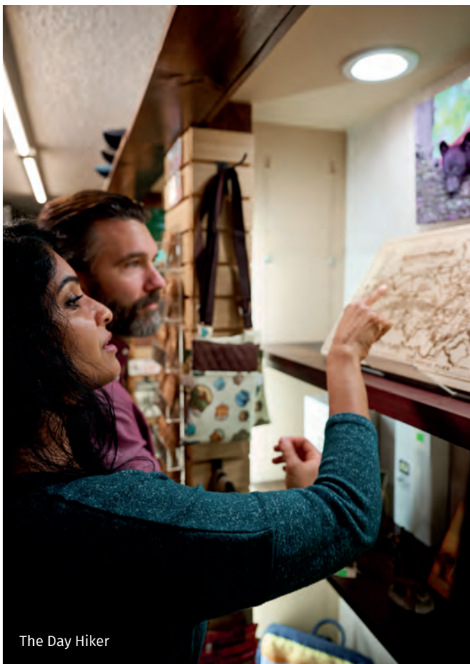
The Day Hiker