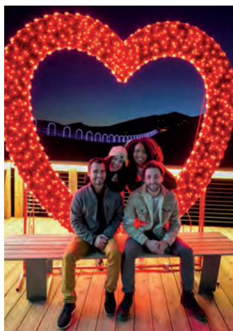
Map Location 72