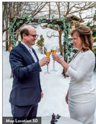
Map Location 30

849 Glades Road, Suite 2C6 (865) 436-8556 cupidspetalsflorist.com Gatlinburg's premier florist with more than 40 years of experience. Our design team can create unique and beautiful floral arrangements for your special occasions. We also offer gift baskets, silk flowers, balloons and unique gift ideas.