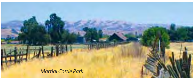
Martial Cottle Park

Santa Clara County acquired its first parkland in 1924, purchasing 400 acres near Cupertino which became Stevens Creek County Park.