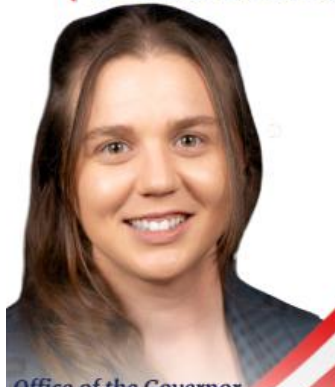
Office of the Governor Economic Development & Tourism

Presenting on National Travel Tourism Week and the Impact of Tourism in Texas