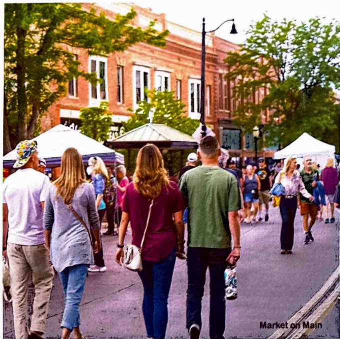
Market on Main