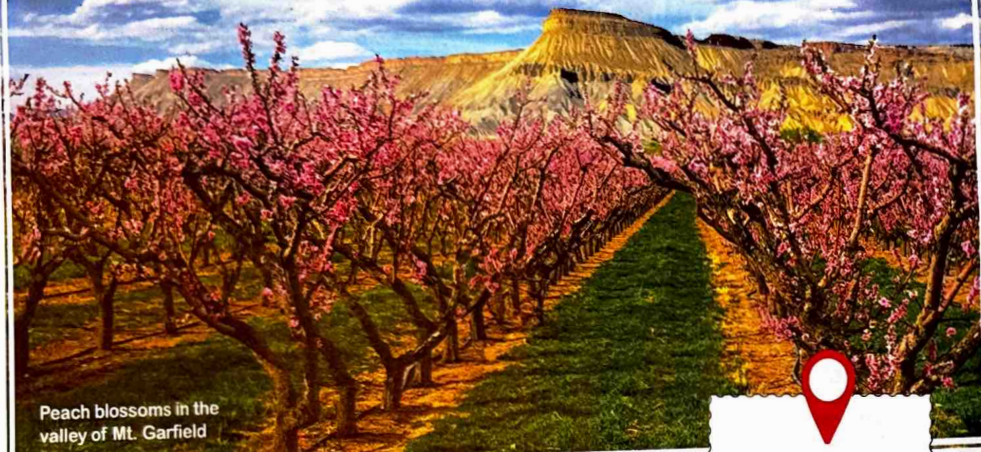
Peach blossoms in the valley of Mt. Garfield