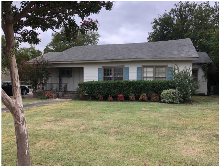
212 East Texas Street, photo 2019

The house has exposed rafter tails at the roof line. Overlay-siding has been placed over the original wood siding below. An inset porch has non-original wrought iron railing and porch columns.